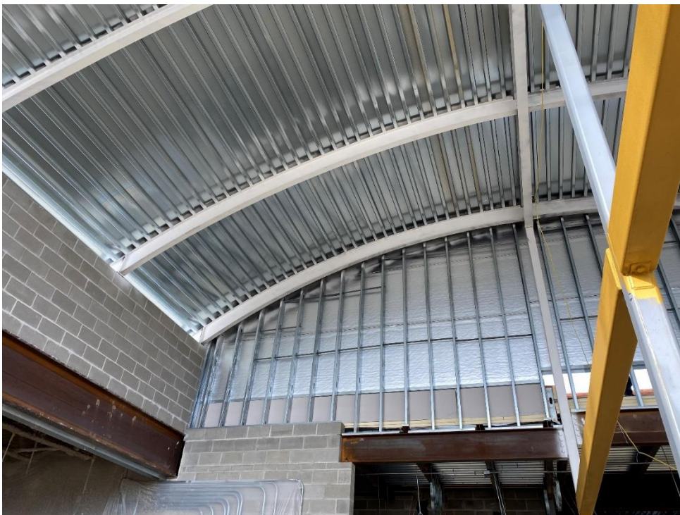
Prime painting of structural steel continues at the main entry.