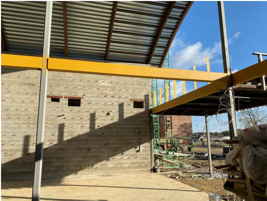
Prime painting of the tube steel framing at the main entry has started.