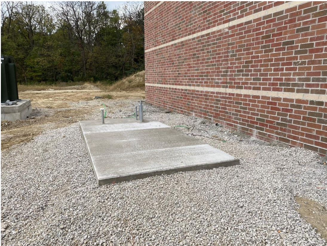
The stand-by generator pad is installed at the equipment yard south of the main mechanical room.