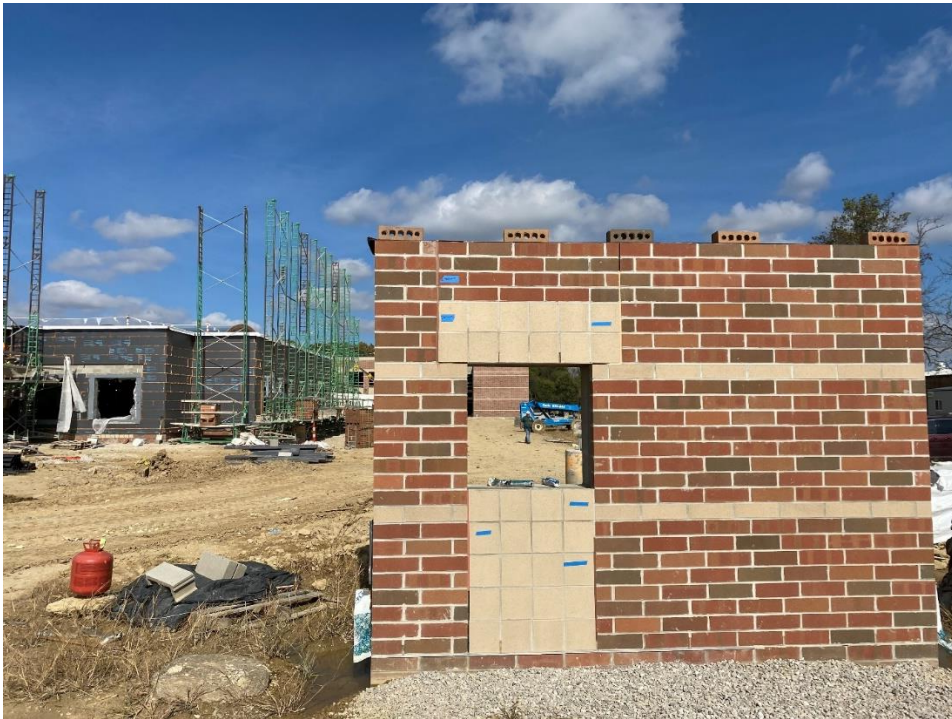
Additional sealant color samples installed.