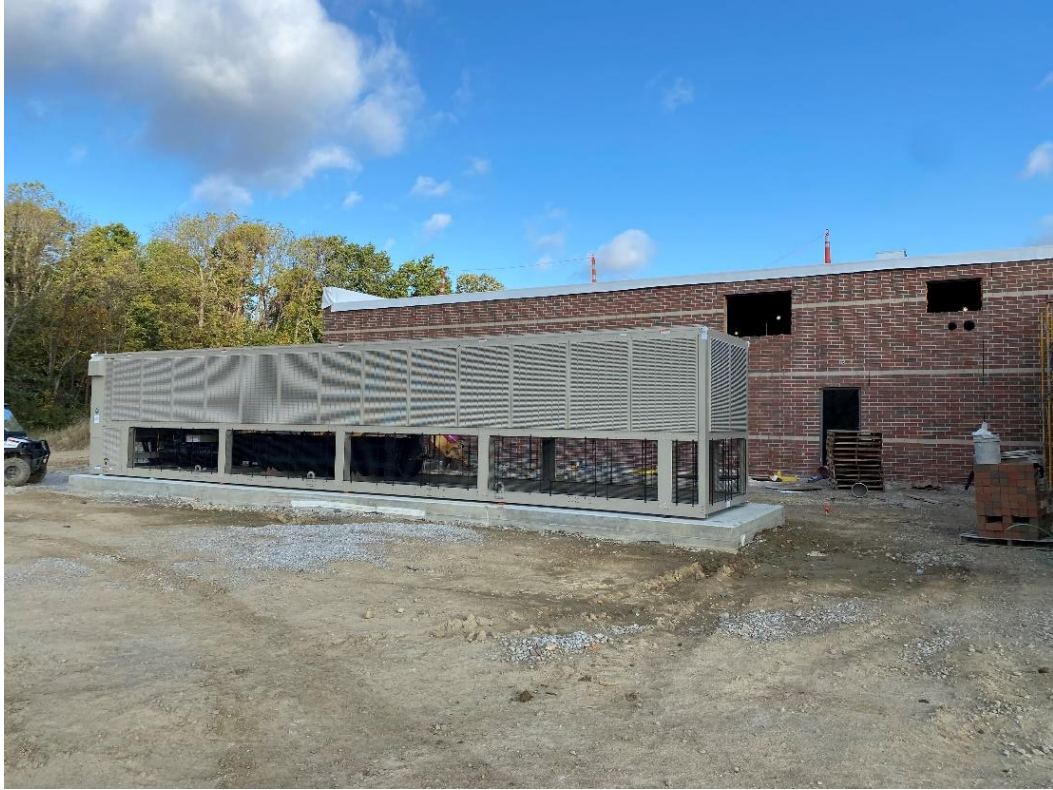
The chiller was installed on Monday in the equipment yard.