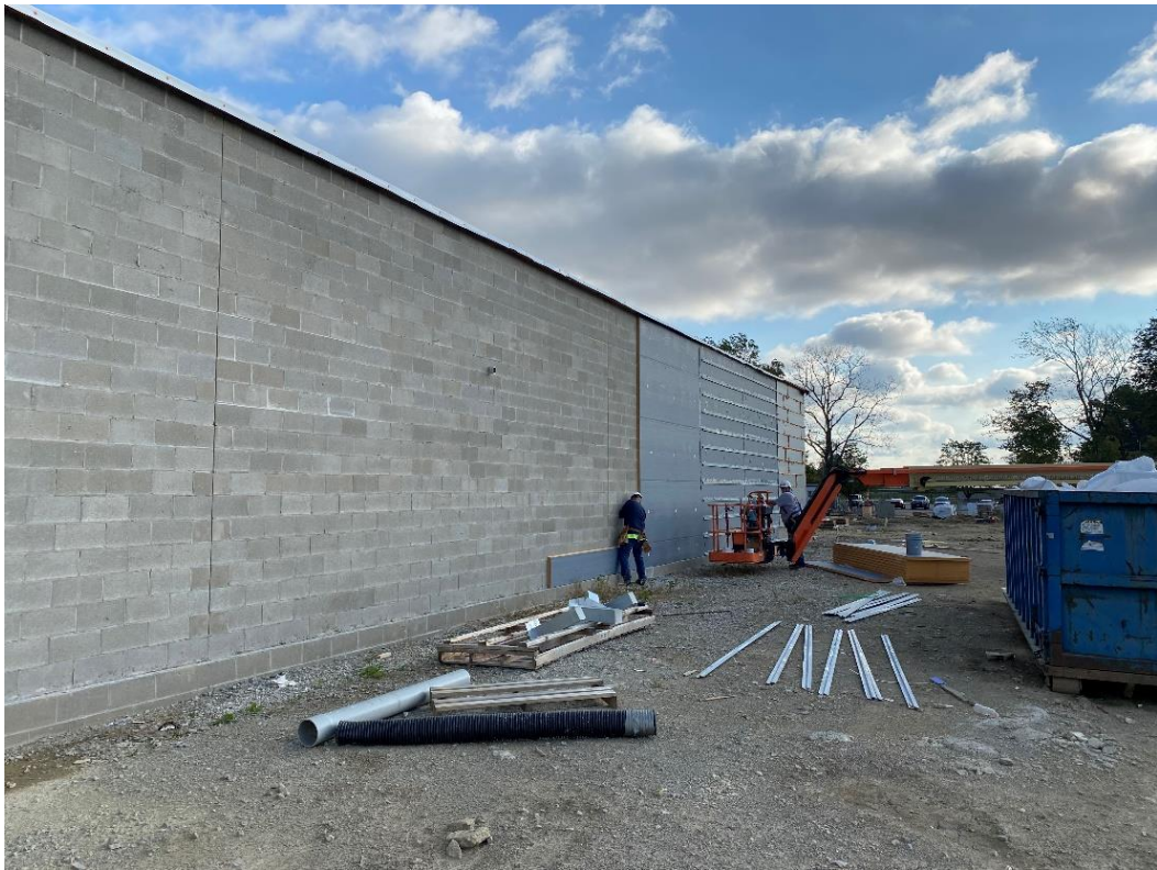
Installation of the air barrier insulation and "Z" furring is progressing on the south wall of the Locker rooms.