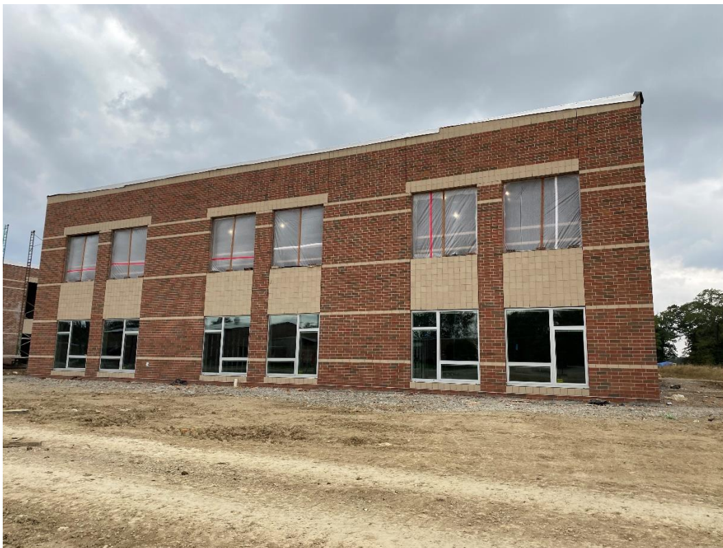
Windows are installed on the first-floor level, east side of Classroom Area D.