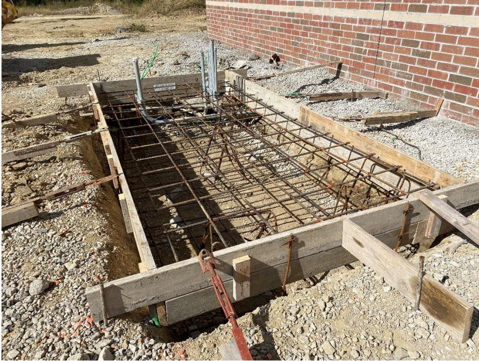
Reinforcing is in place for the generator pad.