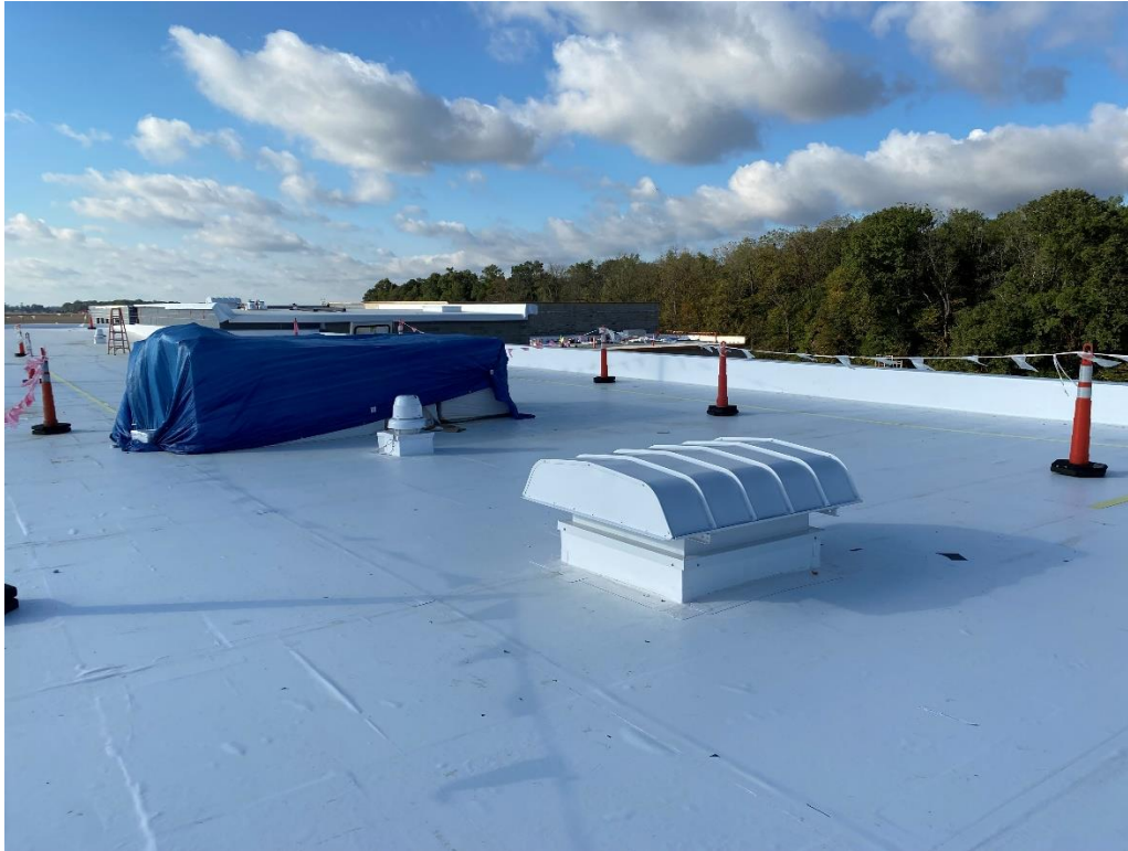
Exhaust fans and roof ventilators are installed on the roof of Areas C & D.