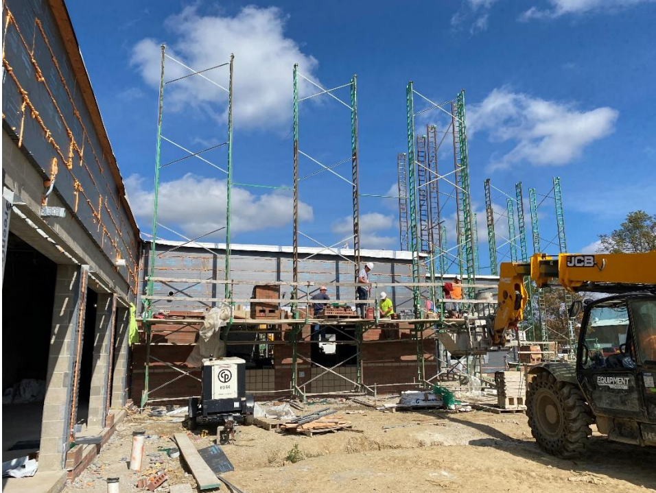
Brick veneer is about 60% complete on the south wall of the Administrative Offices.