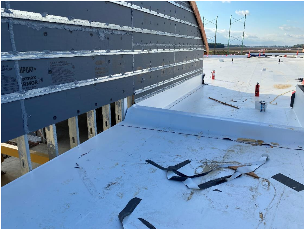
Base flashing is being installed on the west side of the barrel vaulted roof.