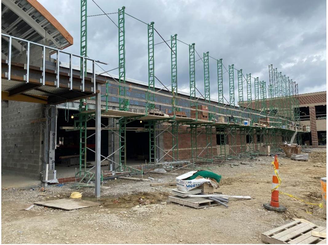
Brick veneer is about 2/3 complete at the east wall of Area B.