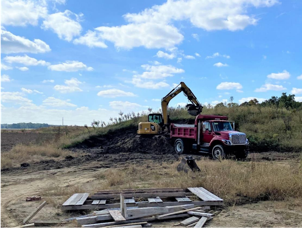
Stockpiled topsoil is being loaded for fill.