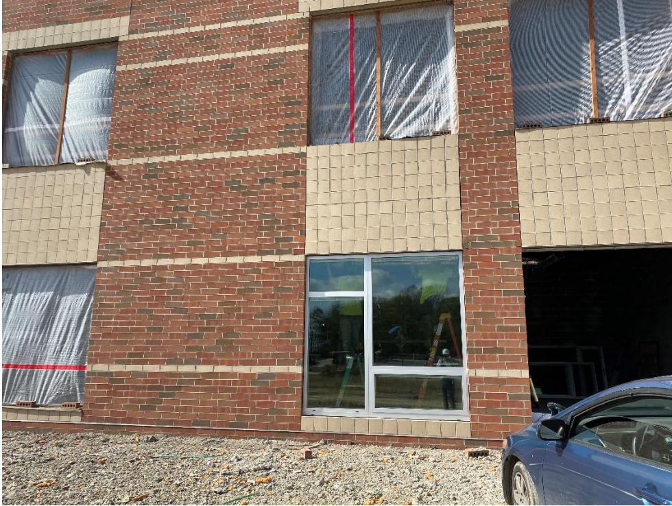
The first window is installed on the east wall of Classroom Area D.