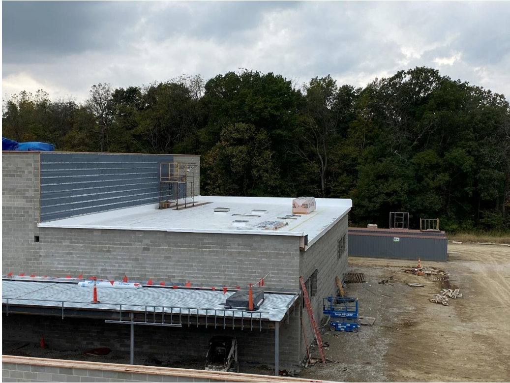
Roofing is complete at the music classroom at Area F.