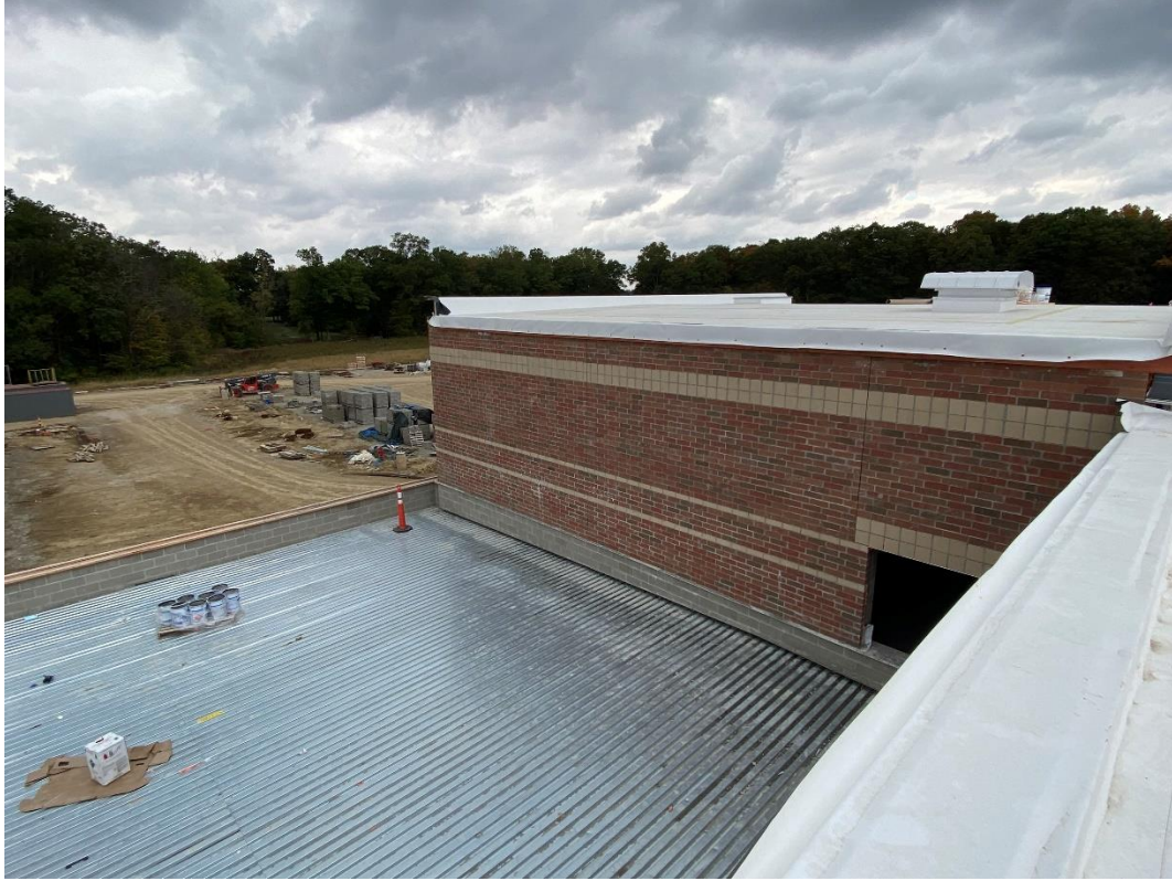
Brick veneer is complete above the roof line of Area C.