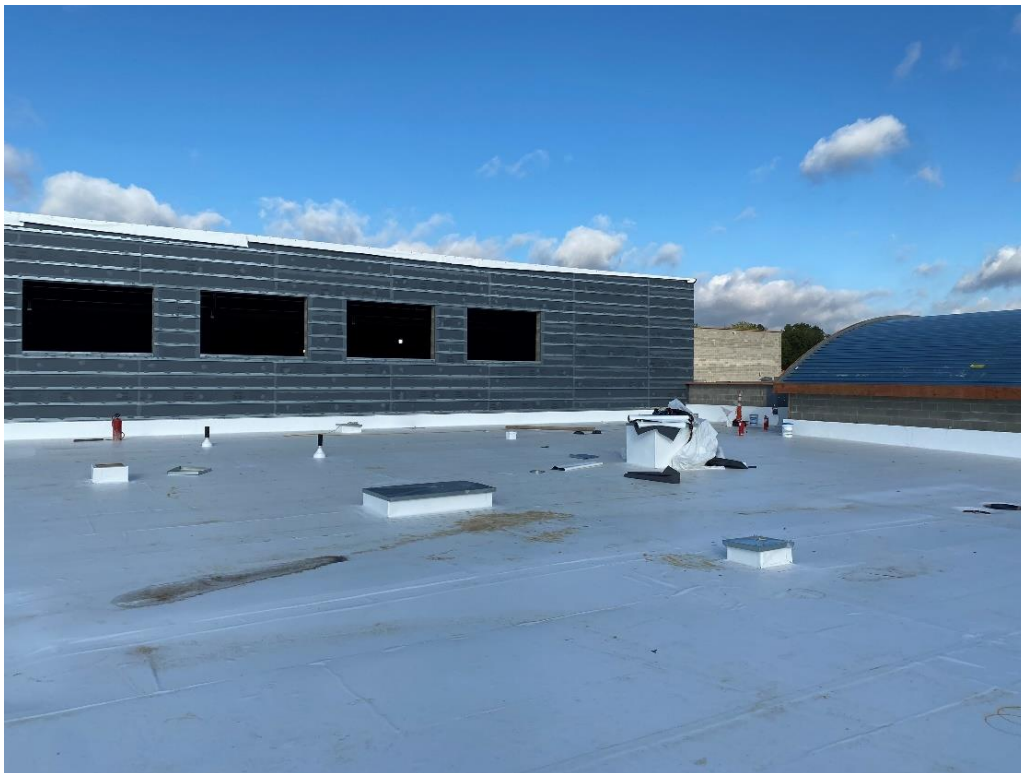
Area A roof looking NW toward the Gym and main entry.