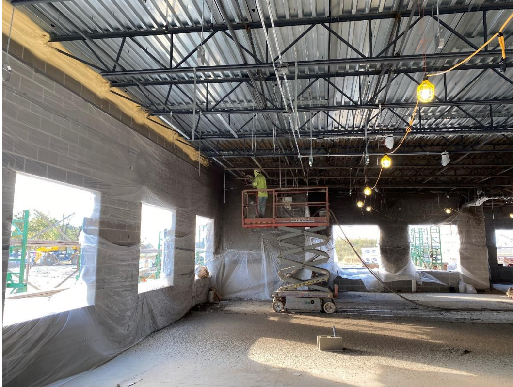
Fireproofing is about 60% complete in the administrative offices.