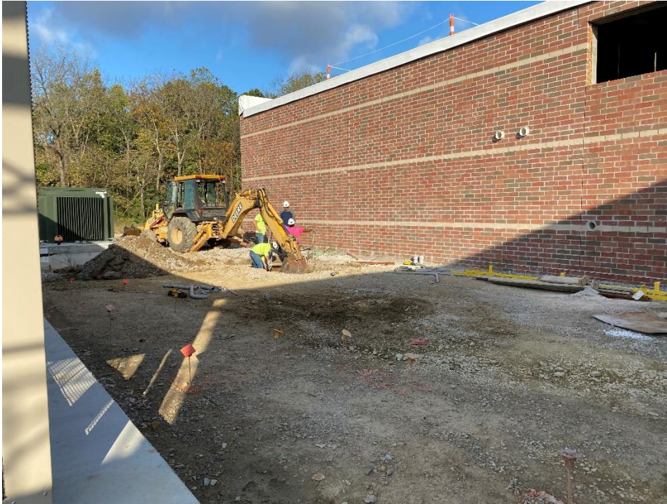
Excavation for the generator pad has started.