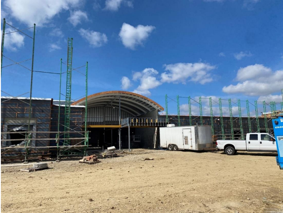
Spray foam insulation of stud cavities is being completed today at the north wall of the Student Dining.