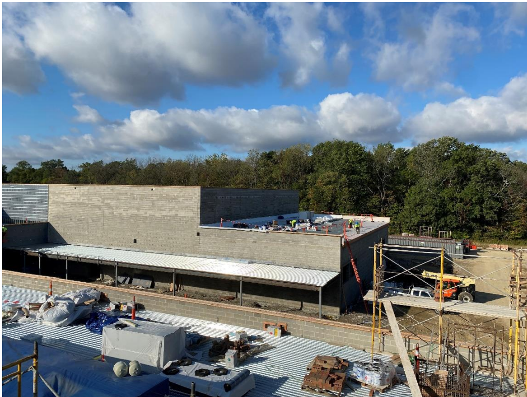
Roofing above the music classrooms in Area F has started and is about 30% complete.