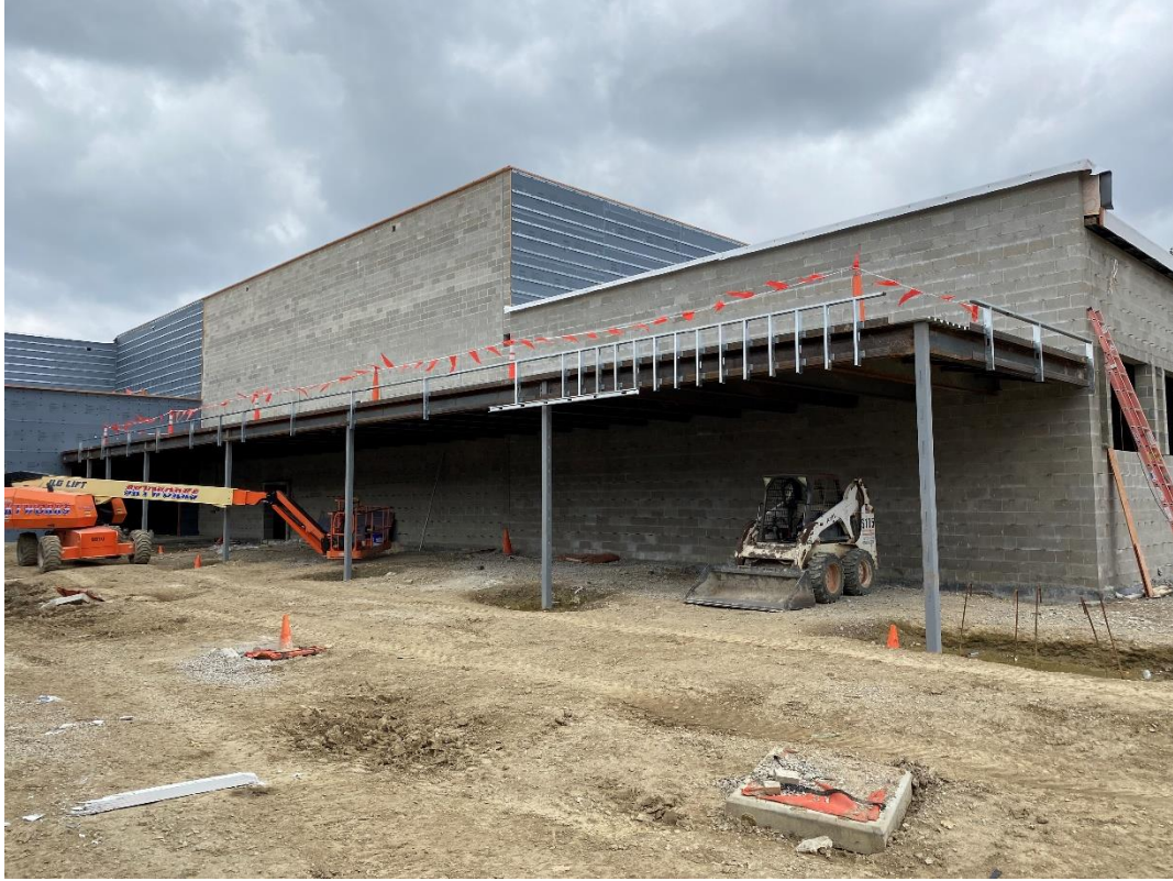
Light gauge metal framing of roof parapet walls progresses at the north entry canopy.