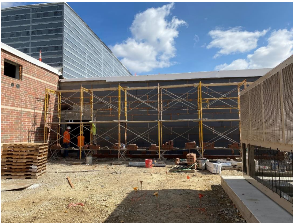
Brick veneer has started on the west wall of the locker Rooms.