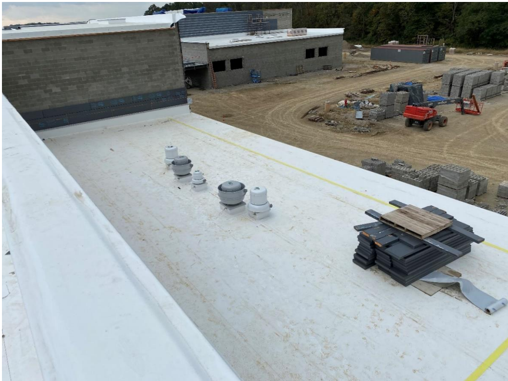
As roofing is completed, roof ventilators, exhaust fans and other roof top equipment is installed. Fans above the Science classrooms are shown here,