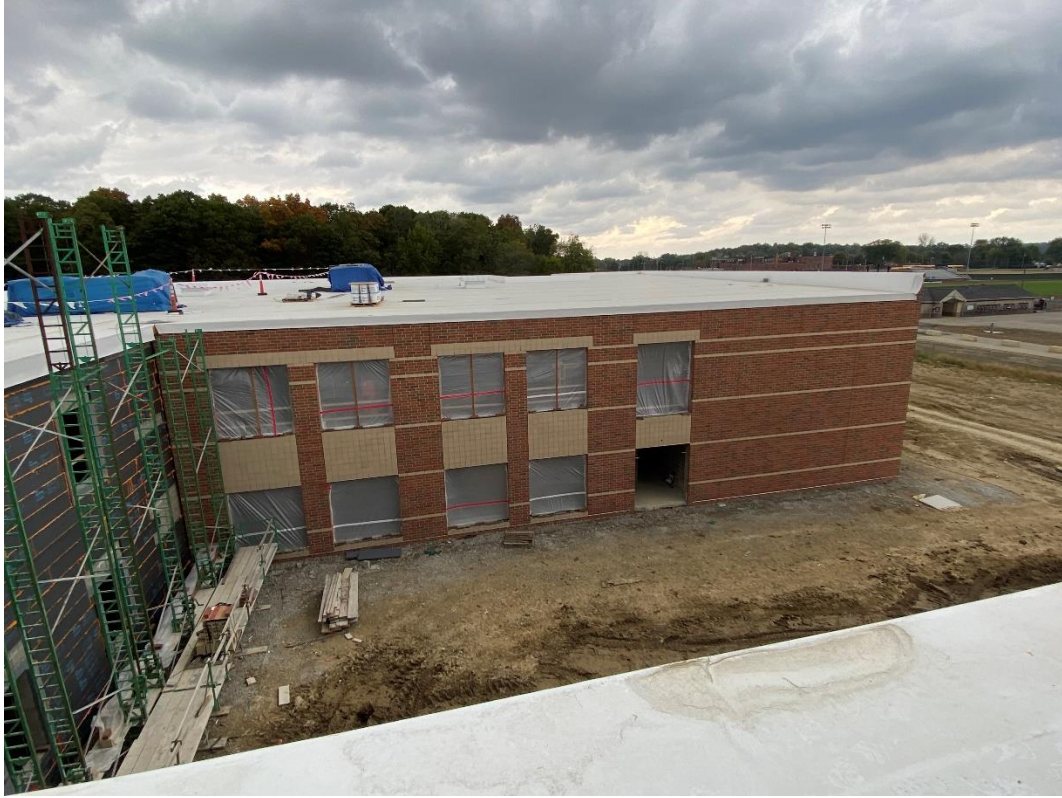
Brick veneer is cleaned on the south wall of Area D.