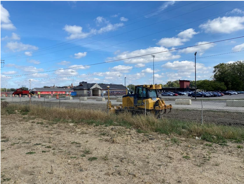
Topsoil is filled along each side of the main drive, fine graded, and prepared for seeding.