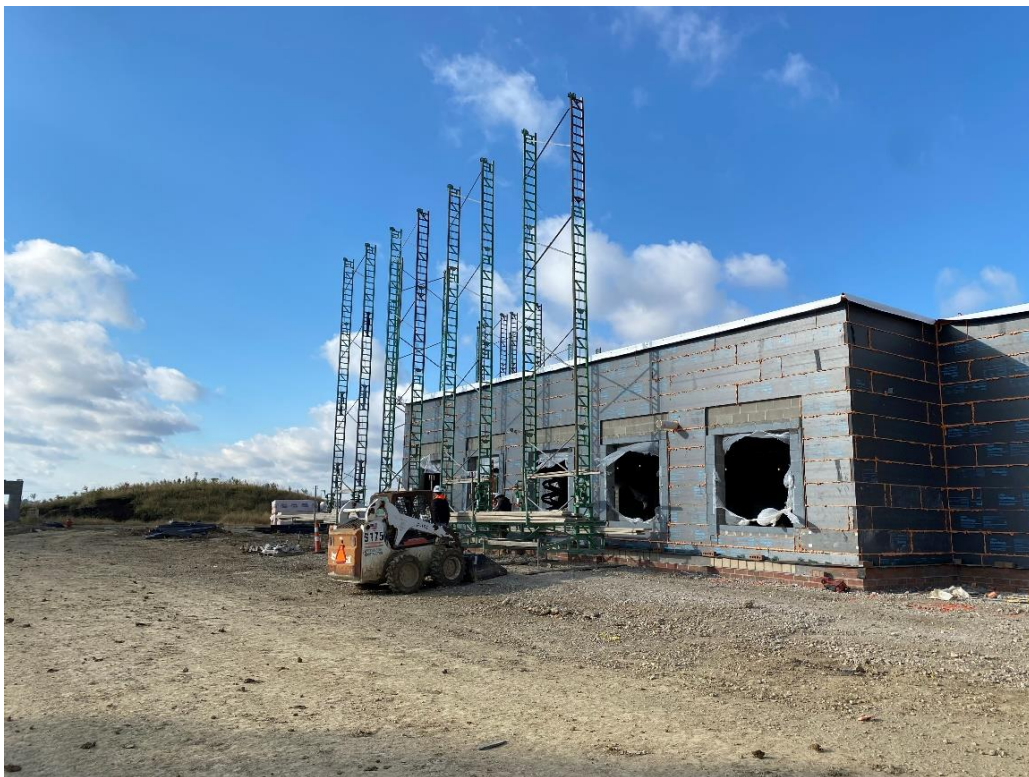
Scaffolding is being erected at the east wall of the administrative offices for continuing installation of brick veneer.