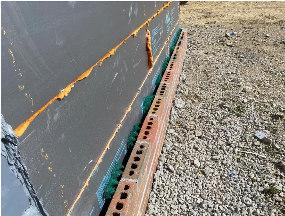
Base flashing and mortar net is installed at the south wall of the Locker Rooms.