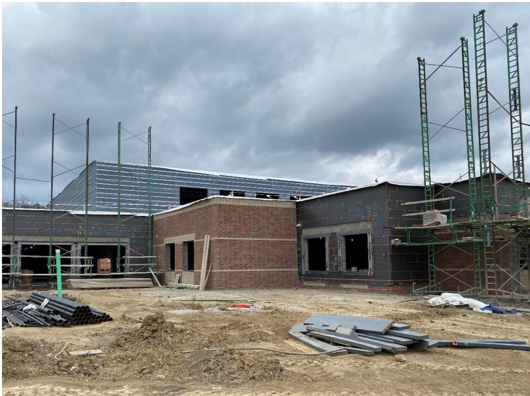
SE corner of Administrative Offices, Area A, is finished with brick veneer.