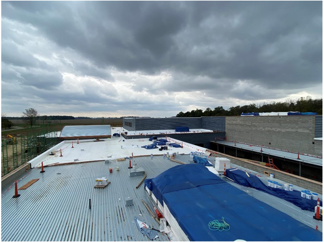
Roofing will proceed on the remainder of Area B now that the brick work above the roof line is complete.