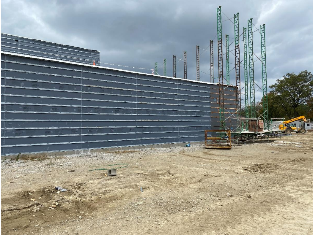
Air barrier and "Z" furring is finished on the south side of the locker rooms.