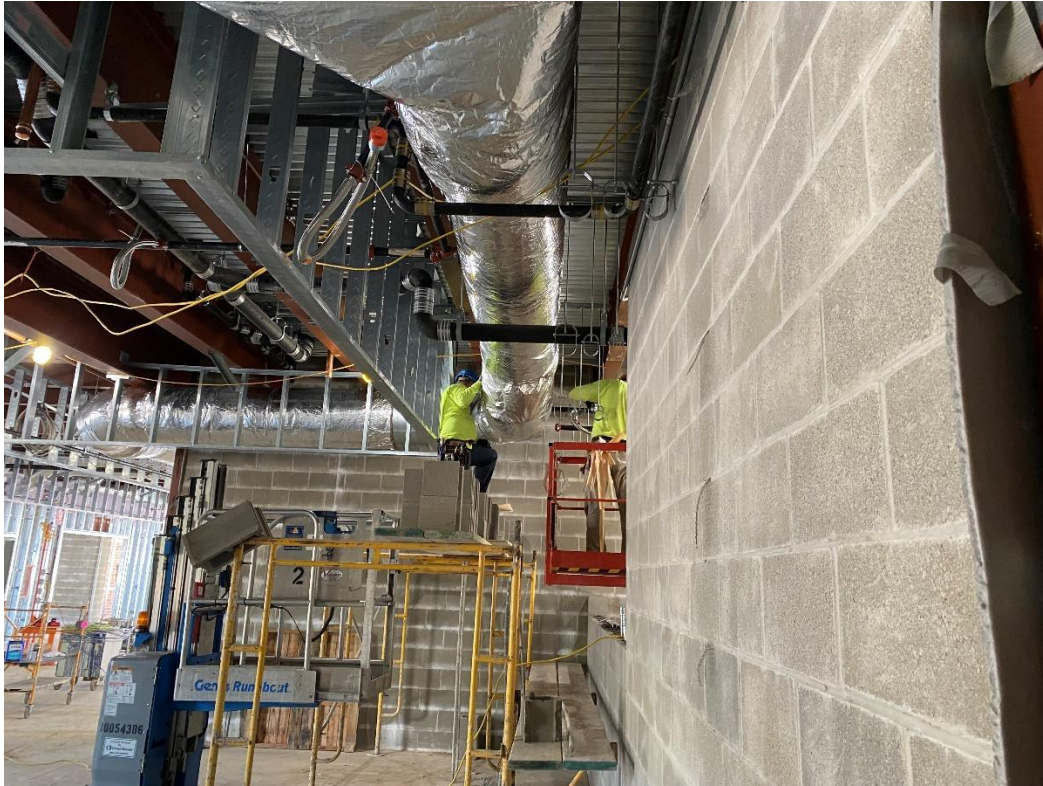
Insulating of spiral duct continues in Area D.