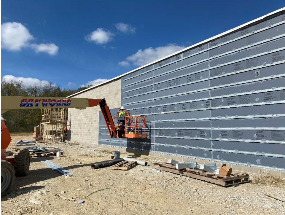
The air barrier and metal "Z" furring is about 2/3 complete on the south wall of the Locker Rooms.