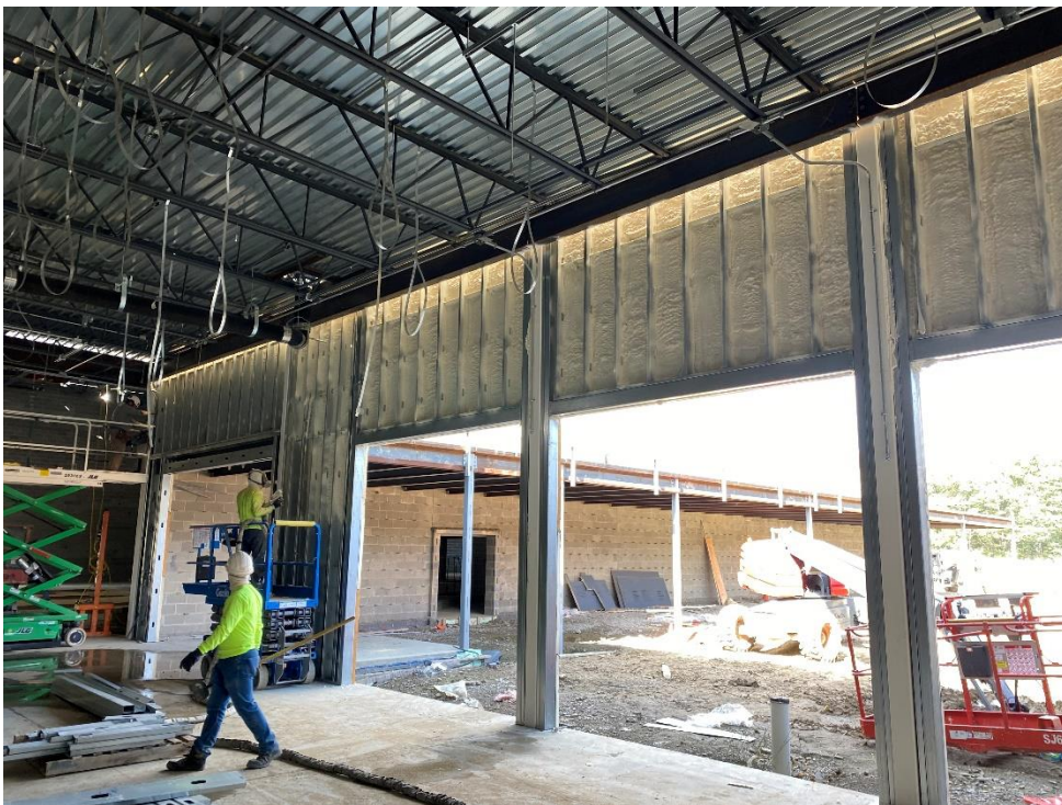
Spray foam insulation is being installed at the north wall of the Student Dining.