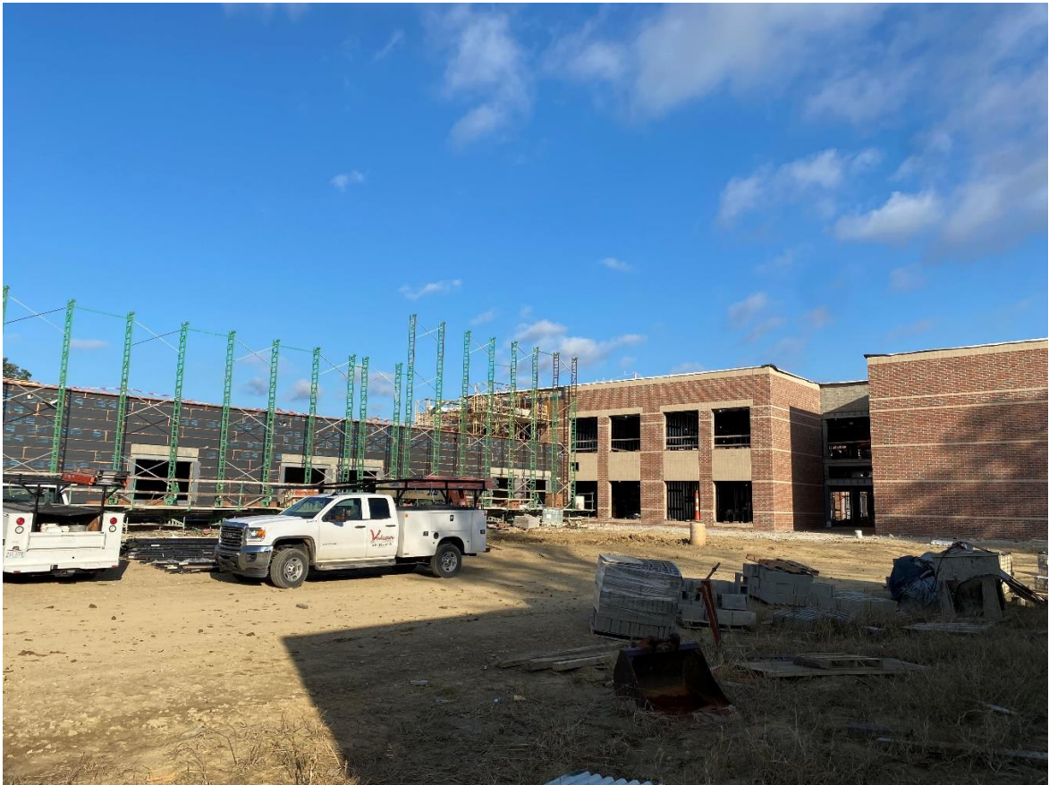
Brick veneer installation above the roof line at Area C is nearly complete.