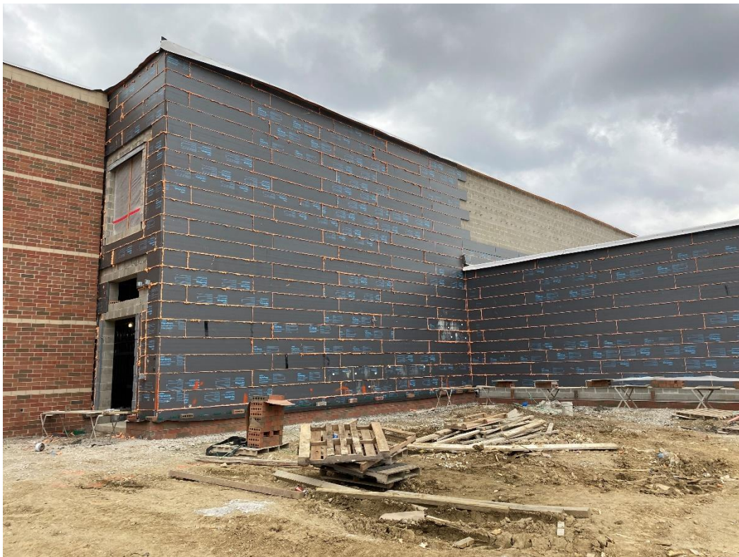
Air barrier and base flashing installation progresses at the west walls of Classroom Area D.