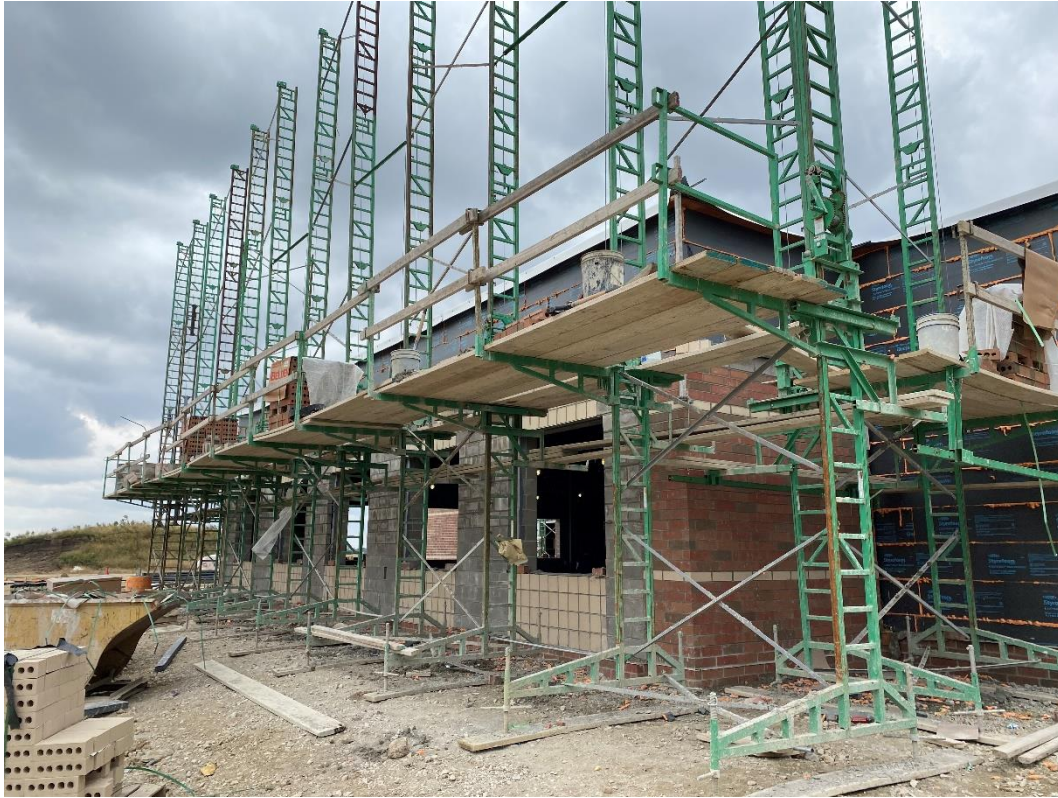
Brick veneer is about 2/3 complete at the east wall of Area A.