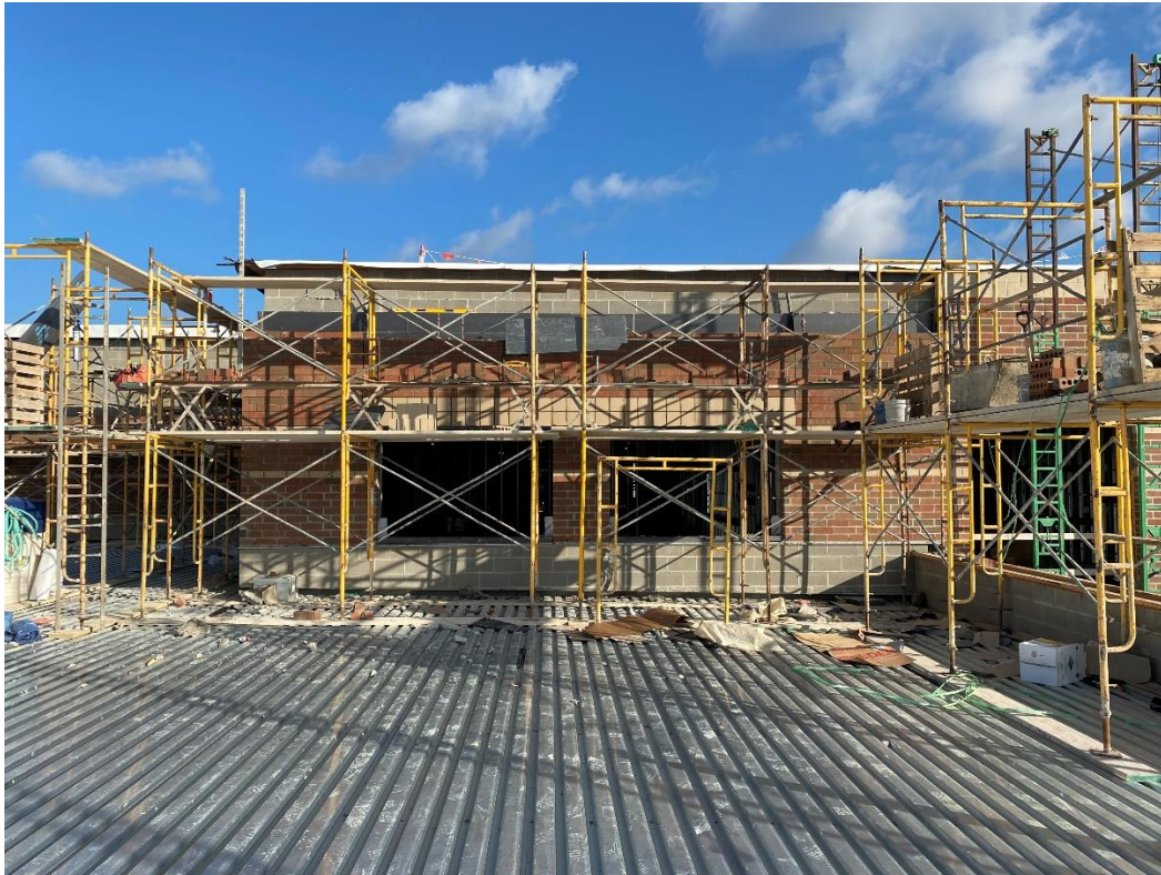
View of the south wall of Area C above the roofline. Brick work is about 75% complete.