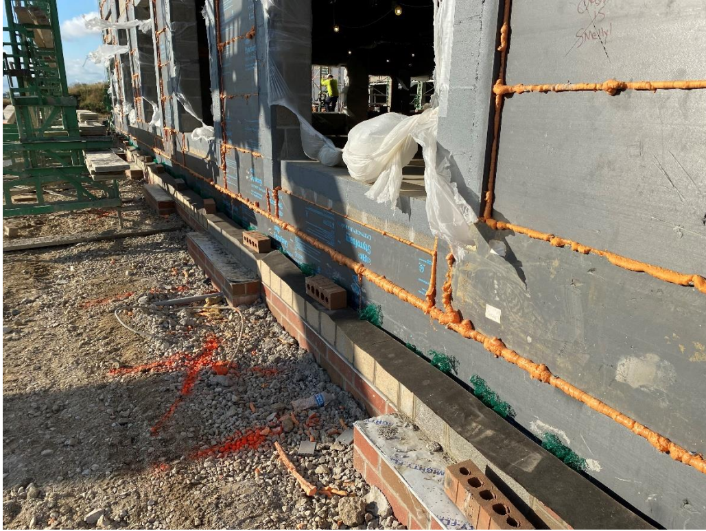
Base flashing and mortar net (green mesh) is installed at the east wall of the Administrative Offices.