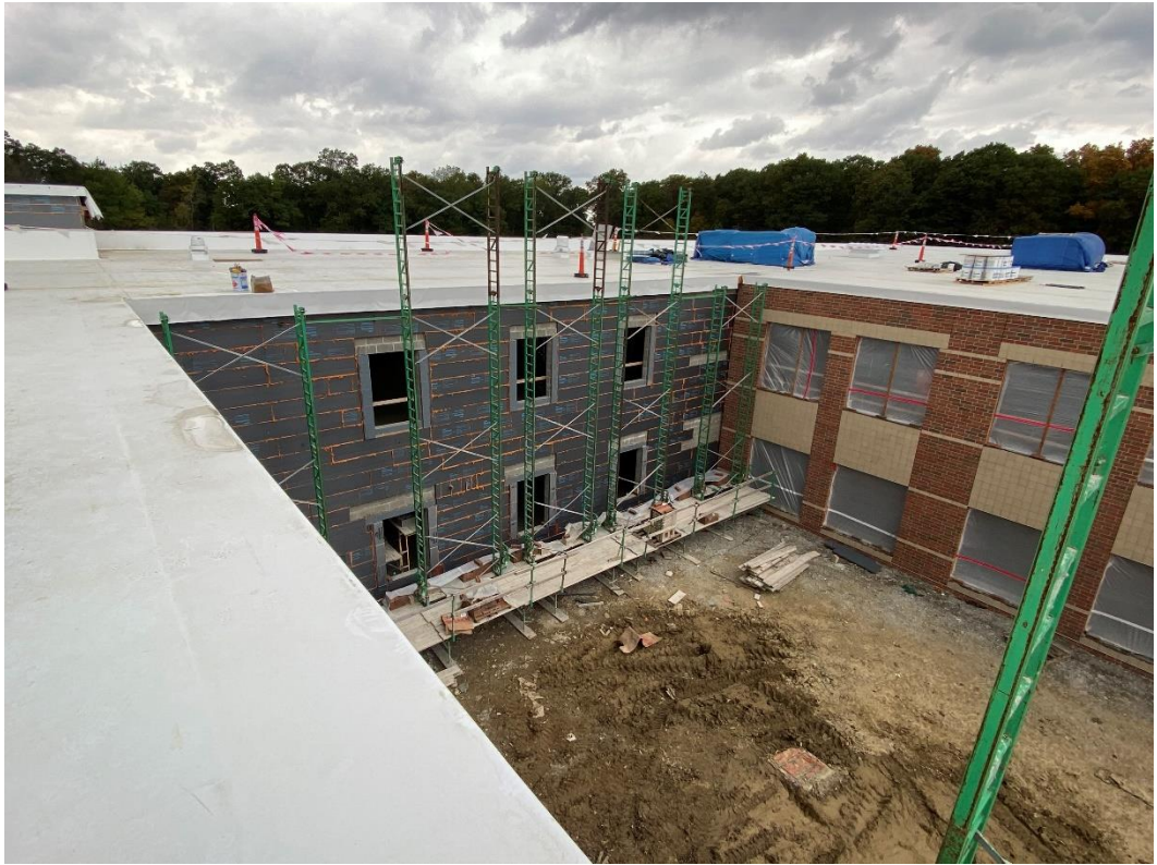
Scaffolding is moved to the east connecting wall between C & D for continuation of Brick veneer.