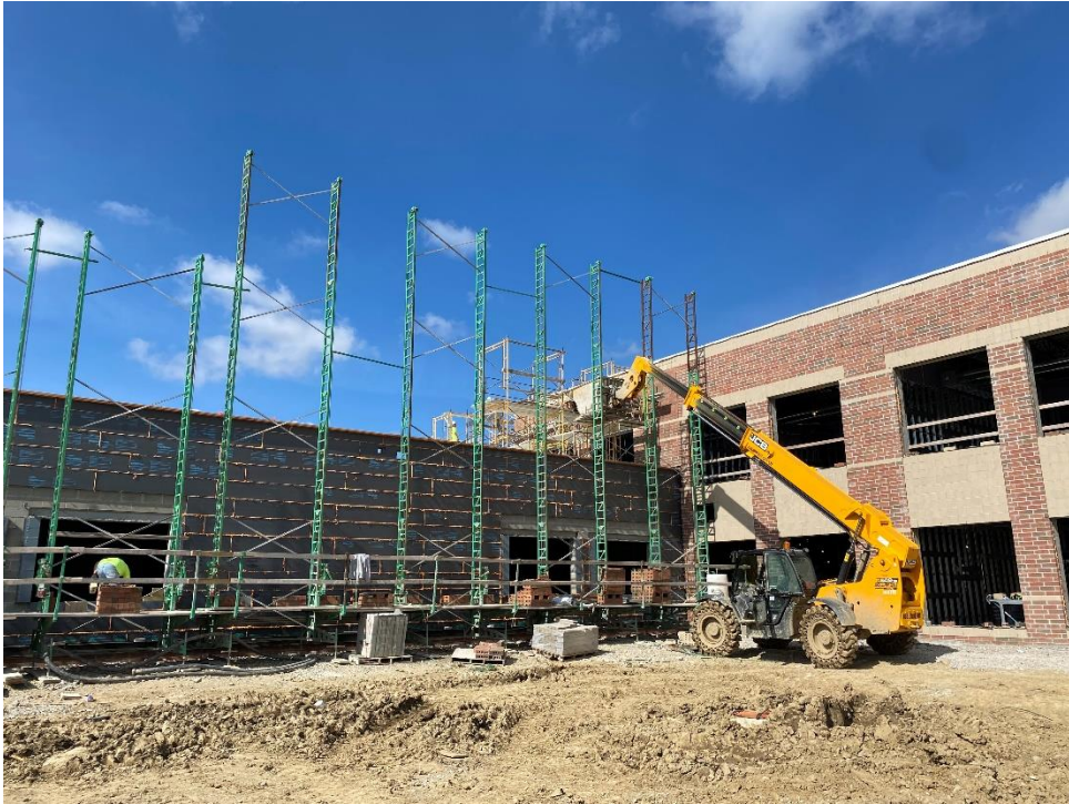
Brick veneer above the roof line at Area C will be completed today.