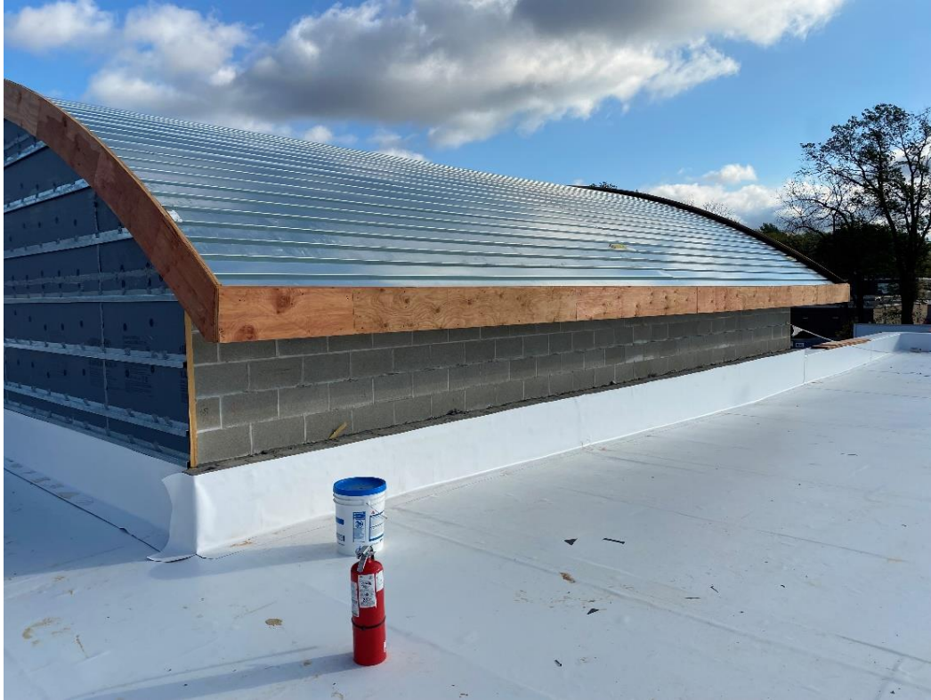
View looking NE at the barrel -vaulted roof of the main entry. This area will receive standing seam metal roofing.