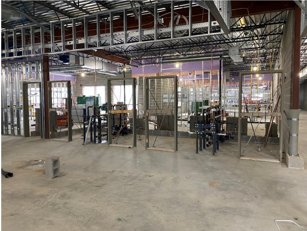
Hollow metal door frames are installed at the small toilet rooms at the second-floor level of Area D.