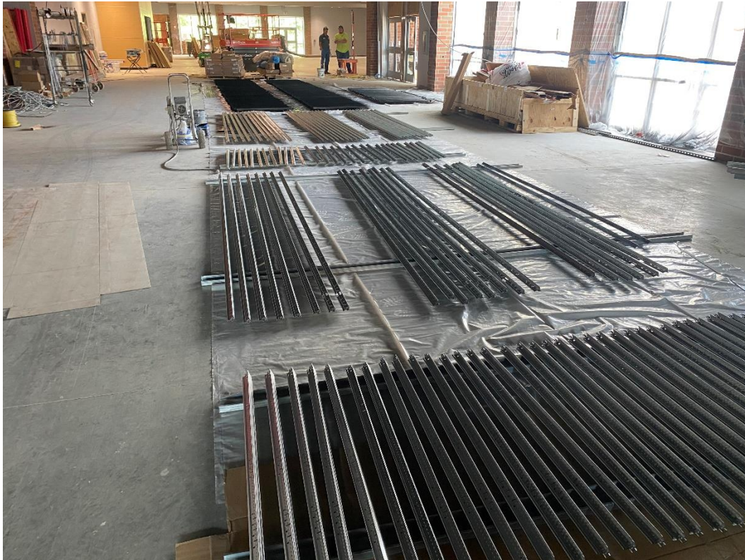
Ceiling system grid components for the Student Dining area are being painted black.