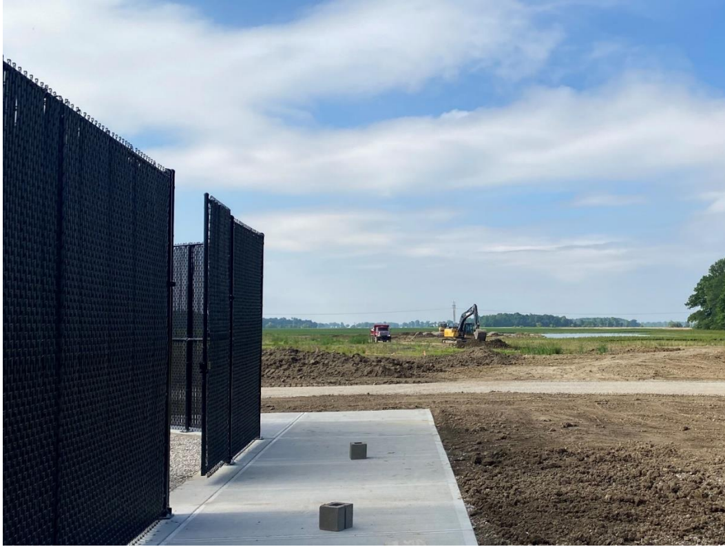
Topsoil is being placed and fine grading is being completed. Lawn areas are scheduled for seeding next week.