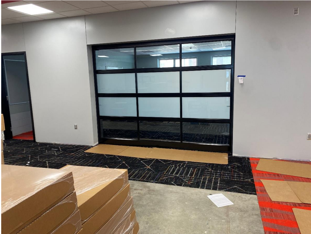
Installation of OH door to classrooms is complete.