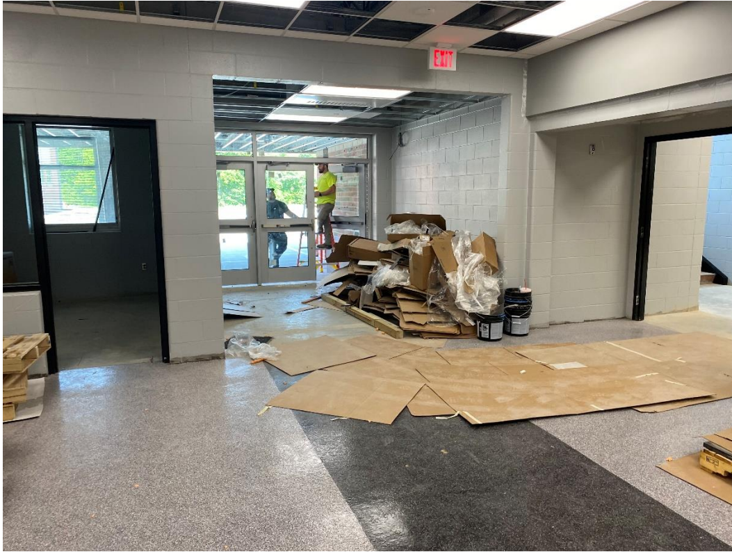
Aluminum entry doors are being installed at the west entry to Areas C & D.