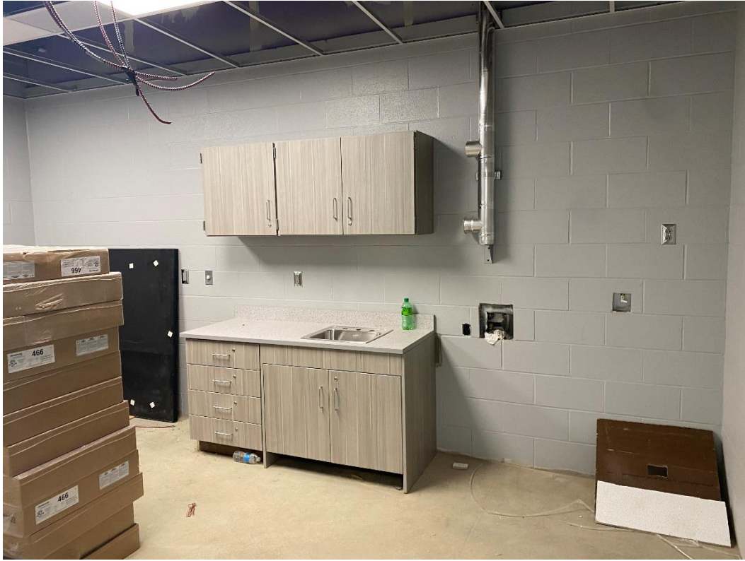
Cabinets and plumbing connections are complete in the Training Room. Washer and dryer connections are ready.