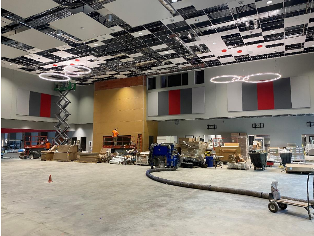
Lighting systems are being completed and the floor is being cleared for installation of the epoxy floor finish in the Performing Arts Center.