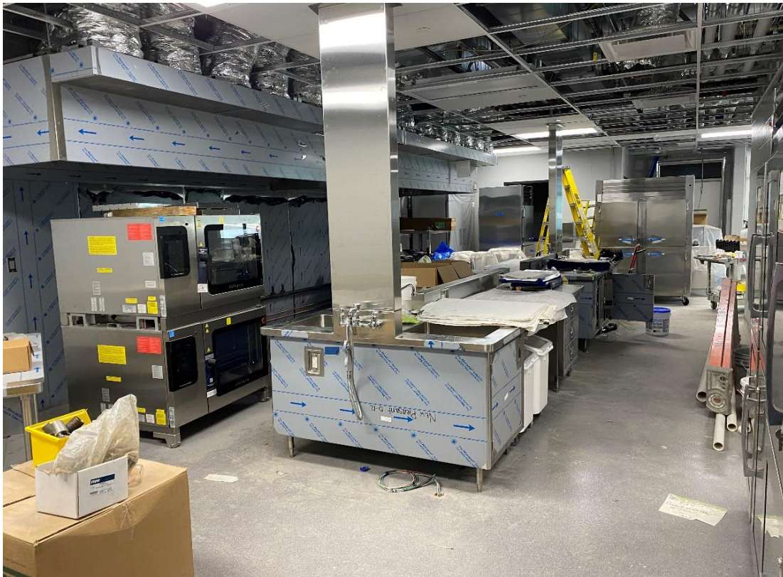
Installation of kitchen equipment continues.