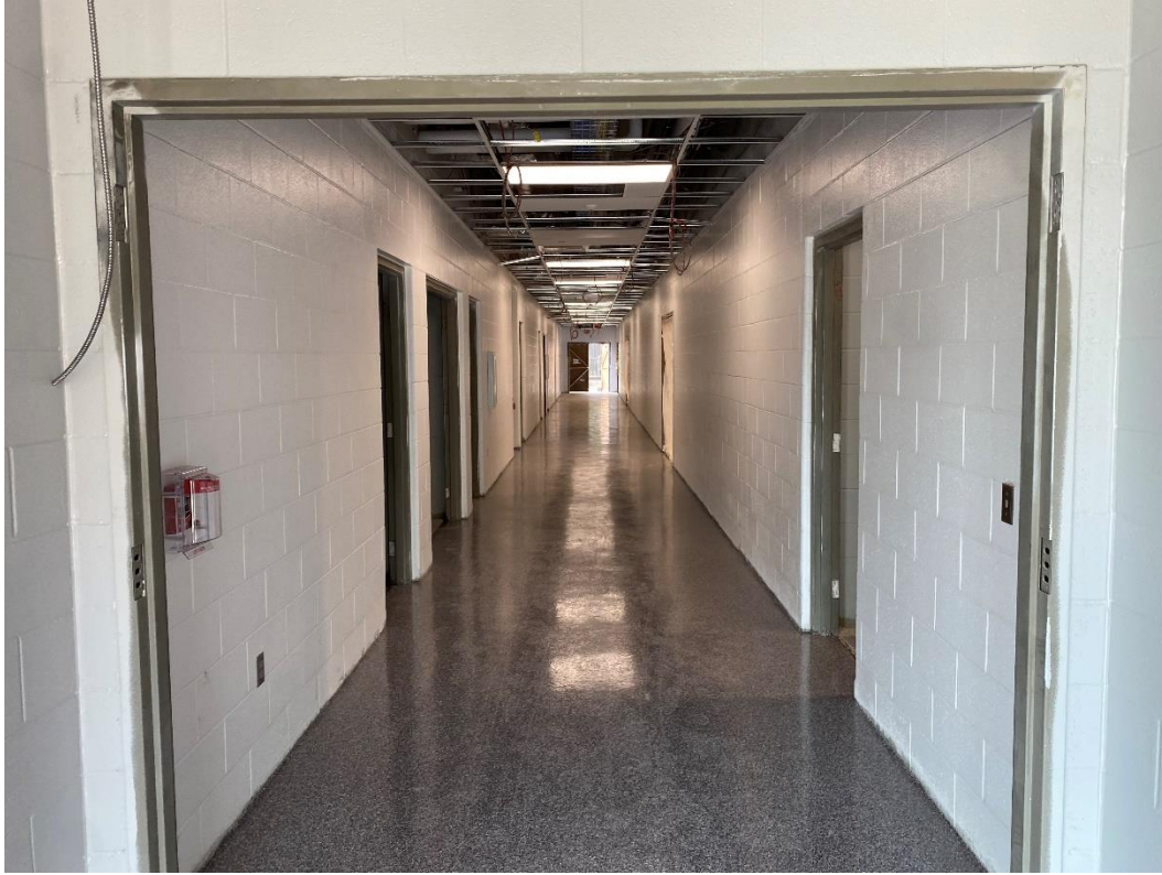
Epoxy flooring is complete in the Locker Room corridor.