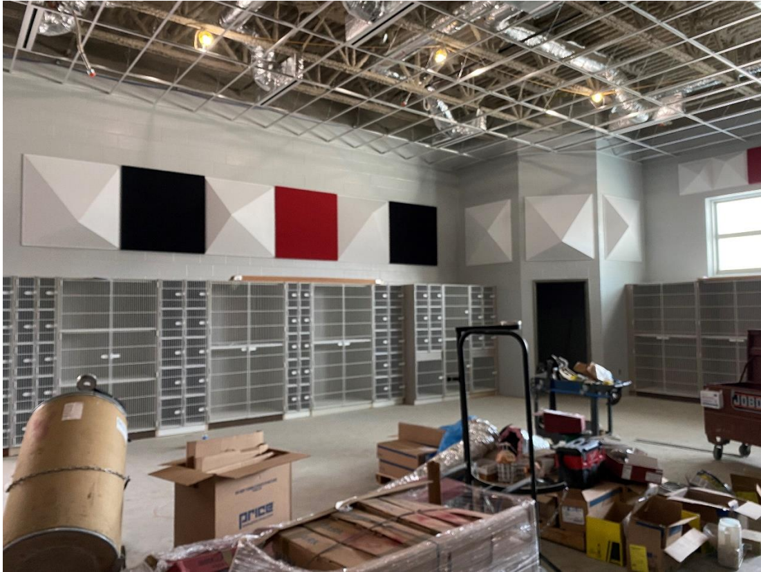
Acoustical panels are installed in the music classrooms.