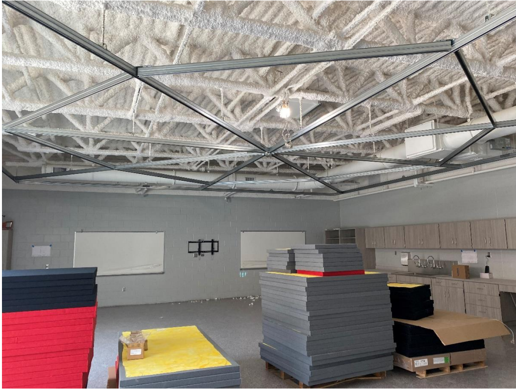
Lighting systems are installed in the Engineering Lab and acoustical panels are staged for installation in the Student Dining area.