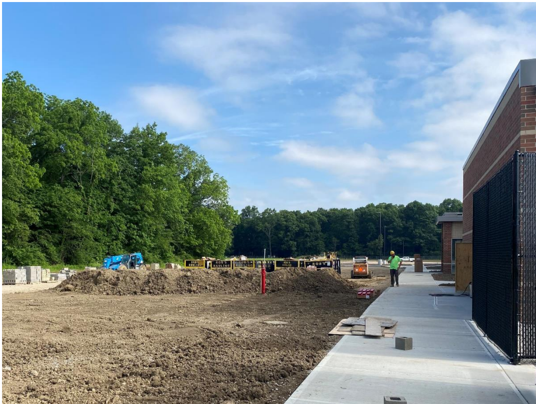
Topsoil is being placed on the west side of the mechanical room.