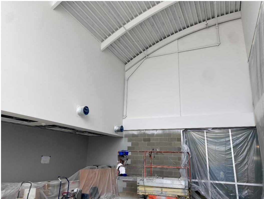
Painting is being completed in the front office and reception.