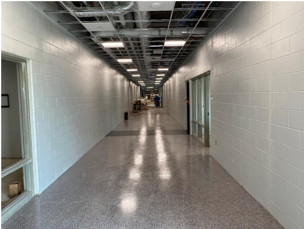
Epoxy flooring is complete in the main corridor west of the Administrative Offices.