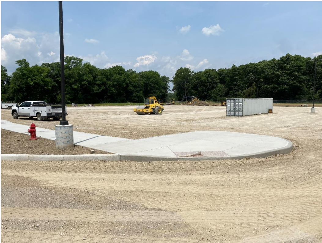
Grading and compaction in preparation for paving is being completed at the NW parking lot.