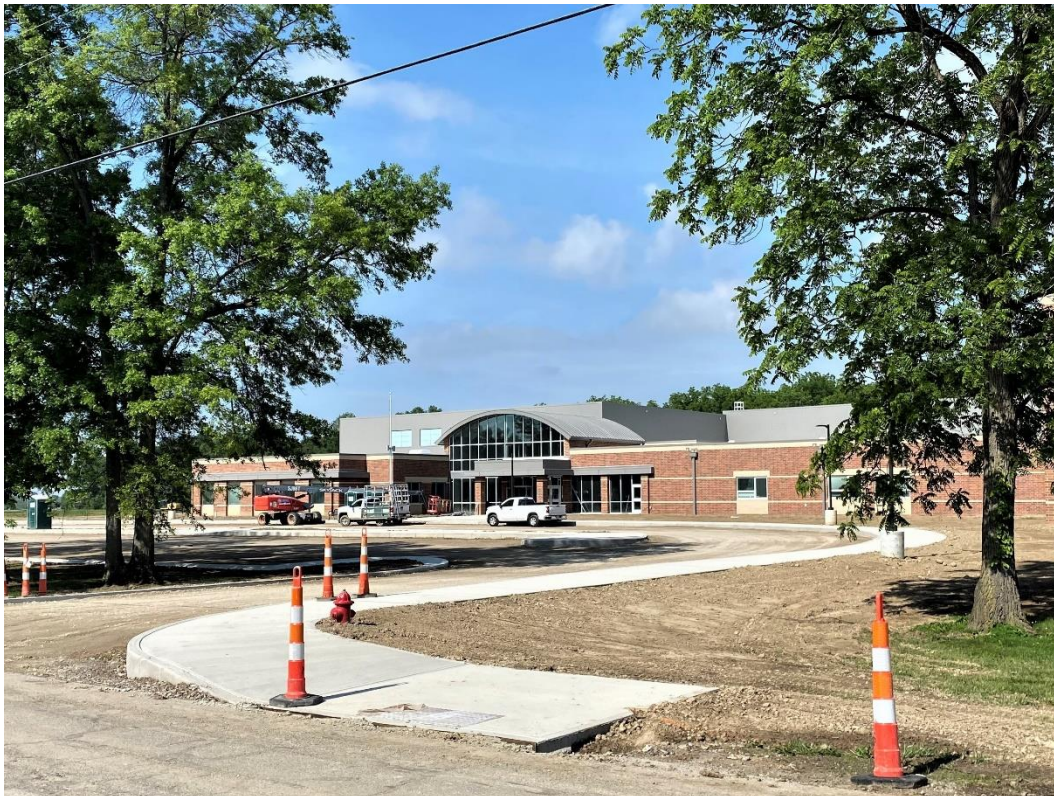
A beautiful setting for our new school.