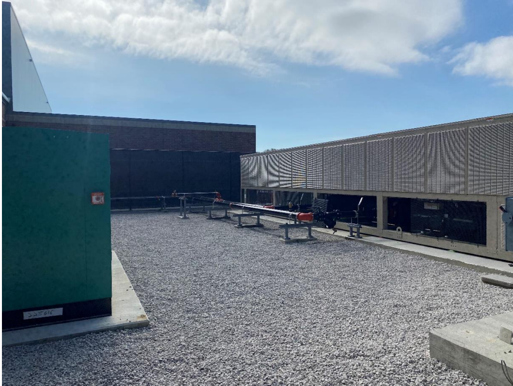
The chiller is started, gravel in the equipment yard is installed, and screening slats are installed in the fencing.