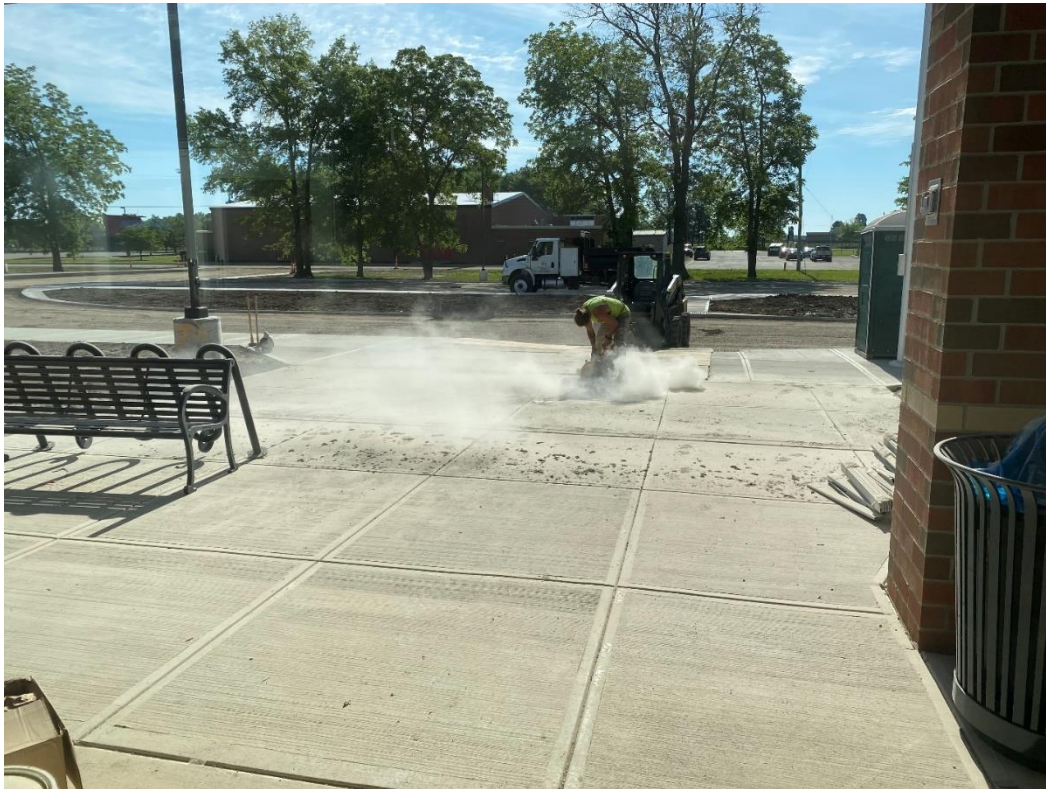
Cut out and replacement of damaged concrete at the front entry.