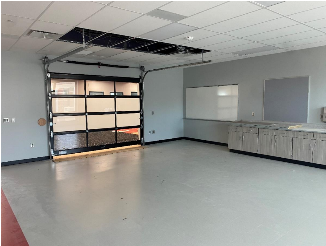
View from interior of Science Classroom.