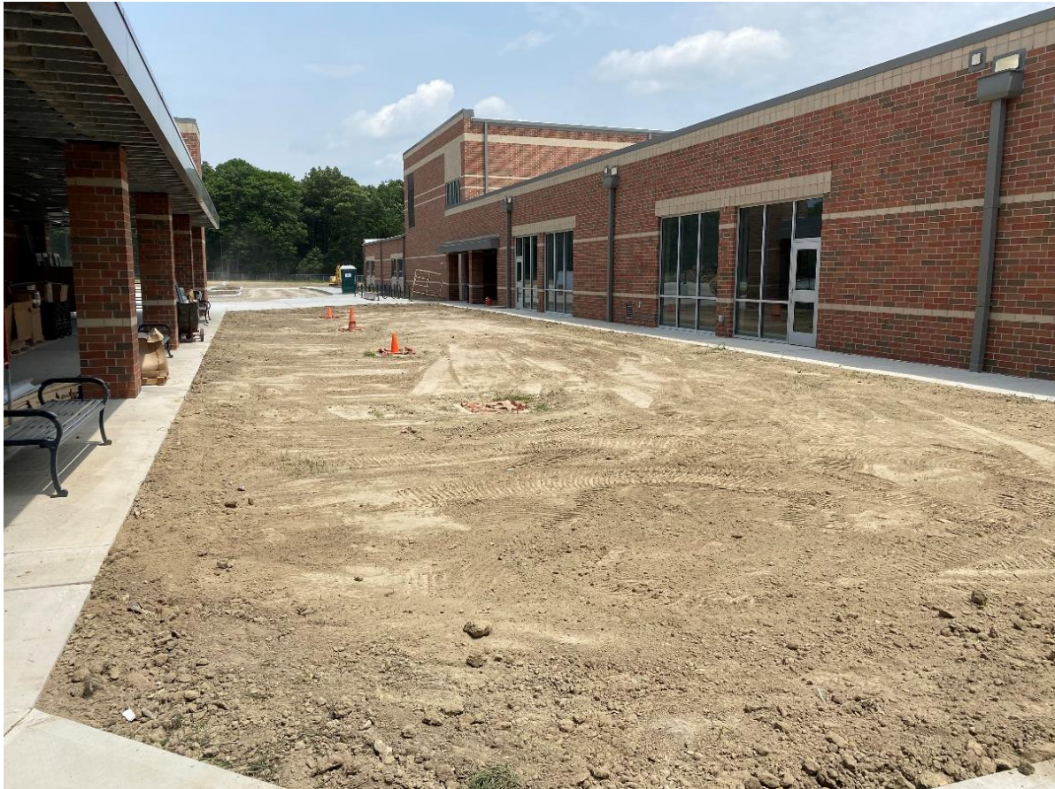
Topsoil is placed in the north entry courtyard.