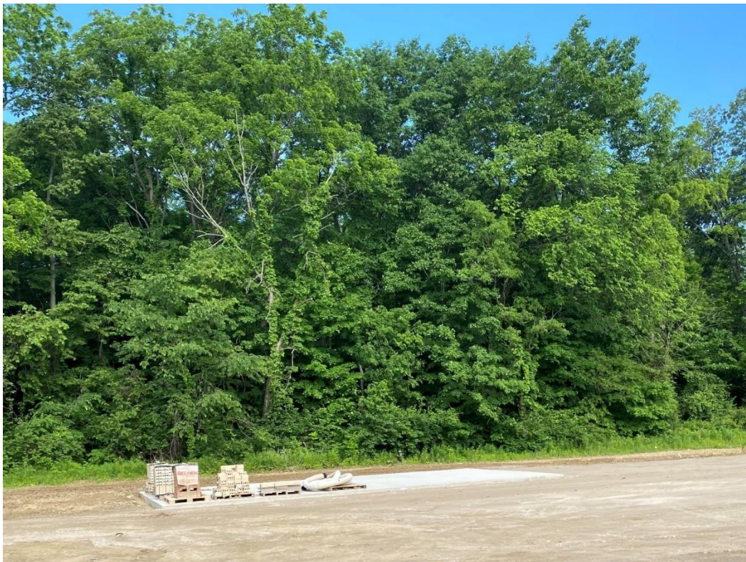
The concrete dumpster pad is installed.