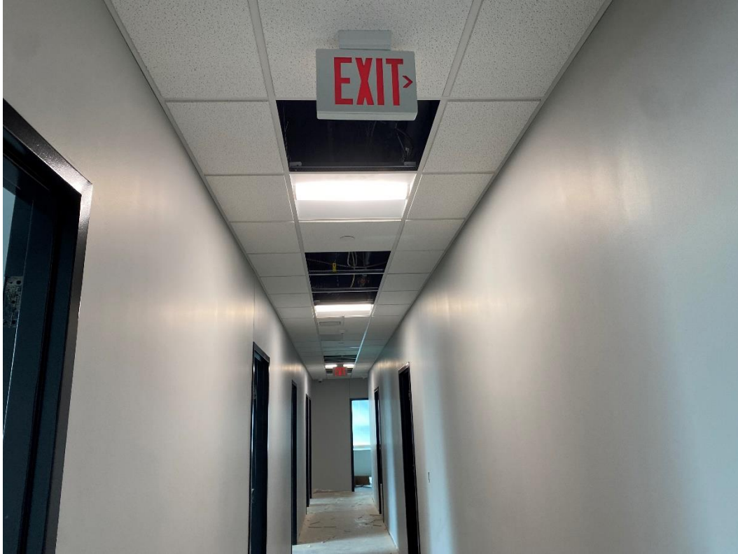
Ceiling tiles are being installed in the administrative offices.