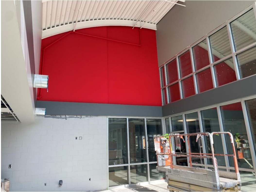
Interior painting at the front Reception area is progressing.