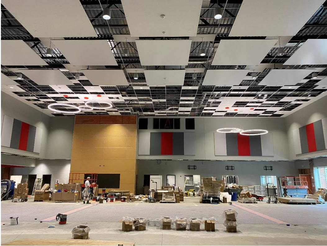
View from stage at the Performing Arts Center.