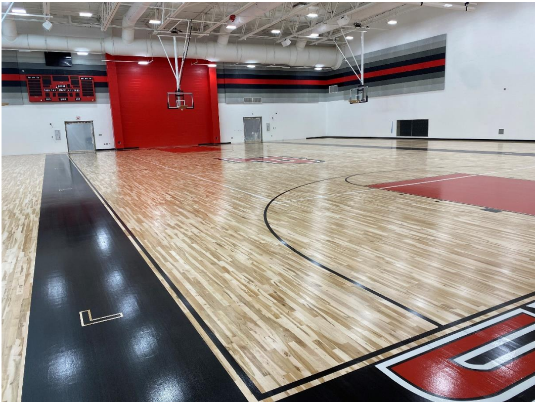
The Gym looks fantastic!