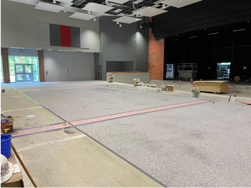
Epoxy flooring installation is progressing in the Area F Performing Arts Center.