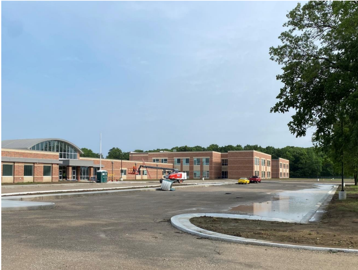
Heavy rains overnight caused ponding, but is not affecting the paving on the west side.