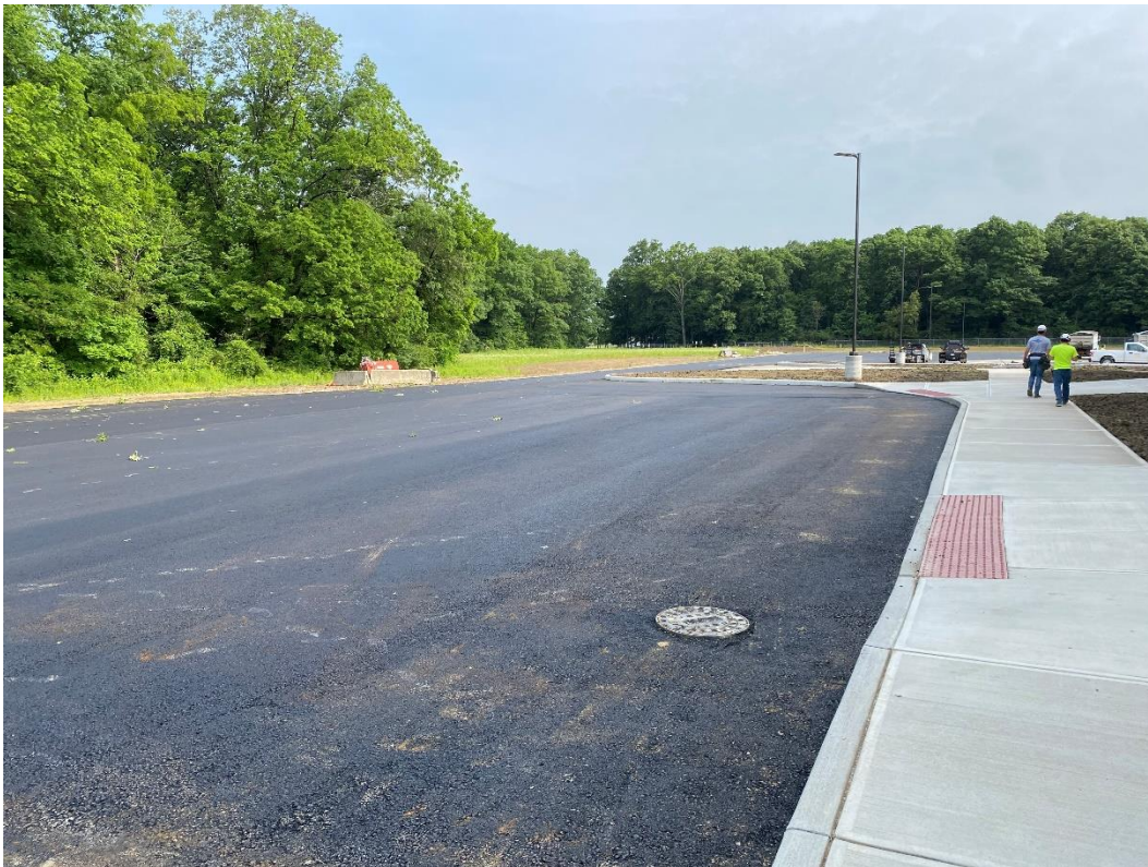
Asphalt paving work is progressing on the west side with installation of the base course.