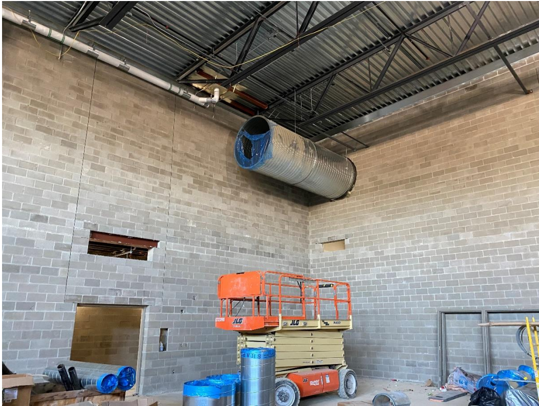
Large spiral duct is extended into the Gym.