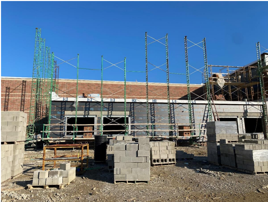
Brick veneer is starting at the single story level of Area D, at the Science classrooms.