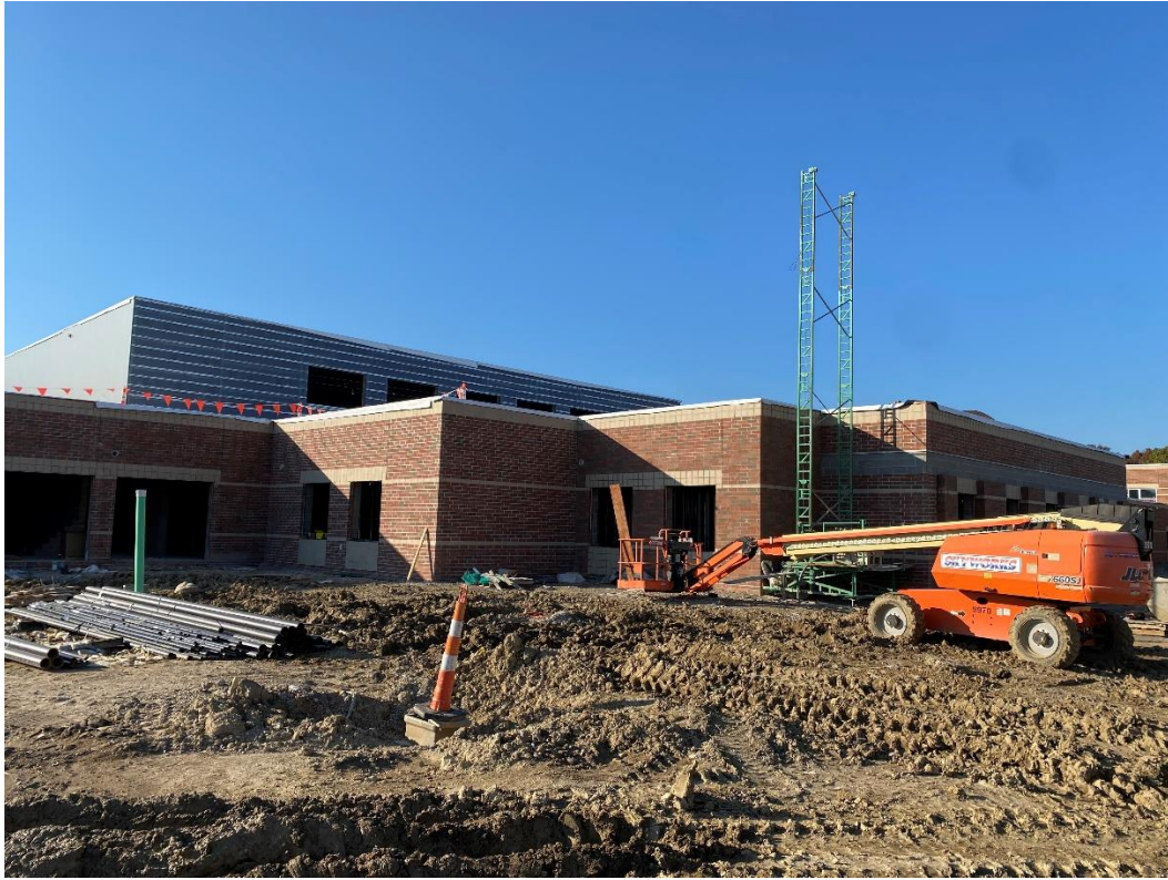
Brick veneer on Area A is now complete.