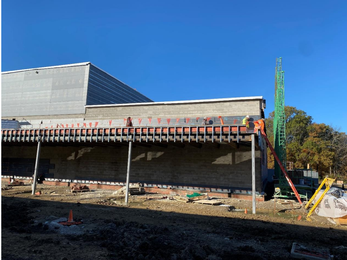
Completion of parapet wall blocking will allow roofing work to finish at these areas.