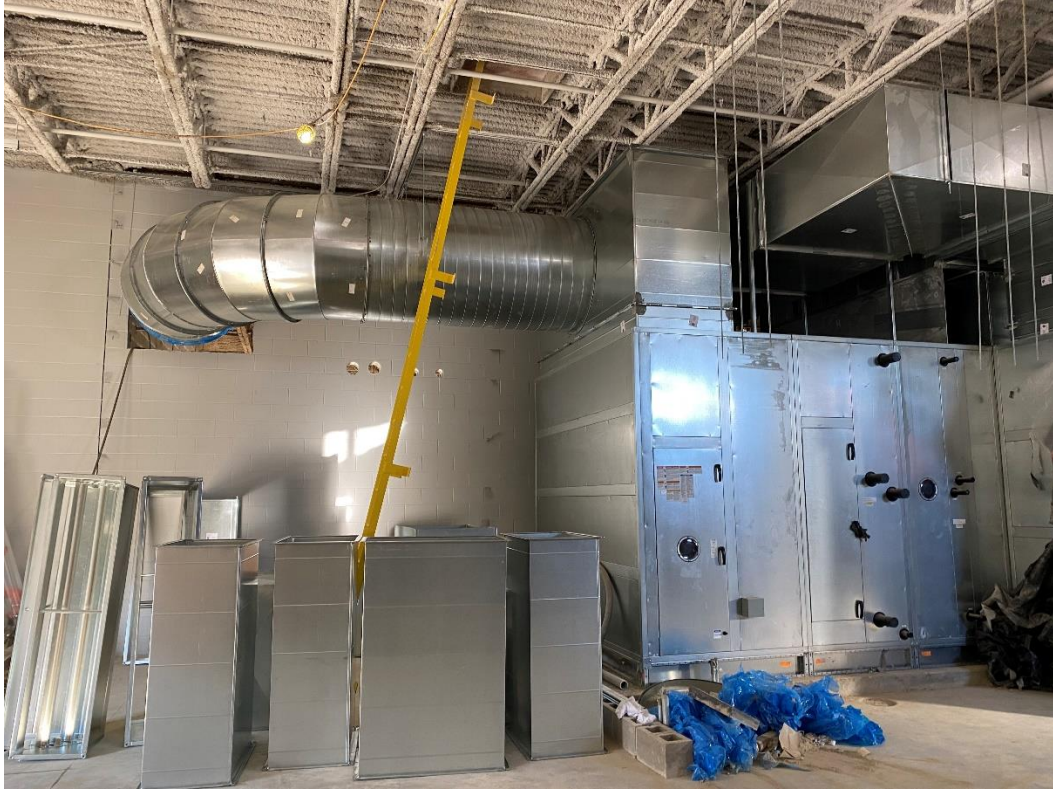
Ductwork from the air handler is extended into the Kitchen.