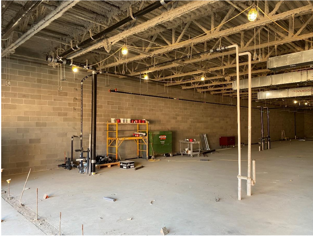
Plumbing rough-in is progressing in the Locker rooms in advance of masonry work.