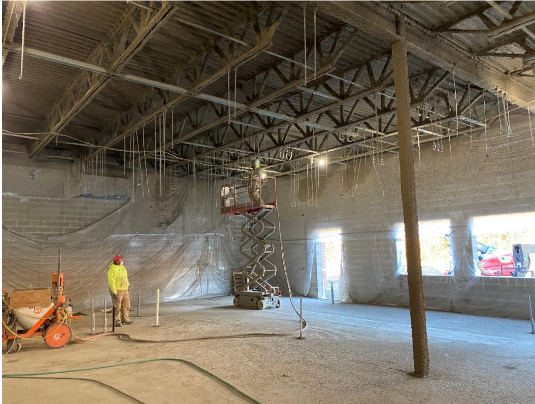
Fireproofing will be complete in the Kitchen today.