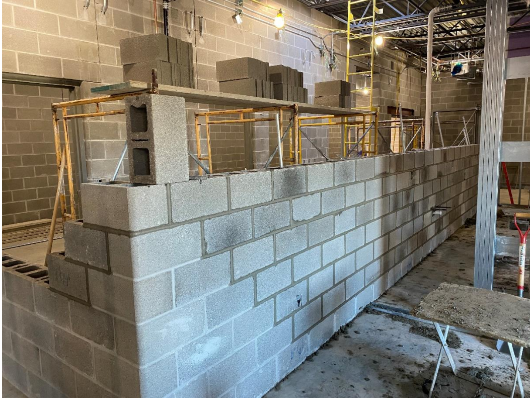
Interior masonry walls are progressing in Area C.