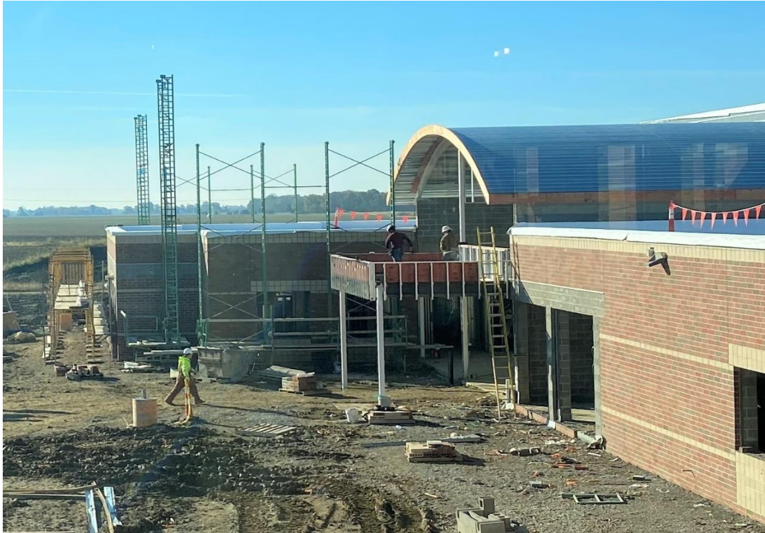
Installation of wood blocking on entry canopy parapet walls at the main front entry.