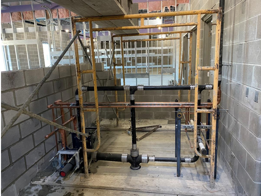
Plumbing rough-in is complete at the second floor toilets in Area C and masonry walls are progressing.