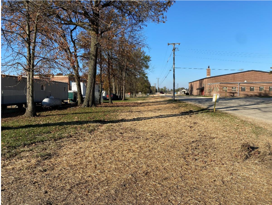
Fine grading and seeding is completed each side of the main campus drive