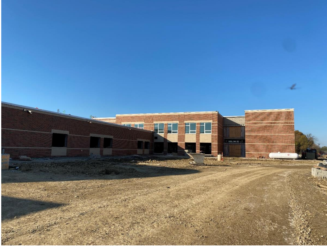
Windows on Classroom Area C are 60% installed.