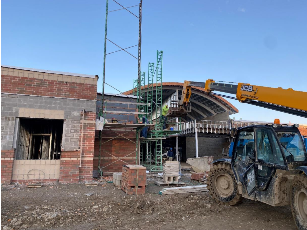
View of main entry. Masons are stocking the scaffolding to finish the NE corner of Area A.