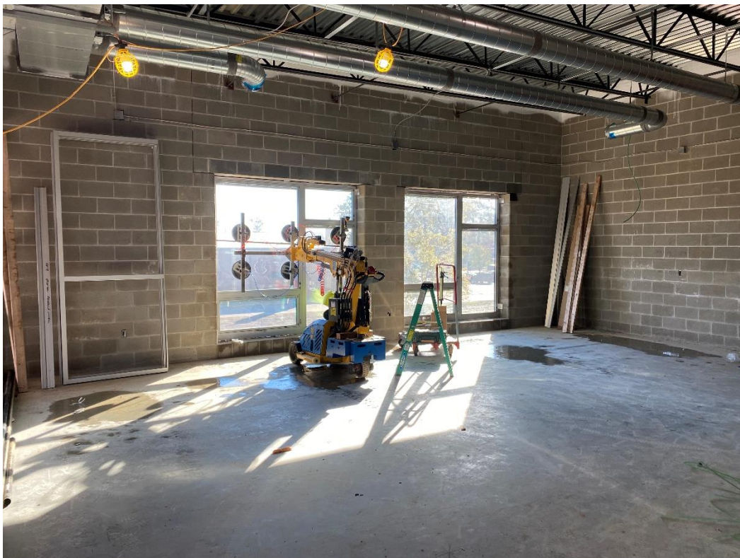
Installation of windows continues at the second-floor level of Area C.