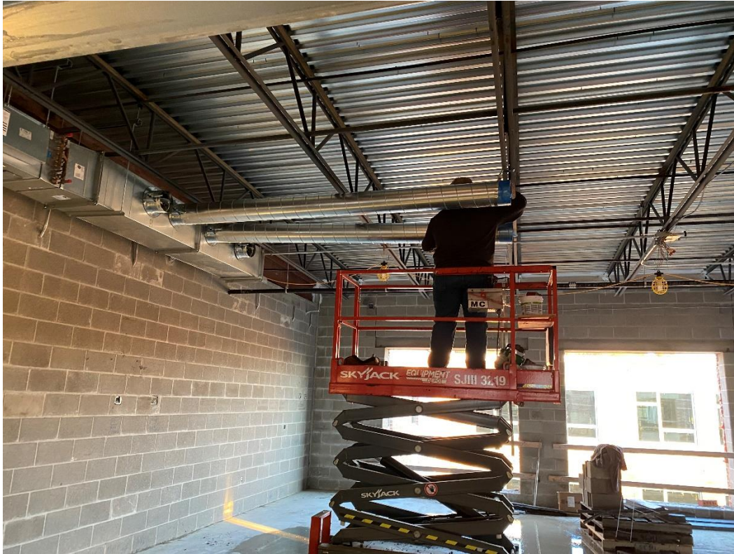
Installation of branch ductwork at the second-floor level of Area C.