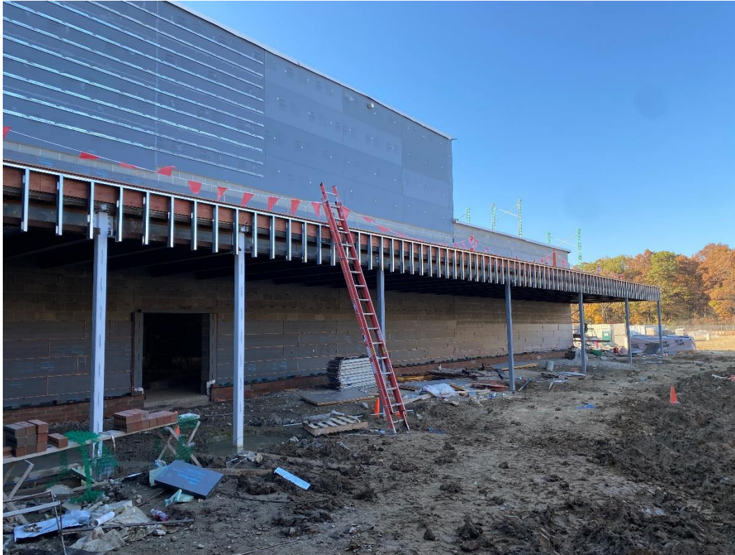
Wood blocking is installed and the events entry canopy is ready for roofing.