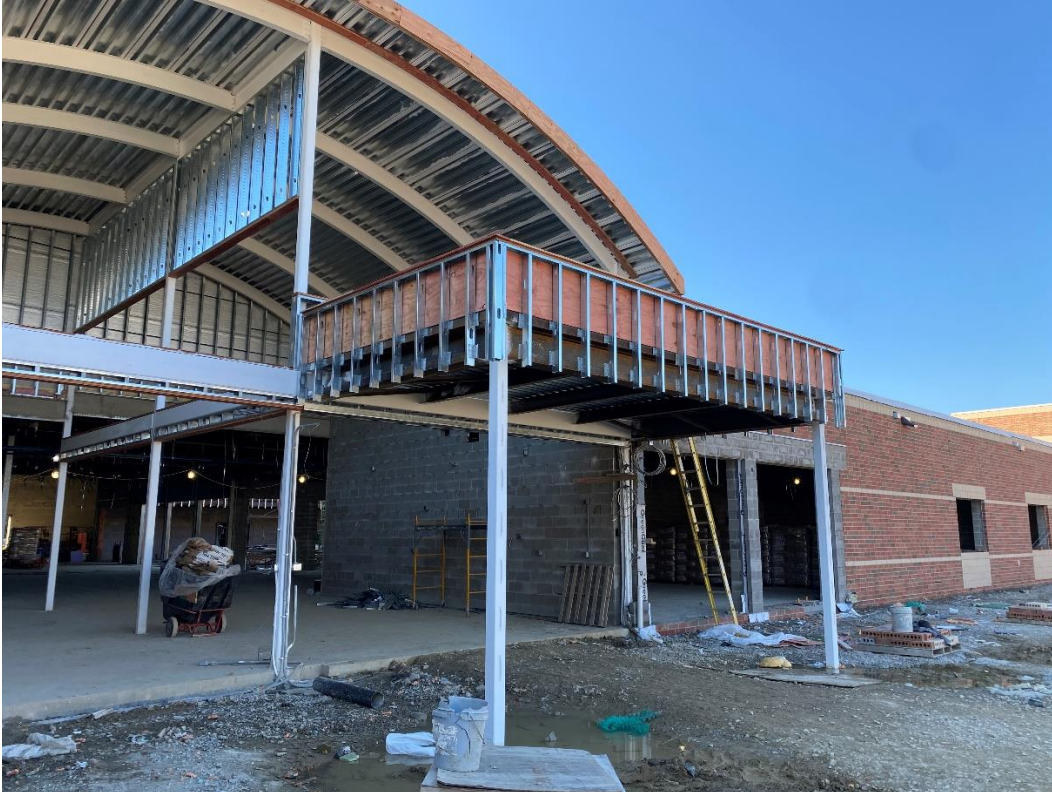
Wood blocking and nailers are installed at the main entry canopy which is now ready for roofing.