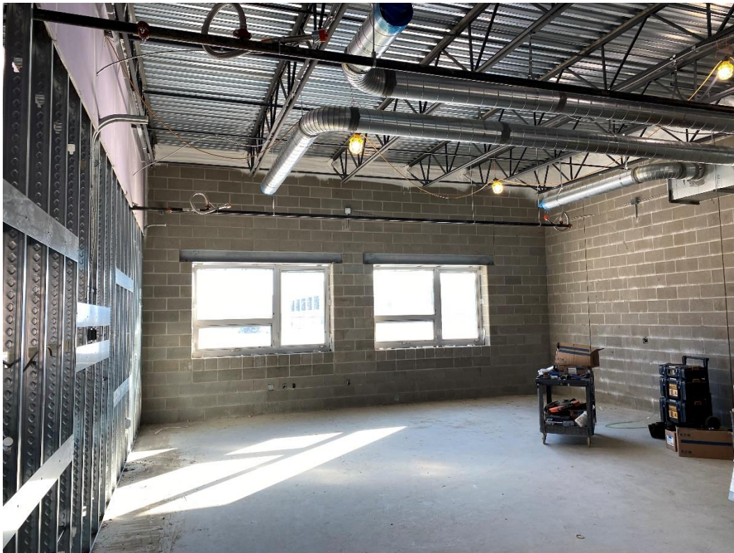
Typical classroom in Areas C & D.