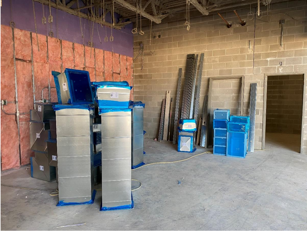
Ductwork is staged for installation the Administrative Offices.