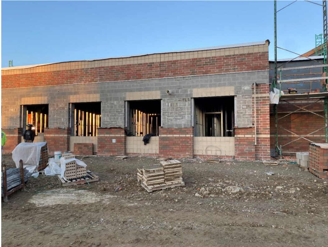
Brick piers between windows are 40% complete and will continue to the cornice line above the windows.