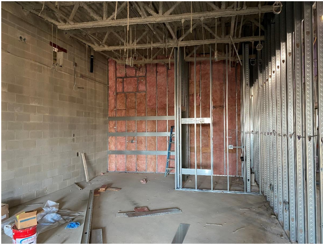
Installation of acoustical insulation continues in stud walls of the Administrative Offices.