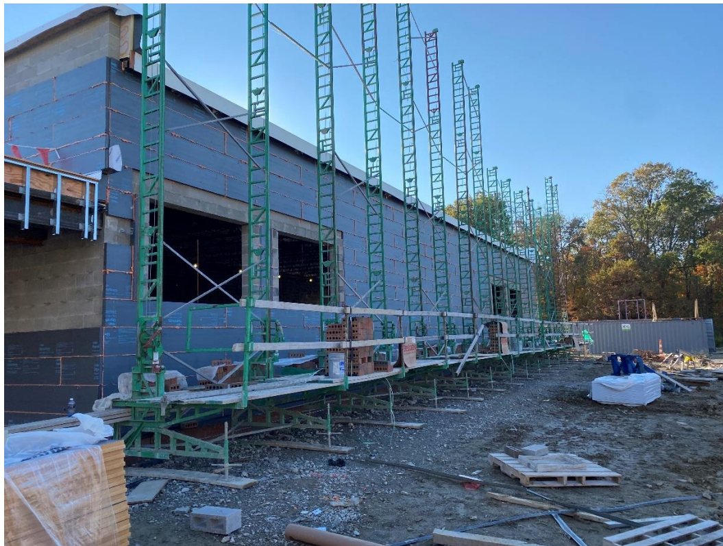
Installation of brick has started on the north wall of the music rooms, Area F.