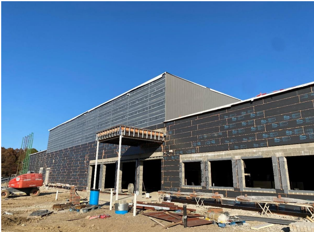
The Alternate entry vestibule is ready for roofing. Metal siding installation is progressing on the south wall fo the Performing Arts Center