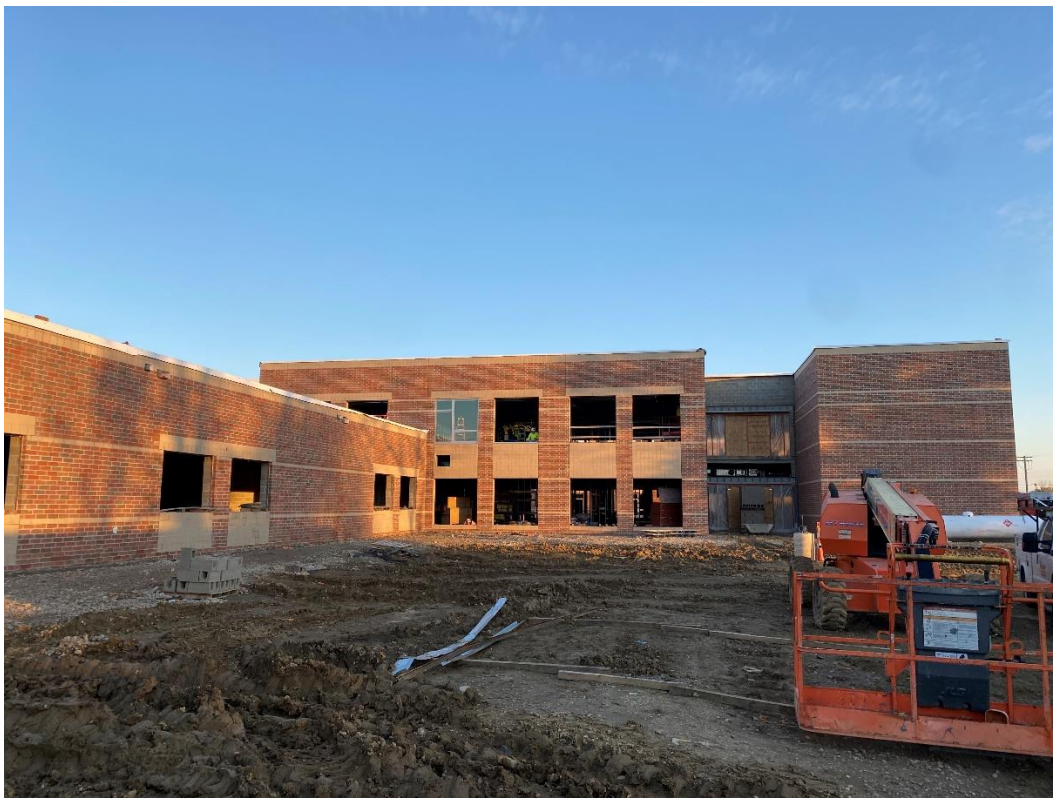
Brick is cleaned and installation of windows is progressing on Area C