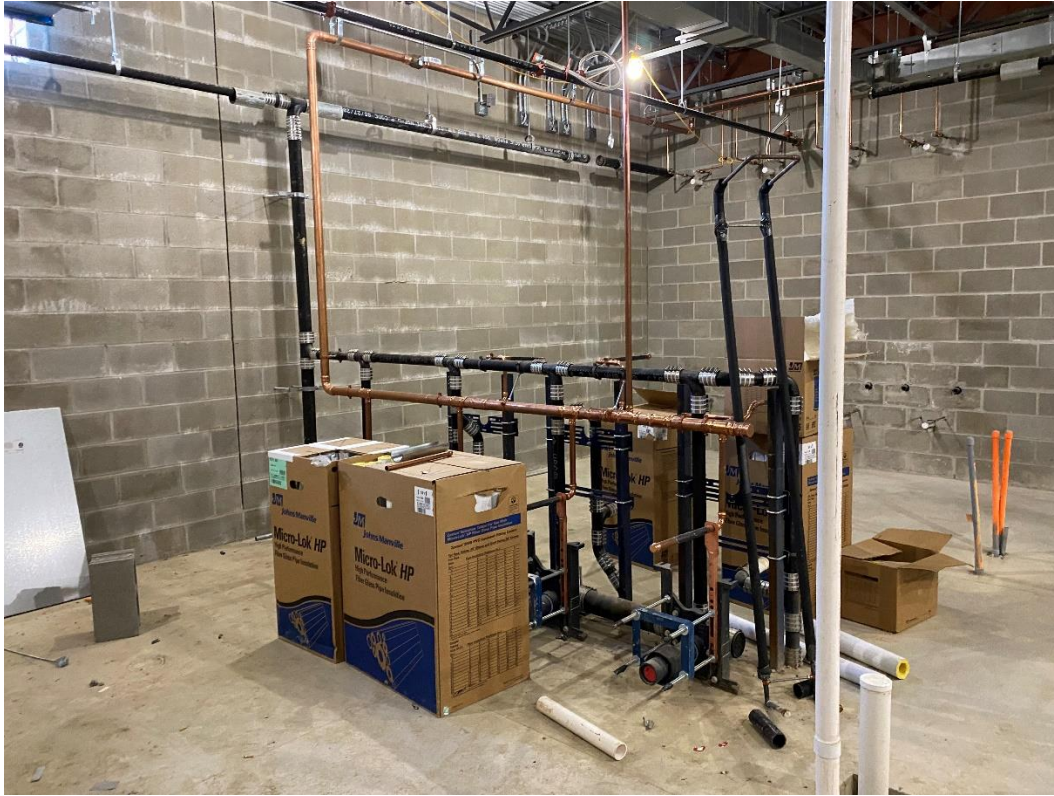
Plumbing rough-in is progressing at Area C toilet rooms.