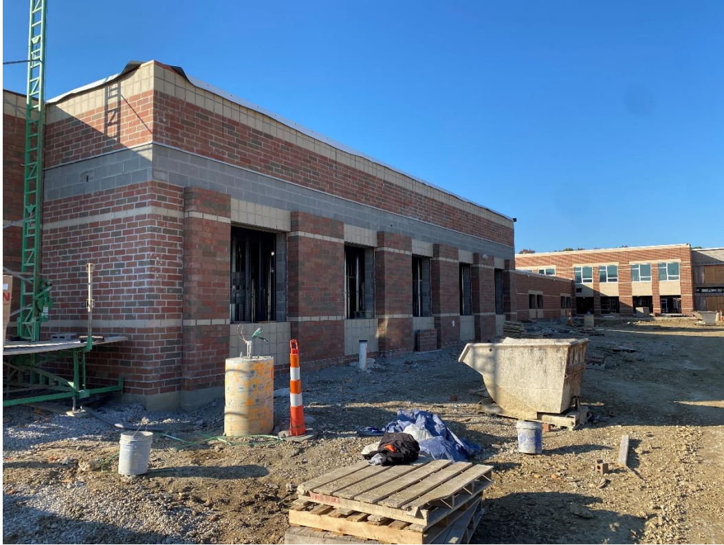
Brick piers between windows at Area A are now complete.