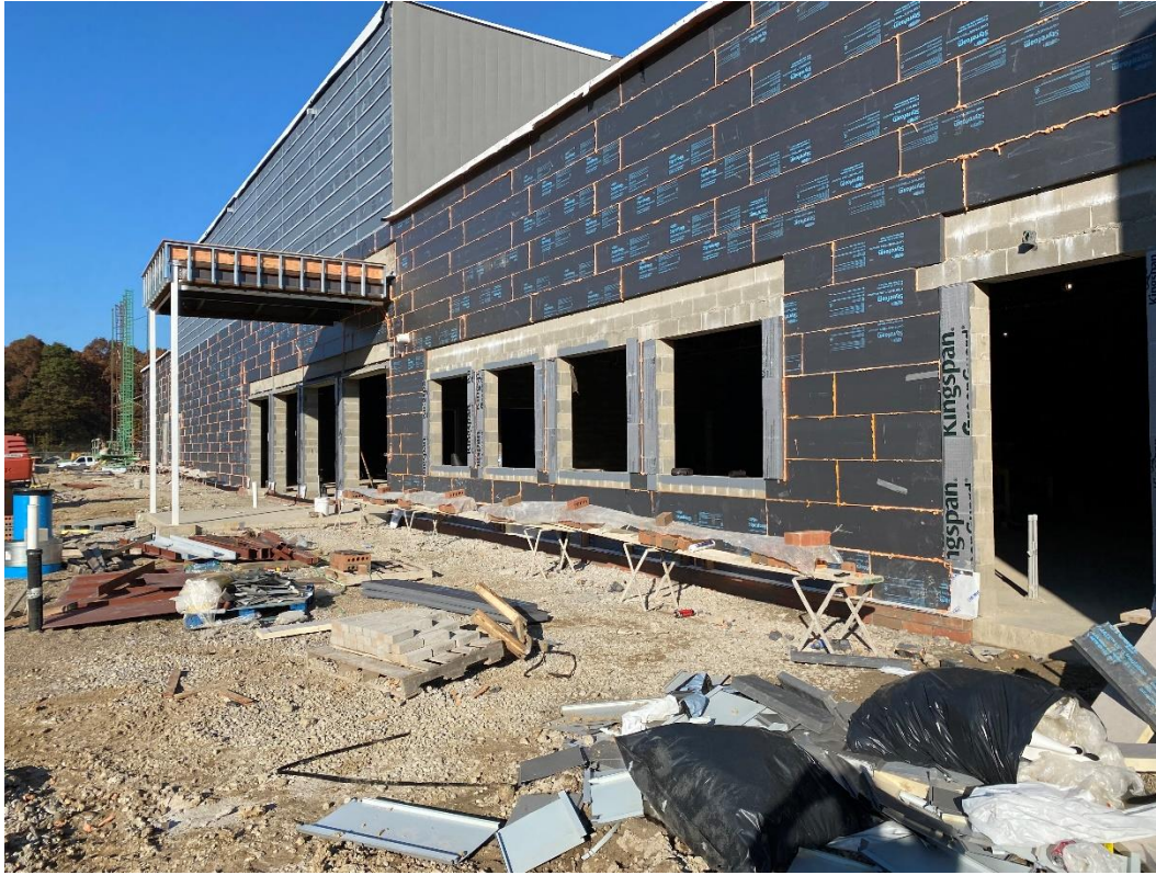
Base flashing is installed at the west wall of the Kitchen and Performing Arts Center.