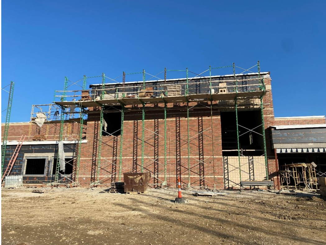
Brick veneer is nearly complete at the west two story portion of Area C.