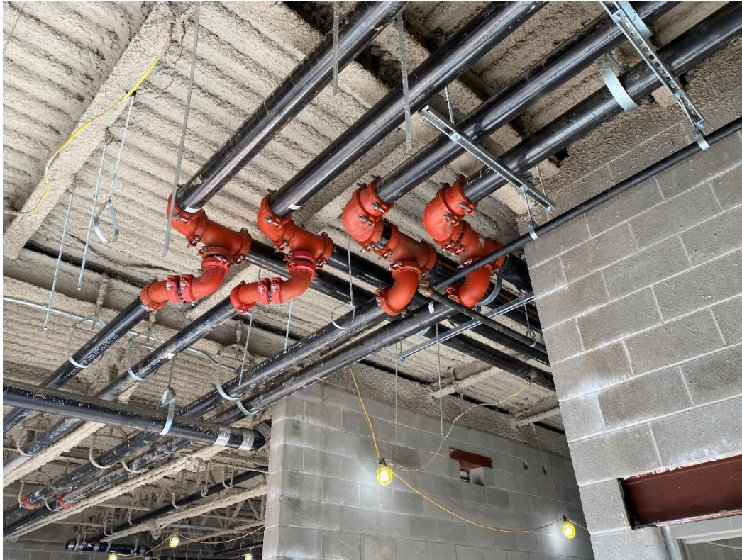
Hydronic piping work is progressing at the locker room area.