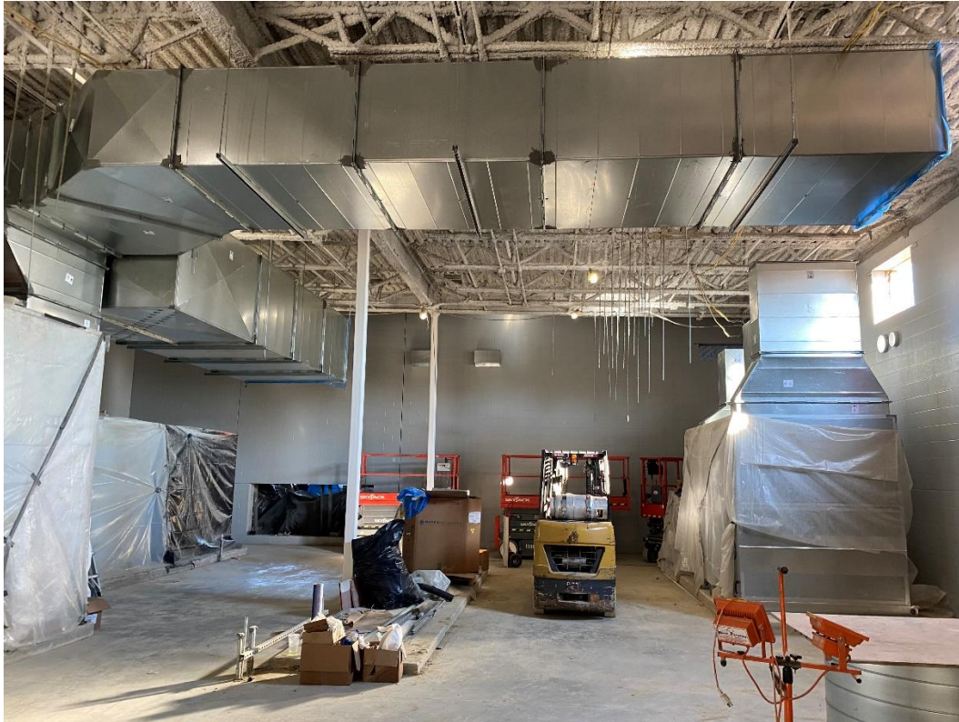
Large supply/return air ducts and fresh air intakes are being installed in the main mechanical room.