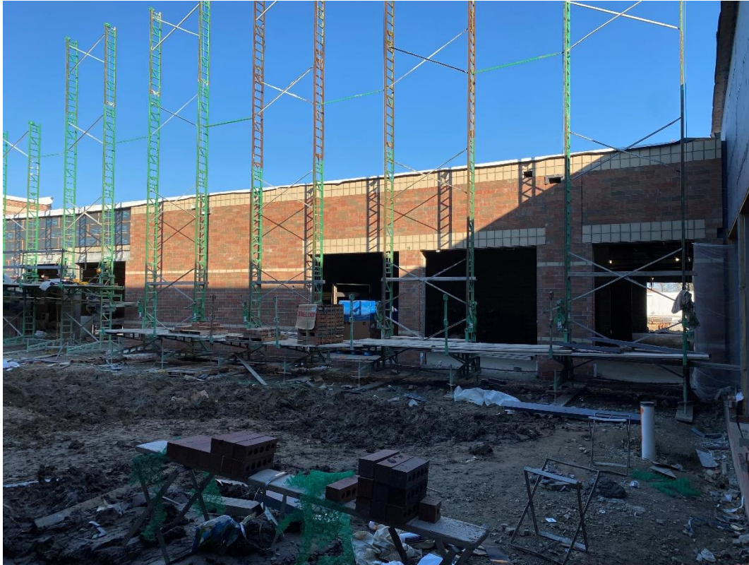
Brick veneer is being completed on the west wall of Area B.