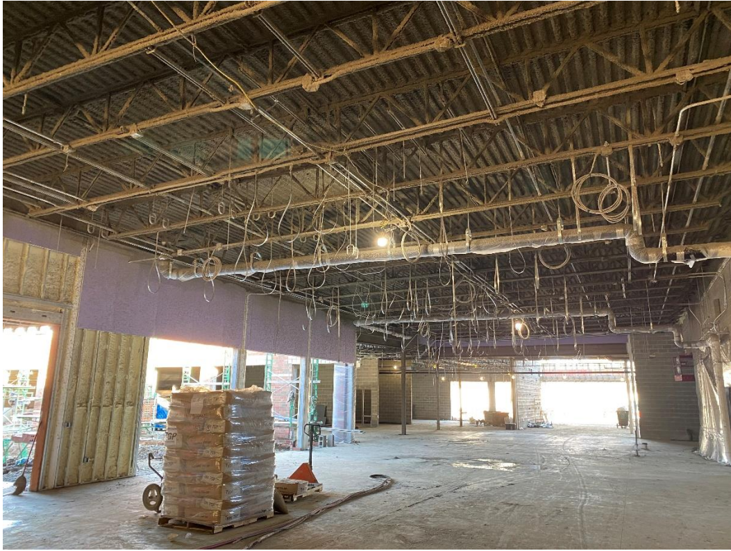
Spray-on fireproofing is 90% complete at Area B, Student Dining.