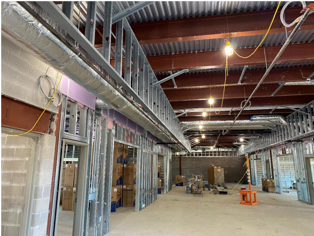
Duct and pipe insulation is nearly complete at the first-floor level of Area D.