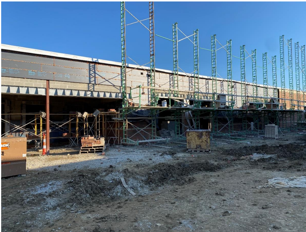
Brick is 40% complete on the west wall of Area C at the Art rooms.