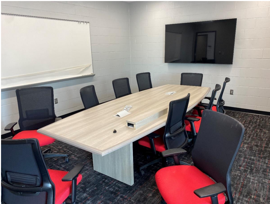
Administrative offices conference room.