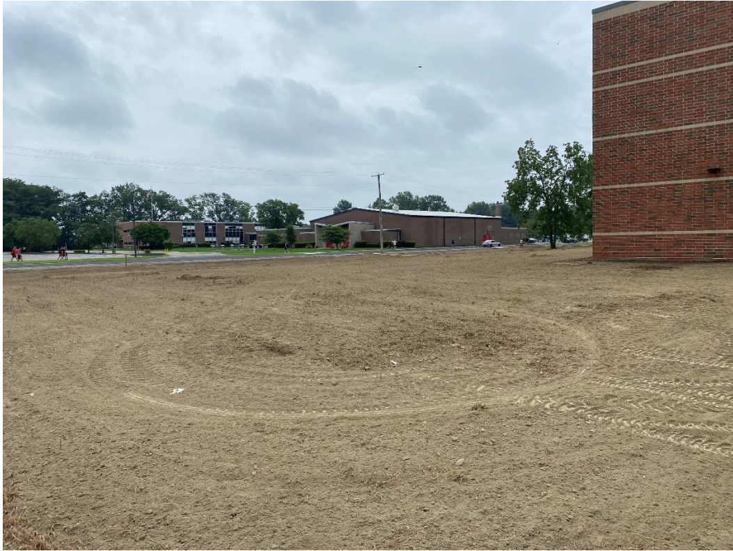
Fine grading and seeding of lawn areas north of the building.