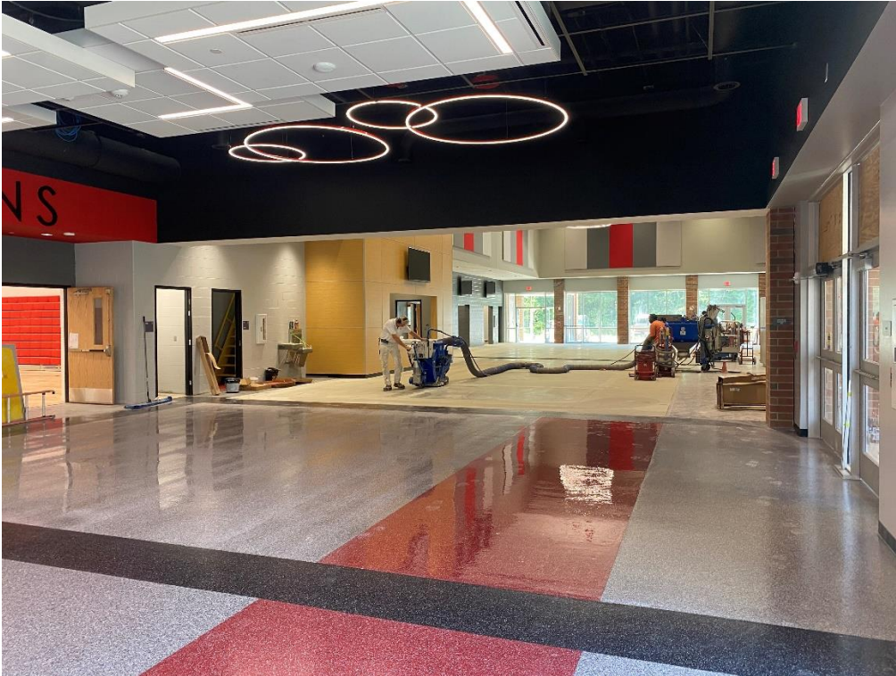
Epoxy flooring is being completed in Area F.