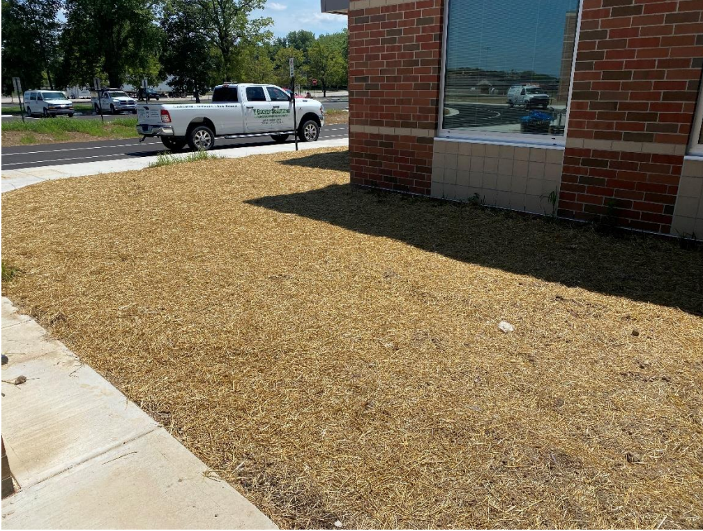
Lawn areas are being installed. Seeded areas will need to be removed at the front entry where landscape planting is planned.