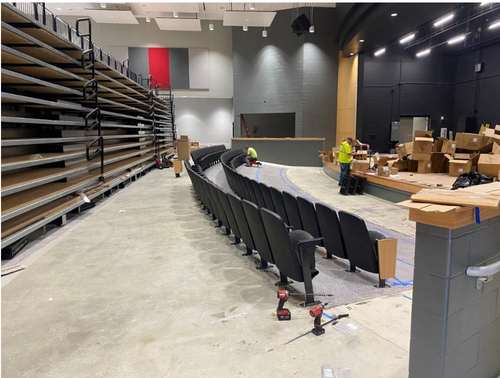
Fixed auditorium seating is being installed in the Performing Arts Center.