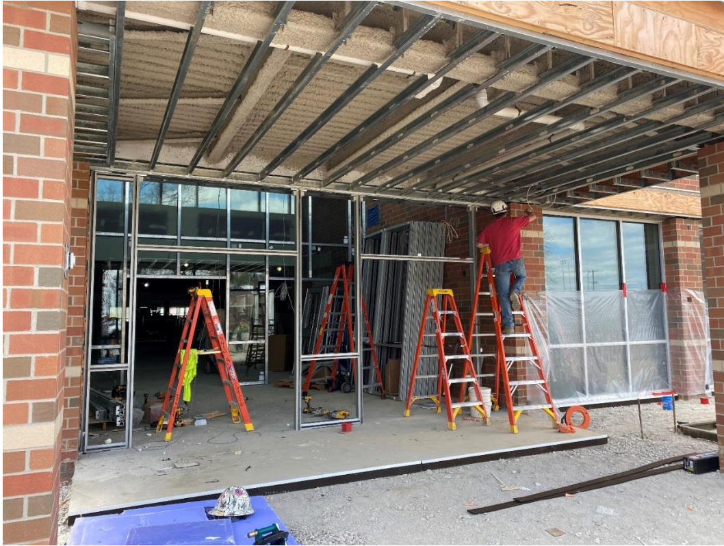
Aluminum storefront at the main entry is being installed.