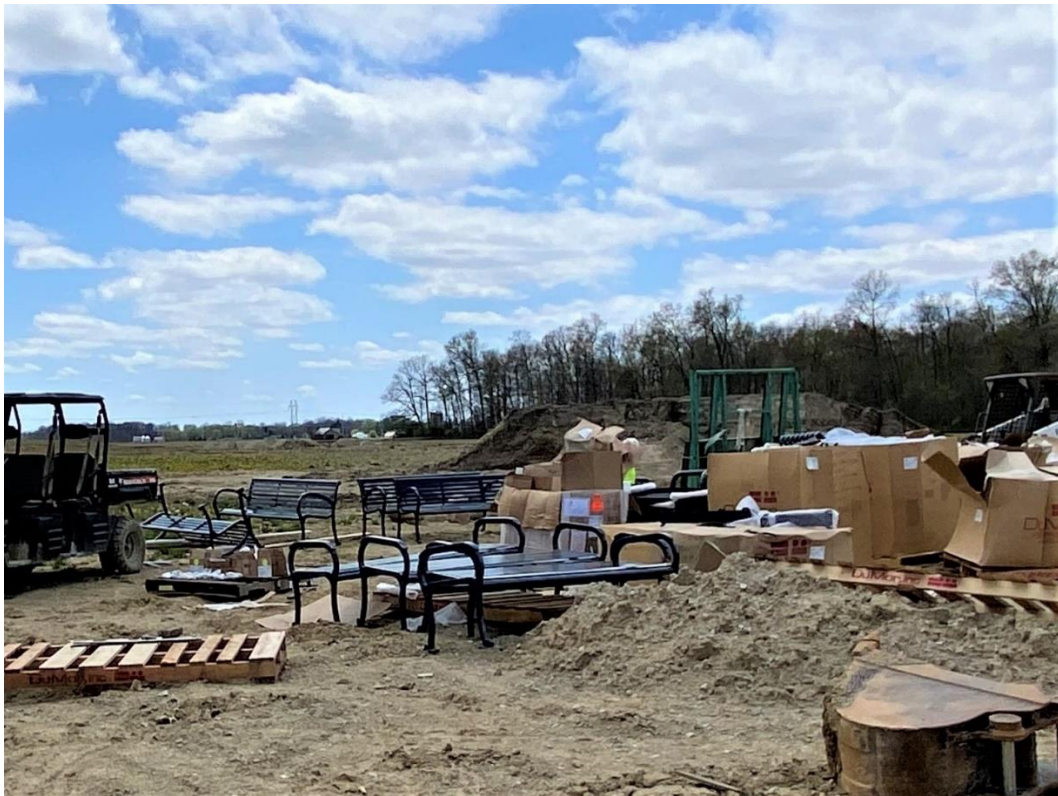
Site furnishings are being assembled and will be placed at the north courtyard.