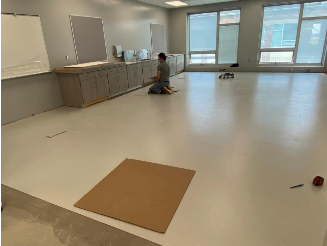
Installation of vinyl flooring in an Area D, second-floor classroom.