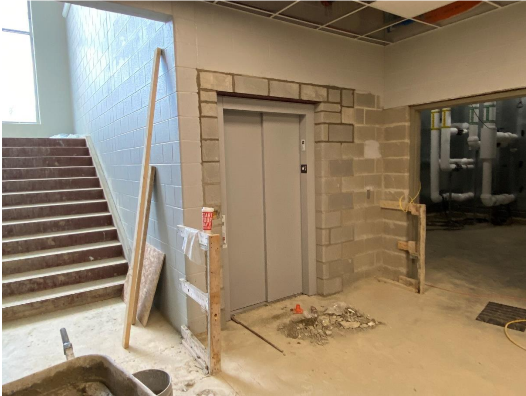
First floor elevator doors.