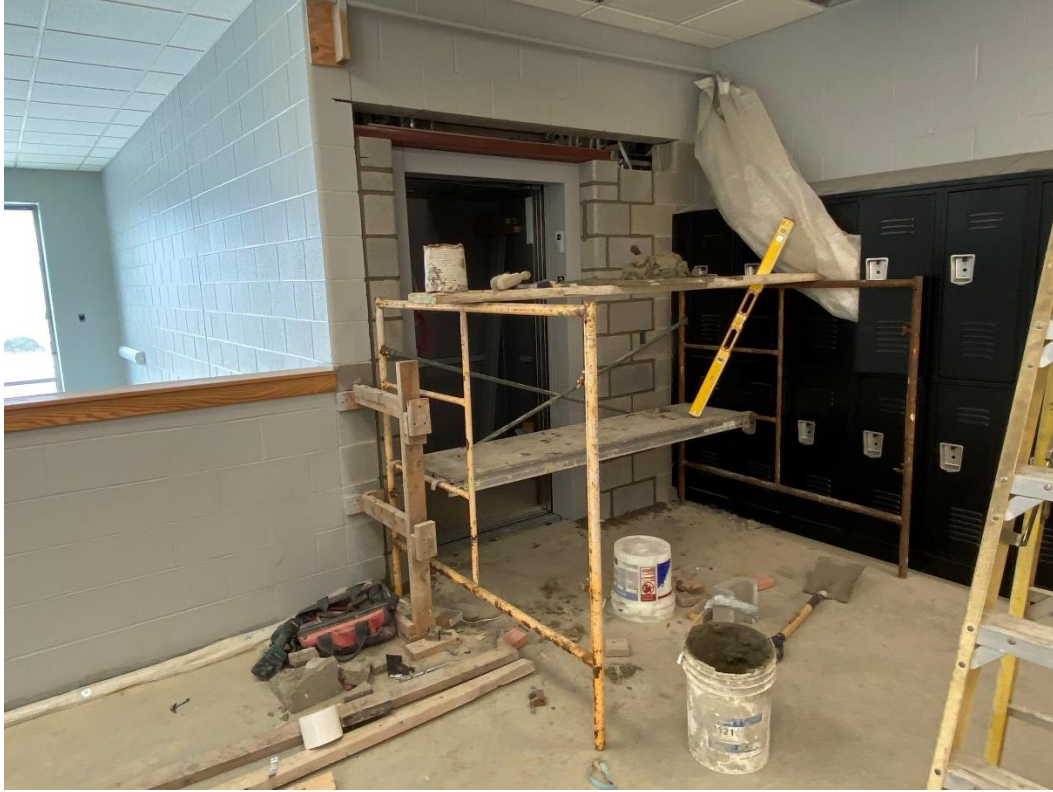
Elevator doors are installed and the masonry openings are being closed in a the second floor.