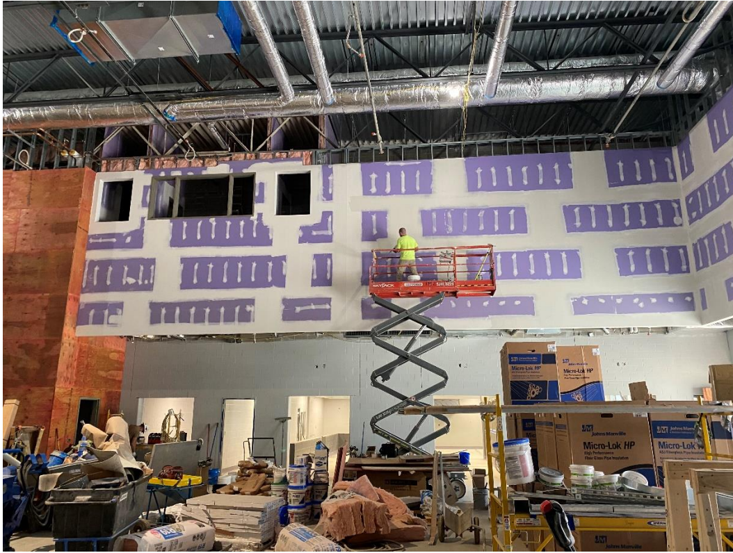
Drywall continues to be finished in the Performing Arts Center.