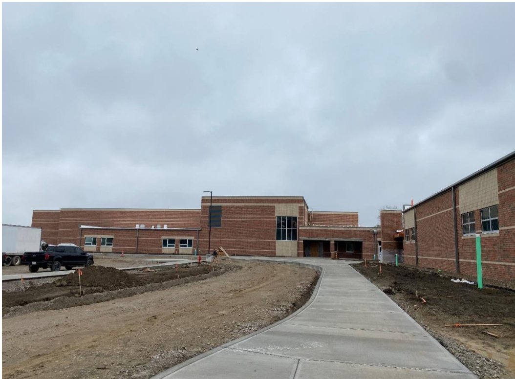
Sidewalks are complete on the west side. View looking east toward the west entry to the 2-story, Area C & D classrooms.