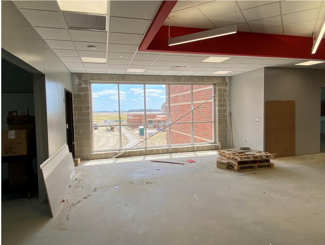
Masonry work is complete at the Area D, second-floor material access point and the window is now installed.