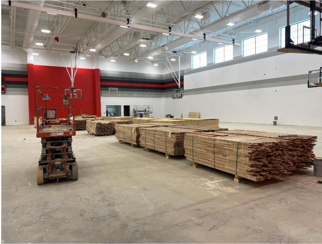
Hardwood flooring is acclimating to building humidity conditions in the Gym.