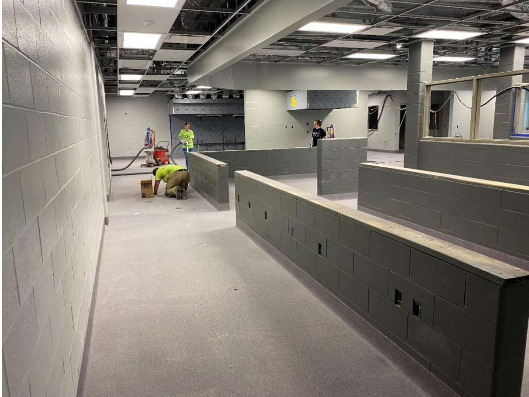
Epoxy flooring is being installed in the Kitchen.