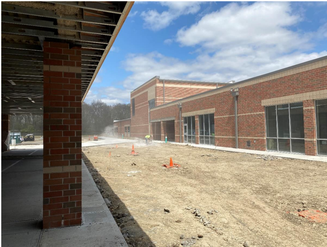
Sidewalks at the north entry and exits from Art and Engineering classrooms are complete.