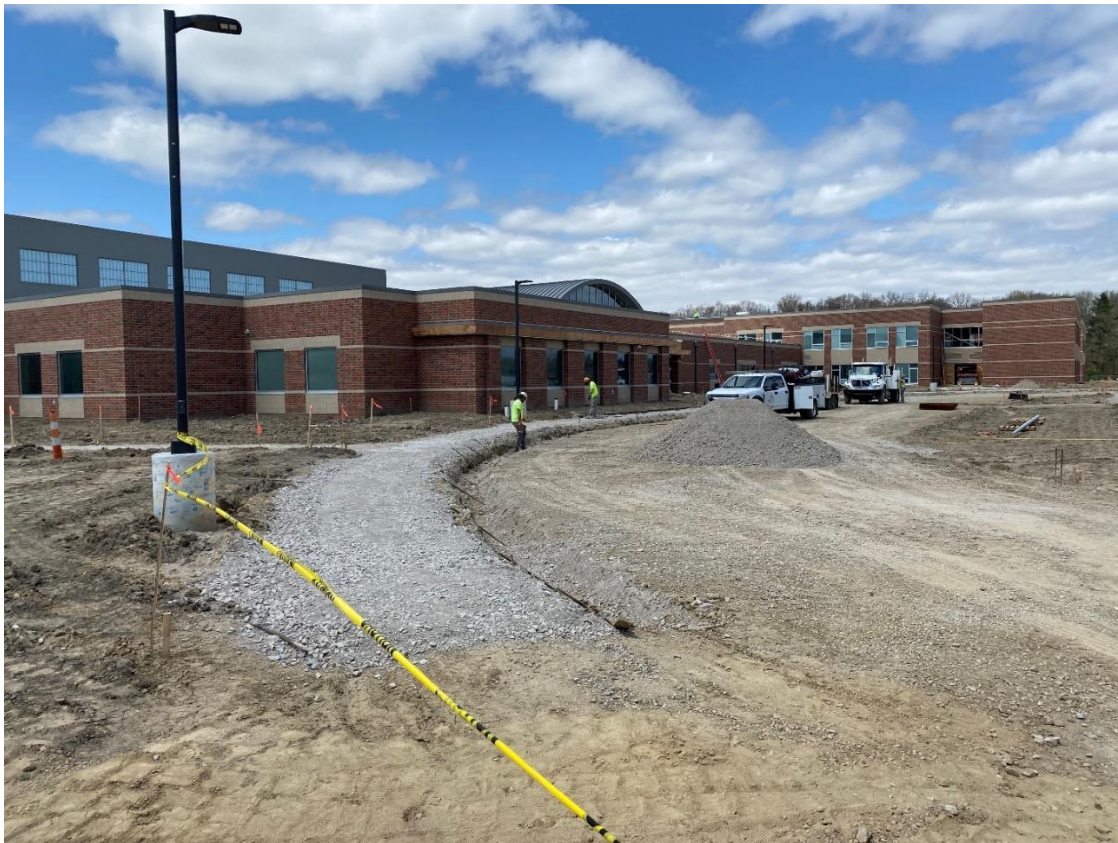
Layout of sidewalks continues on the east side.