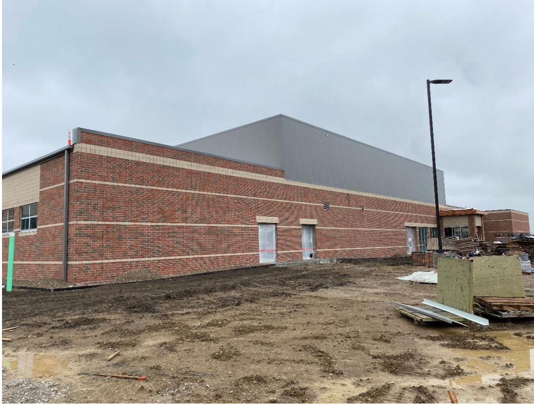
Exterior metal siding and roof copings are complete. View of west side looking SE.