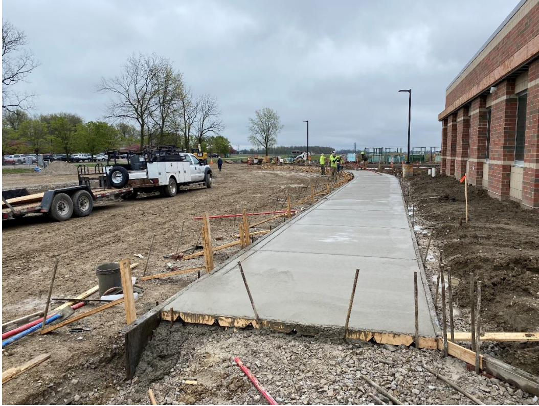
Freshly placed concrete at the east front. View looking south.