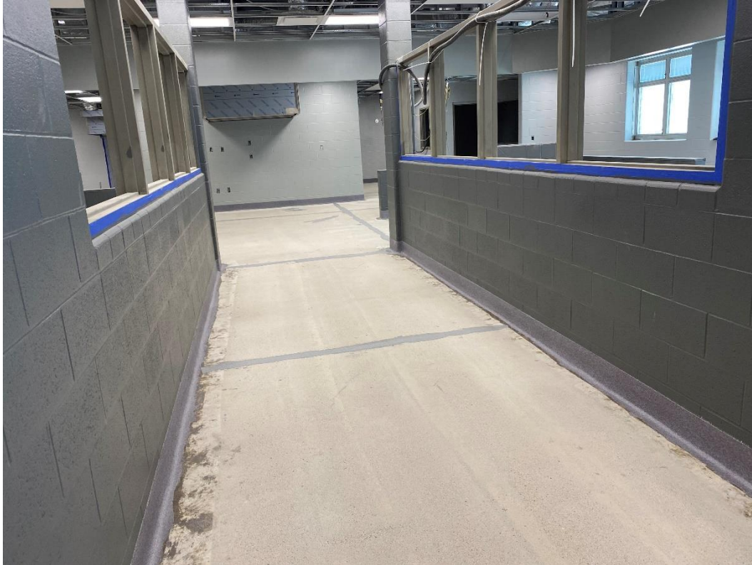
Epoxy base is installed at the Kitchen.