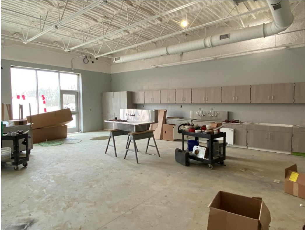
Cabinetry and plumbing fixtures are being installed in the Art Classrooms.