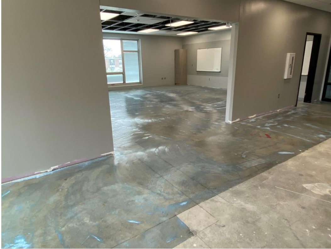
Glue is applied for carpet tiles at the east end of Area D, second-floor.