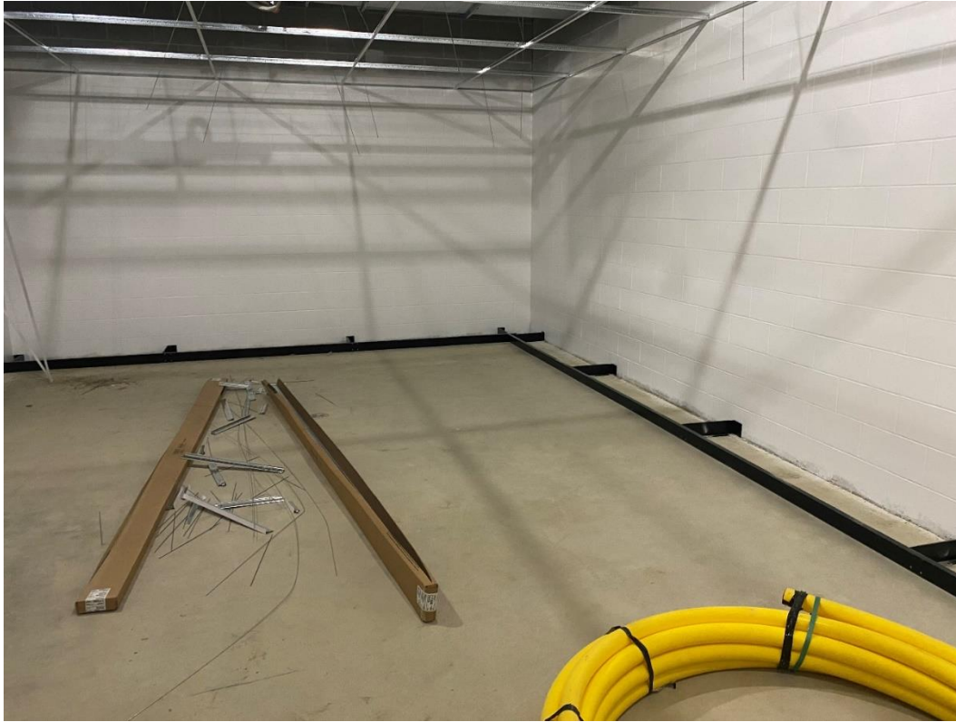
Locker bases are being installed in Area D, second-floor and in the Locker rooms. Lockers to follow next week.