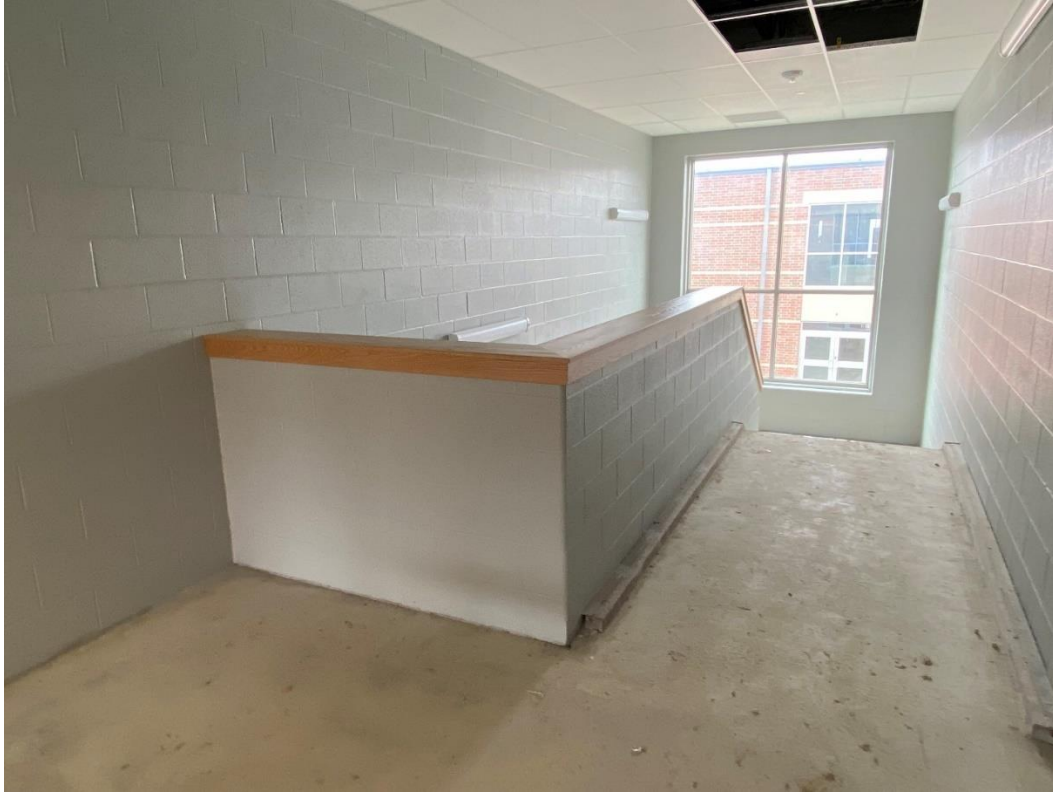
Oak trim is installed on C & D stair walls.