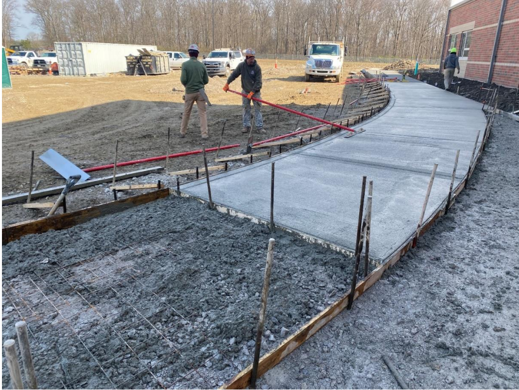
Concrete finishing, west side looing north.