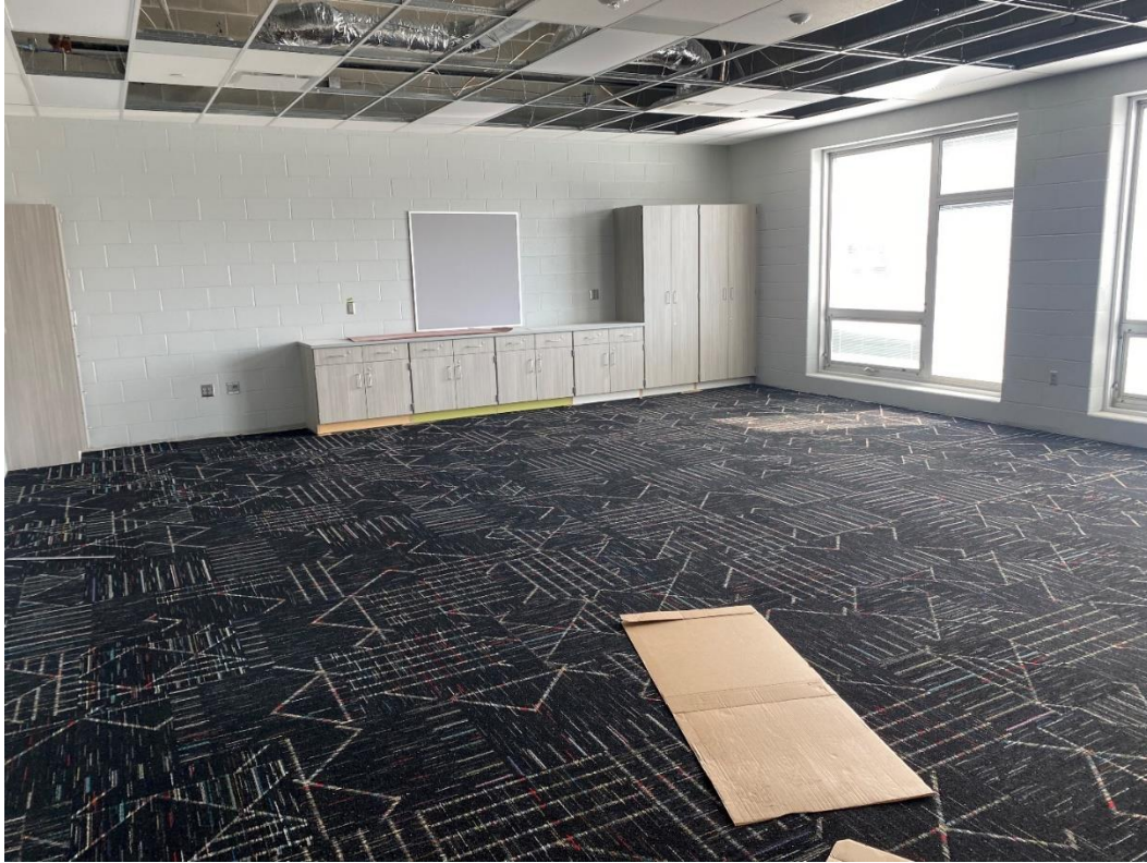
Installation of carpet is progressing in Area D classrooms.