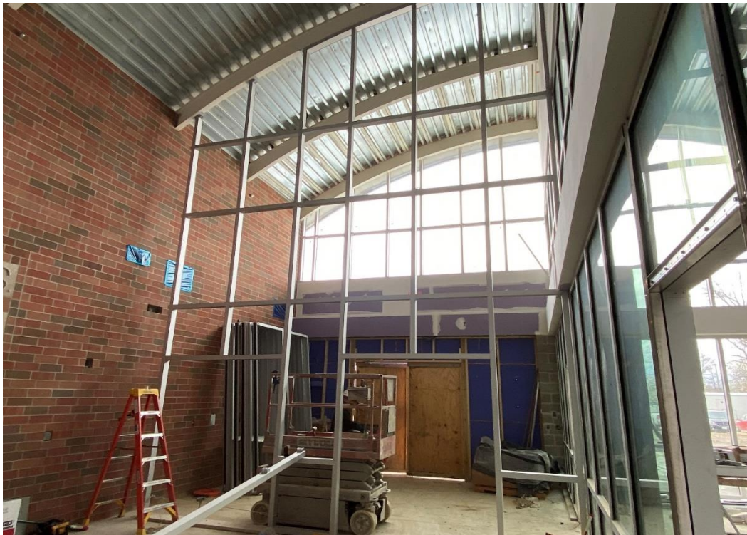
Interior vestibule storefront and glass systems is progressing.