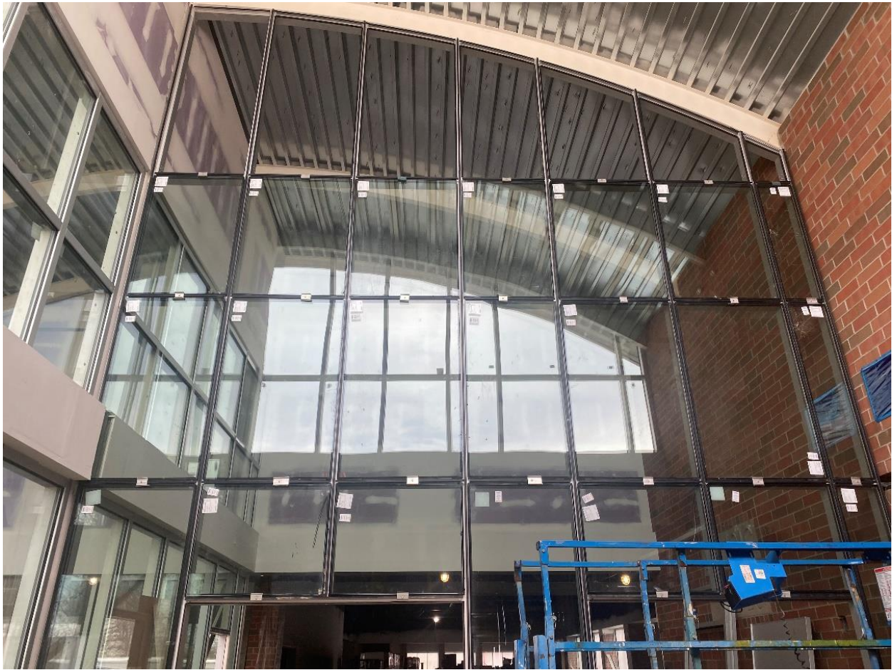
Installation of storefront systems and glass is progressing in the main entry vestibule.