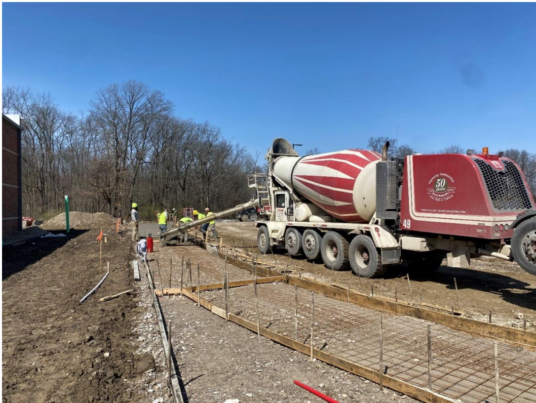
Concrete placement north of the Music Classrooms.