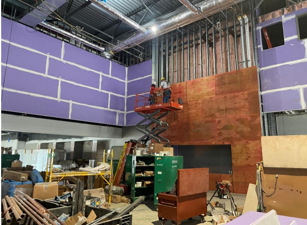
Installation of plywood backing for wood paneling at the concessions area is progressing as well as drywall tape and finish