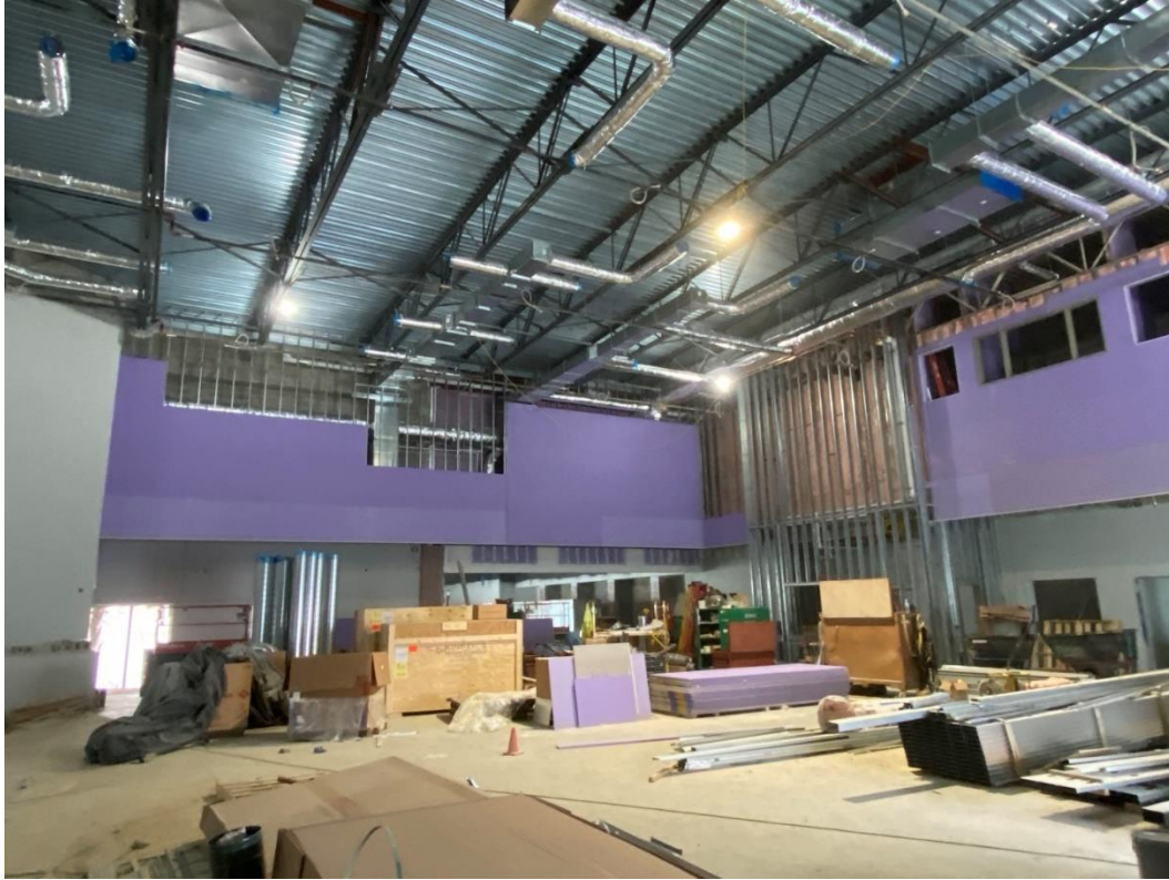
Drywall is being installed in the soffits concealing ductwork in the Performing Arts Center.