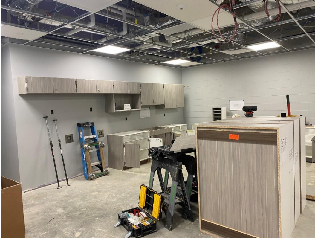
Installation of cabinetry continues in Area B.