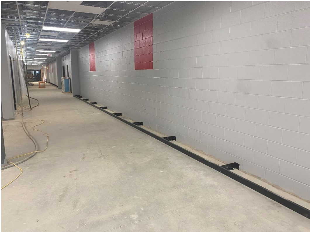
Locker bases are installed in all areas; locker installation to follow next week.