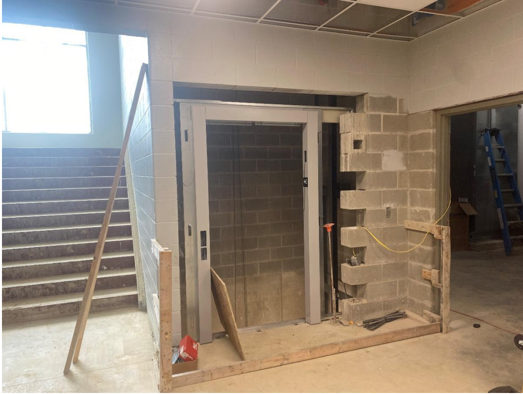
Elevator doors are being installed at both levels.