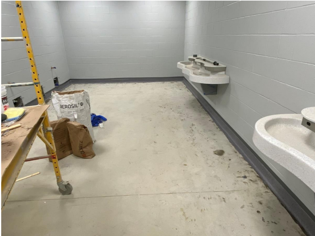
Epoxy base is installed in the toilet rooms east of the Gym