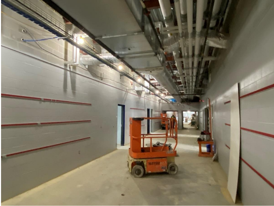
Tack strips are installed on corridor walls outside of the Art Classrooms.