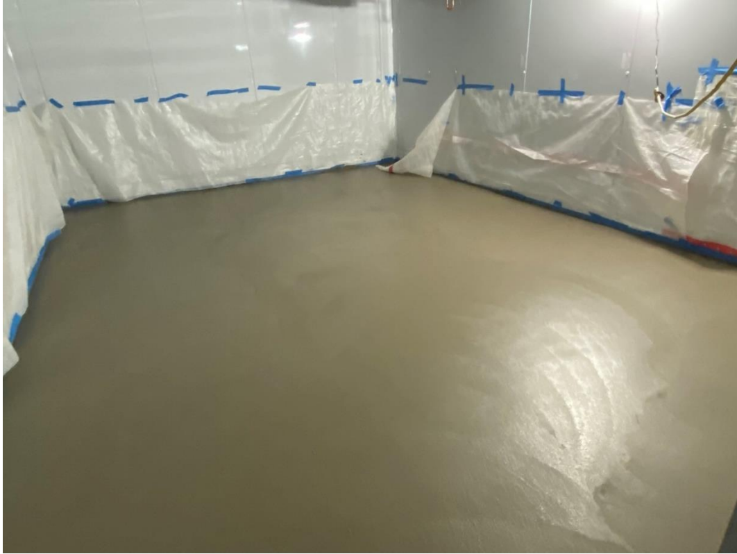
Slabs are installed in the Kitchen freezer/cooler.