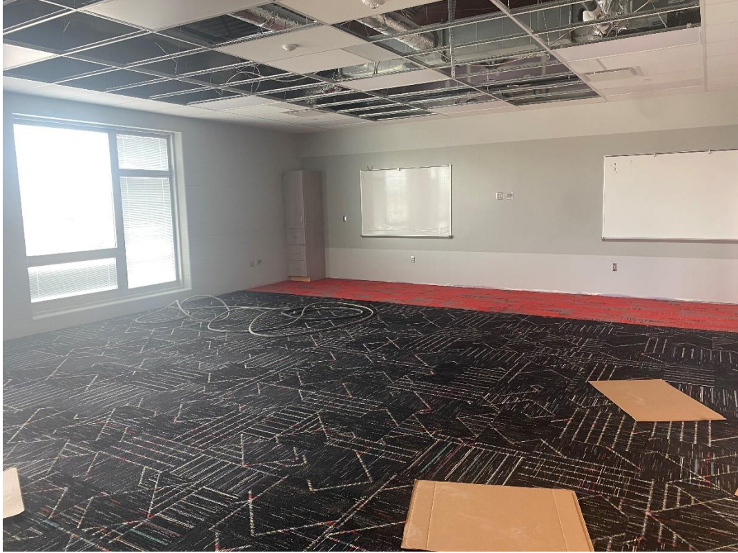
Carpet is installed in Area D Classrooms.