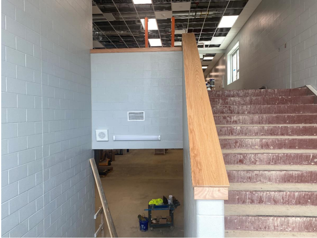
Wood trim on stair walls is installed.