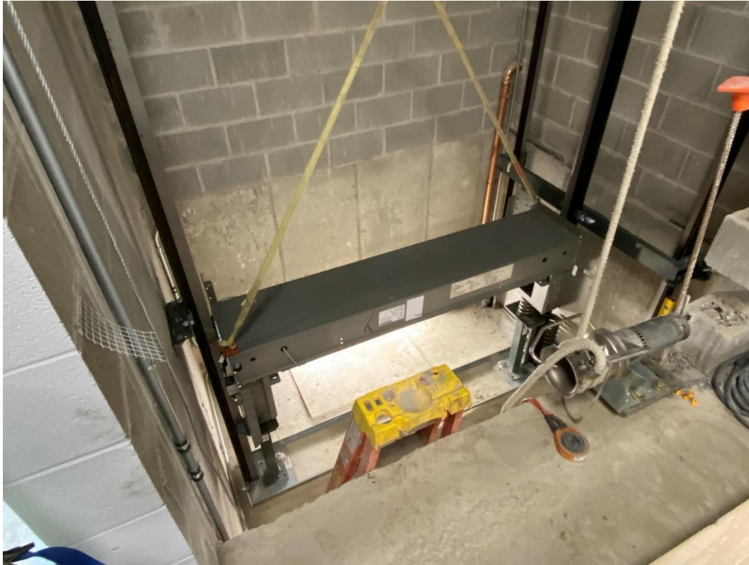
Rails are being installed for the elevator in the elevator pit.