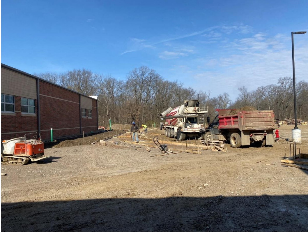
Exterior concrete work continues on the west side.