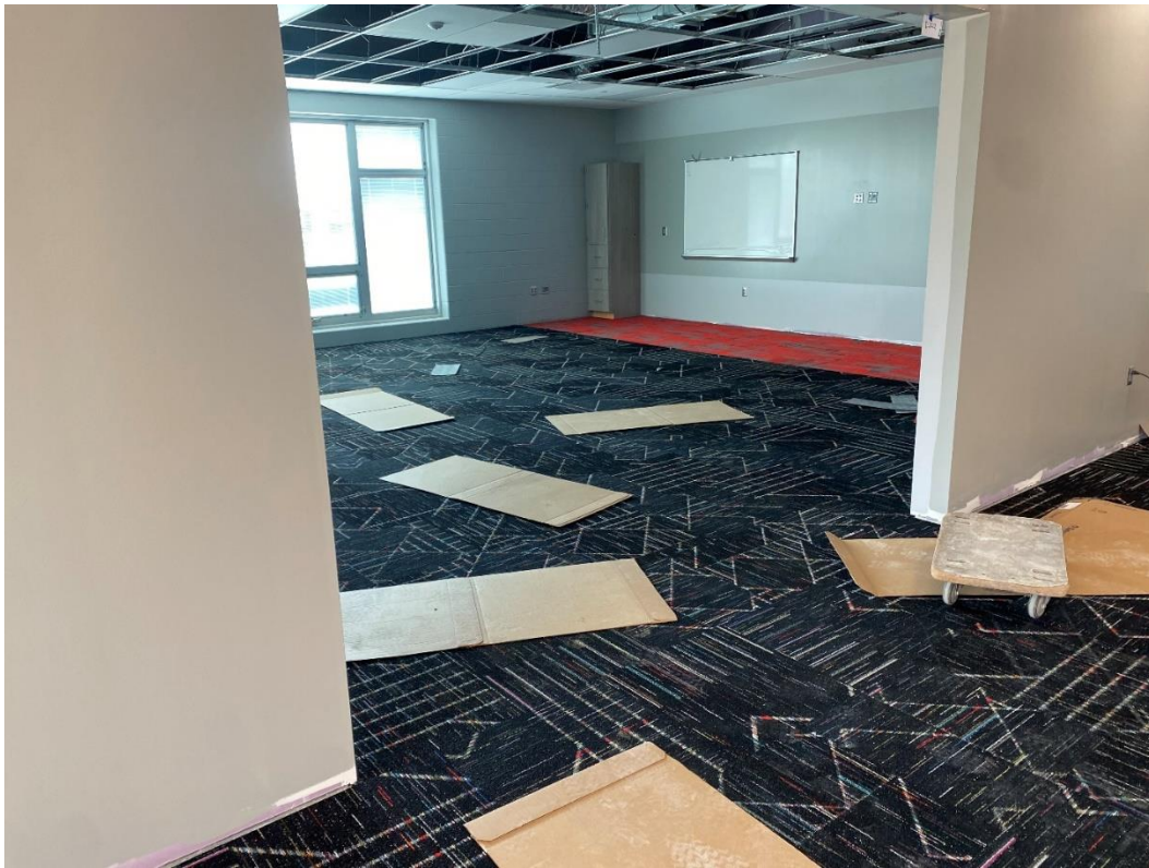
Red carpet is used at the entry areas to classrooms.