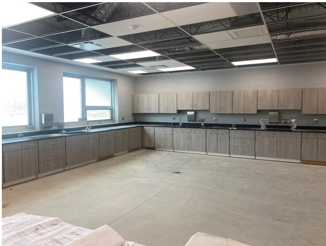
Epoxy counters are installed in the Chemistry Classroom.