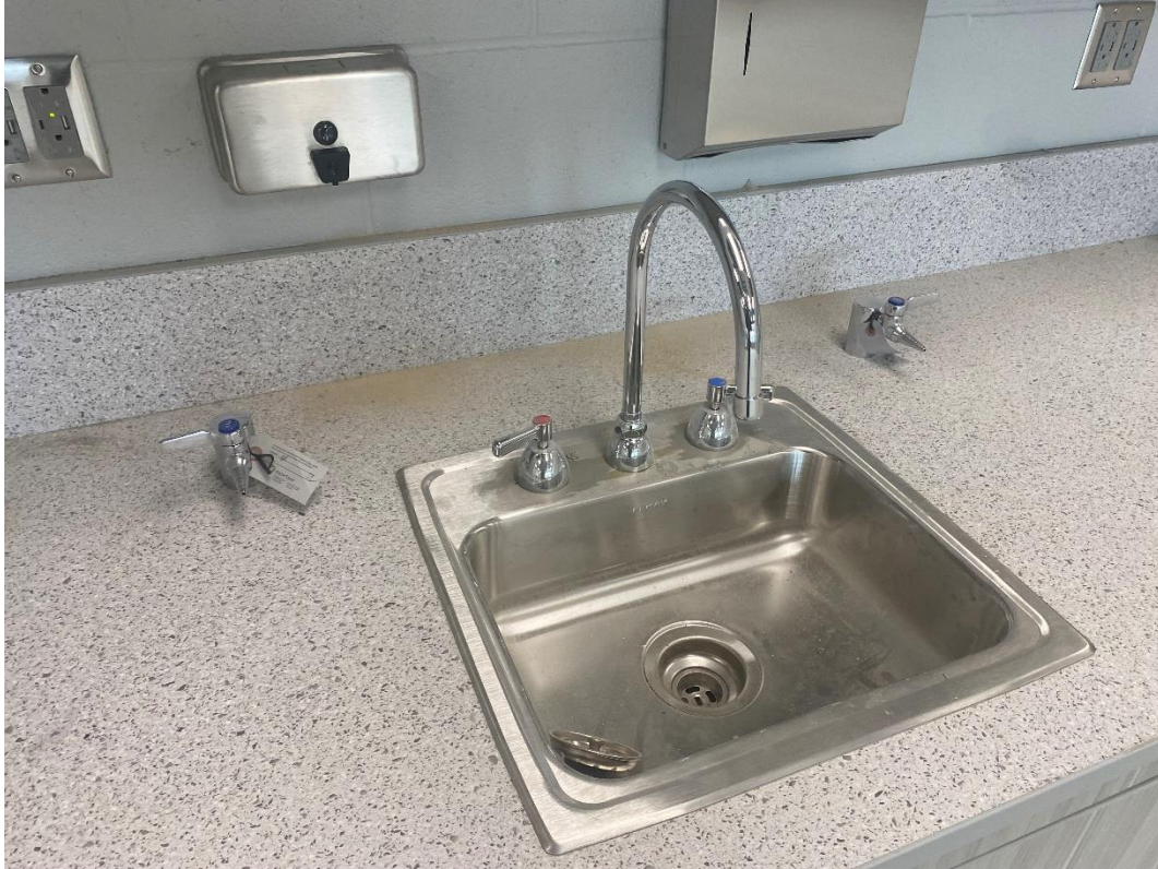
Chemical resistant counters, gas fittings, and accessories are installed in the Biology Classrooms.