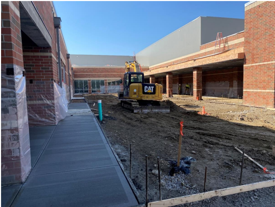
View looking south toward the event entrance on the north side.