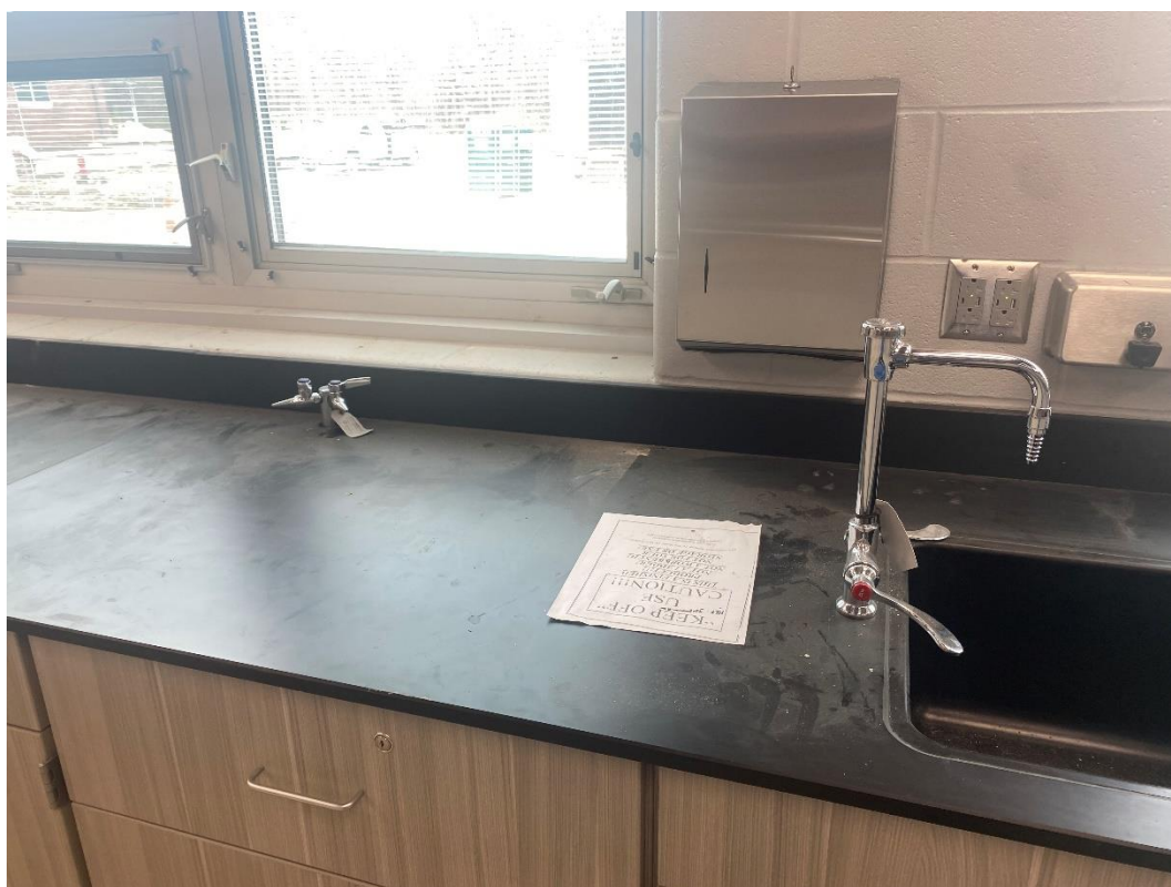
Water and gas fittings, and accessories are installed at the Chemistry sinks and counters.