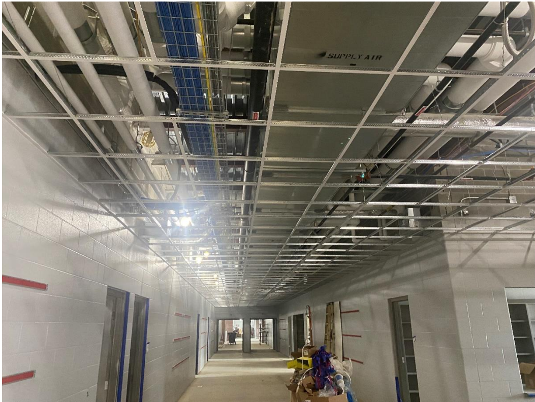
Ceiling grid is installed in Area C, first-floor.