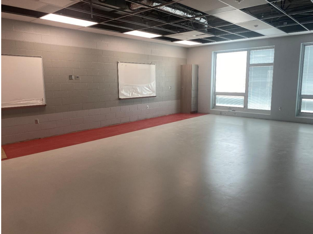
Vinyl tile is installed in Area D classrooms.