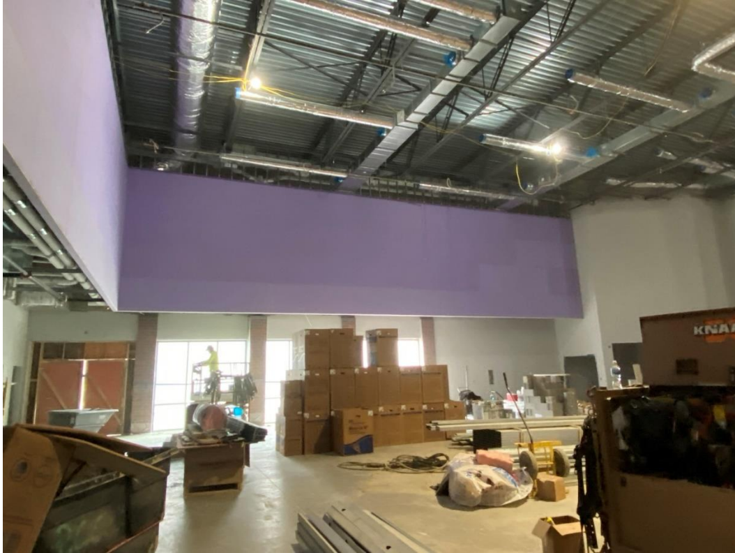
View looking west in the Performing Arts Center.