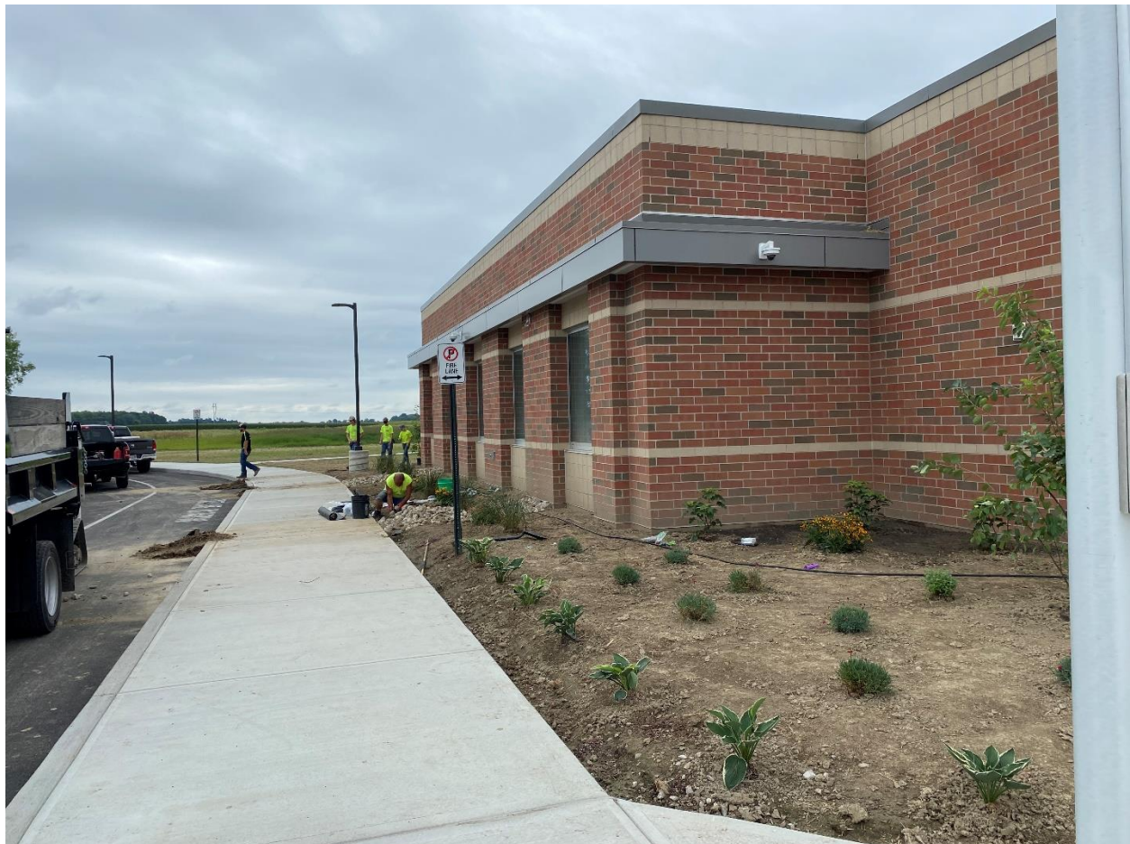
Landscape planting is being completed.