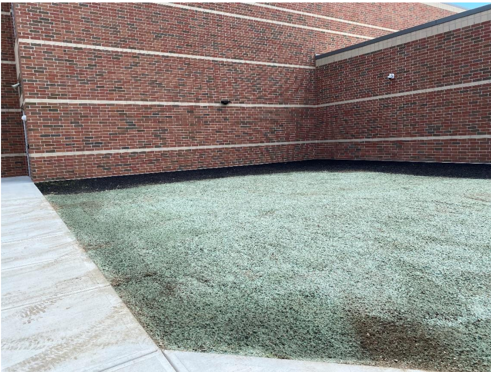
Mulched areas are planned for future landscape planting.