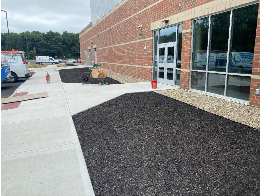
Planting beds on the west side are installed.