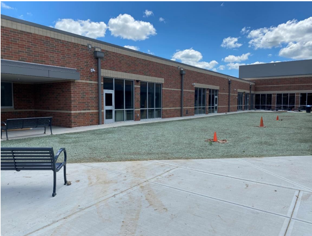
Lawn areas are nearly complete.