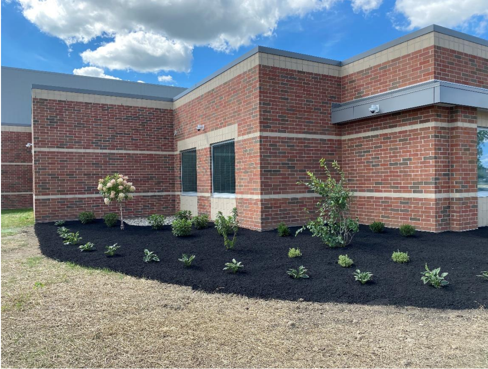
Landscape planting is complete, mulched, and drip irrigation system is installed. Planting beds will be edged once the grass is established and a sharp edge can be cut.