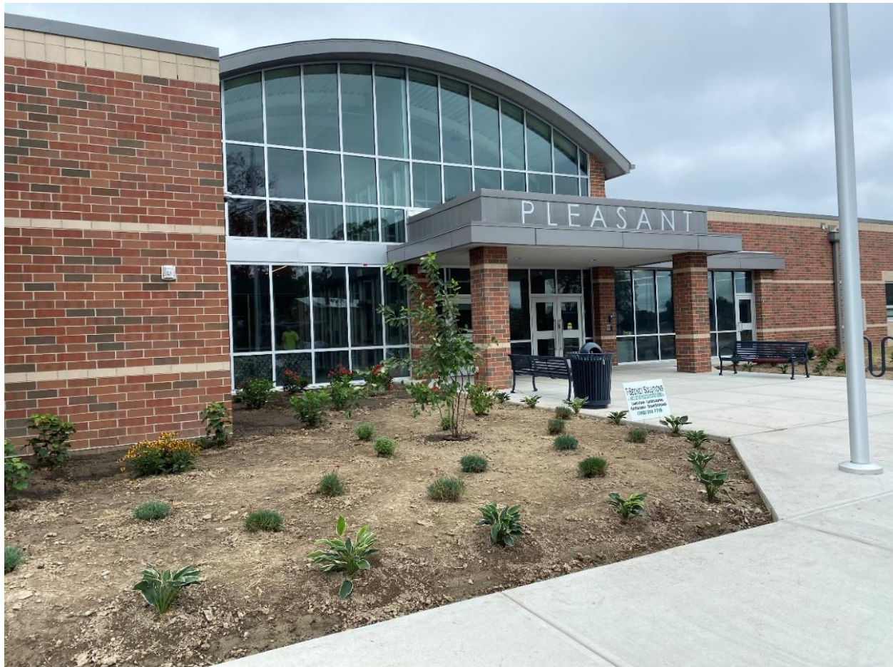
Landscape planting at front entry.