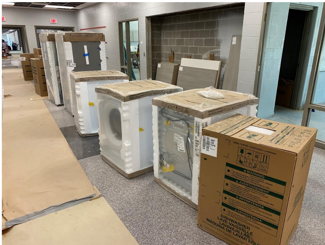
Appliances are staged in the main Area c & d corridor for installation.