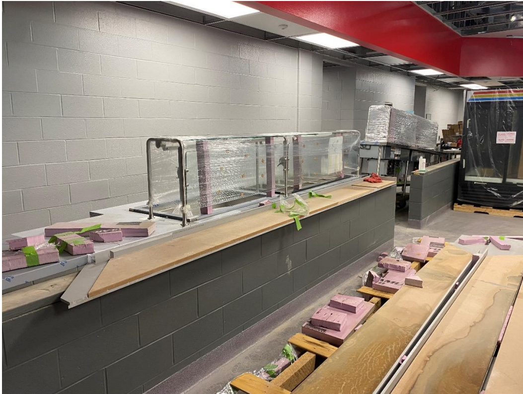
Serving line screens are being installed in the Kitchen.