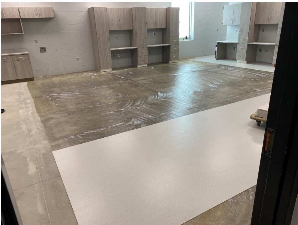
Vinyl flooring is being installed in the Teacher Prep area.