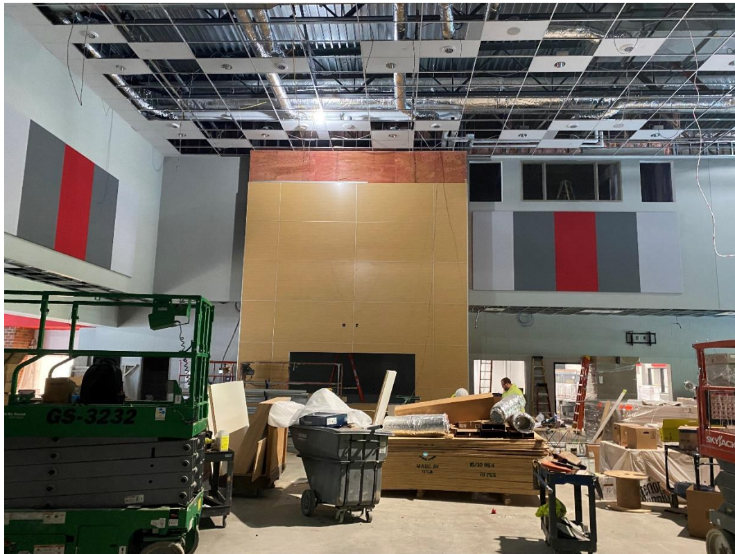
Wood look panels are installed on the concessions area walls.