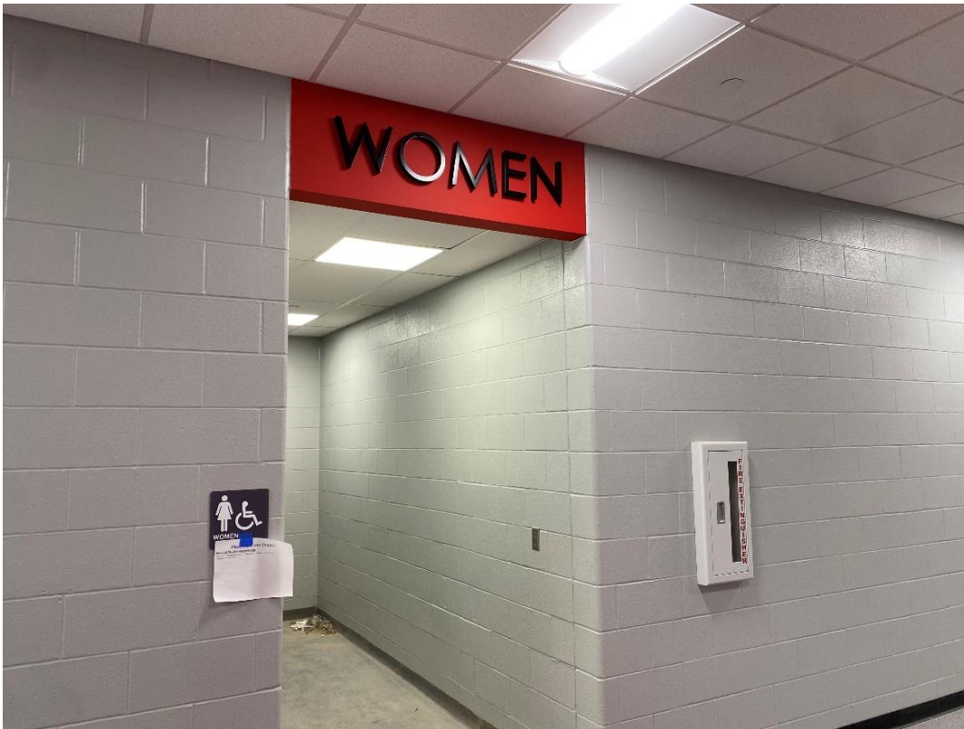
Interior signage installation is progressing throughout the building.