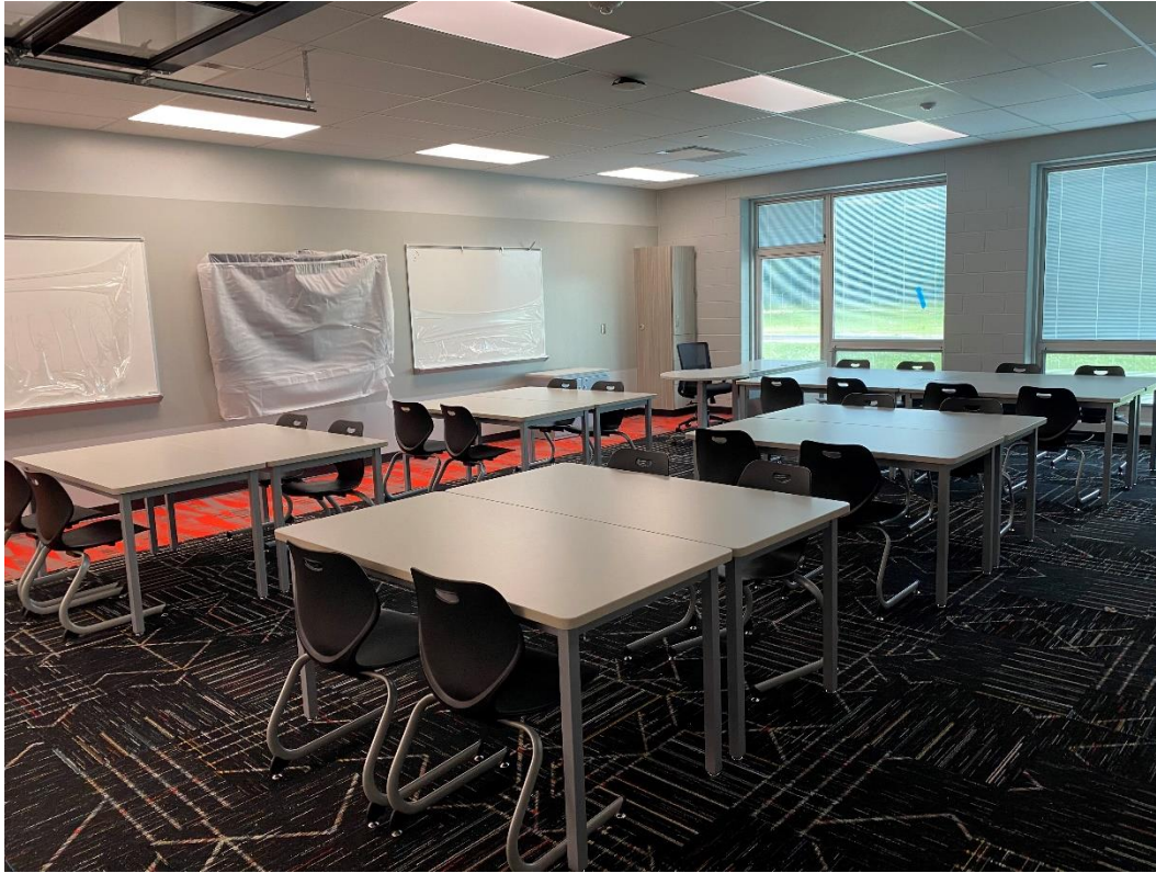
Typical classroom with assembled furniture.