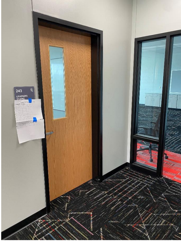
Interior wood doors are being installed throughout.