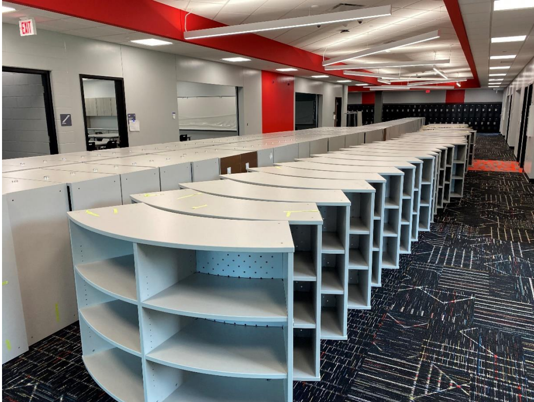
Bookcases for the Flex-Space Studios will be distributed to all Flex-Space areas.