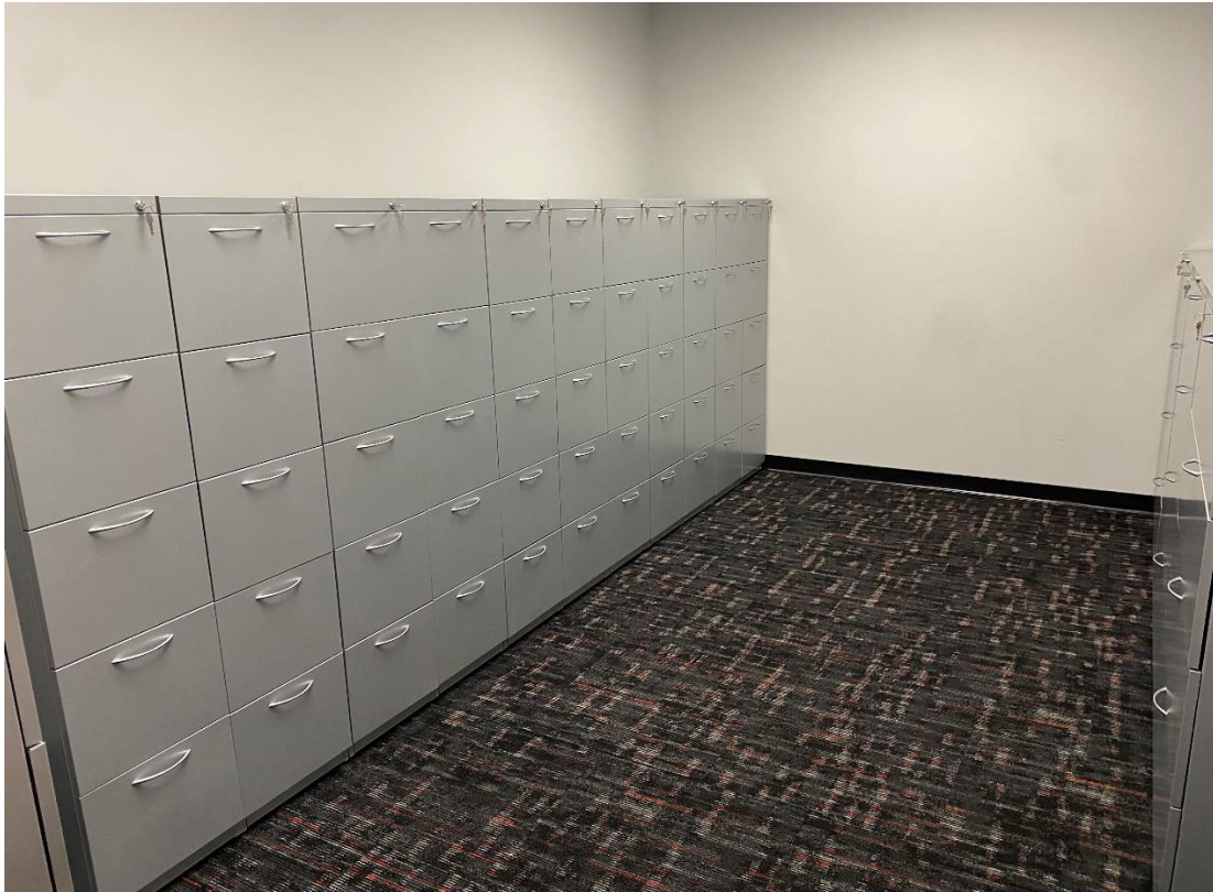
Furniture/files are being placed in the Administrative Offices.