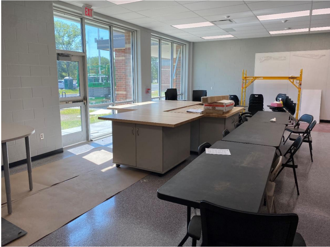
Work tables are being placed in the larger Idea lab/Maker Space.