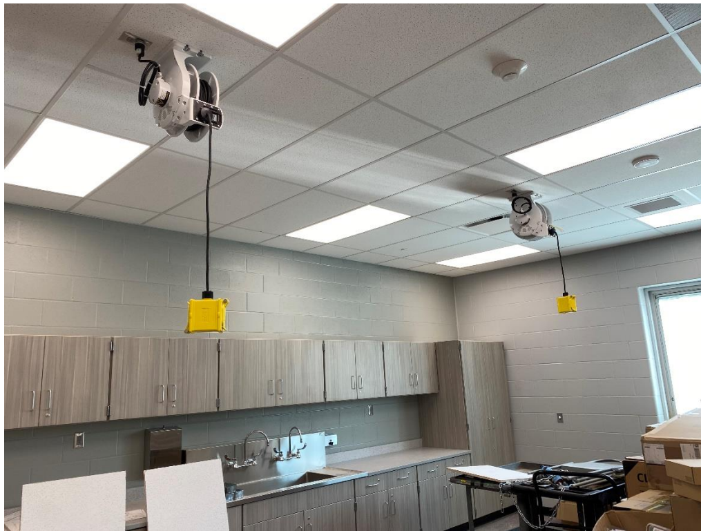
Power drops are installed in the Idea lab/Maker Space