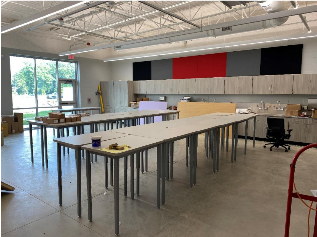
Art classroom furnishing are being placed.