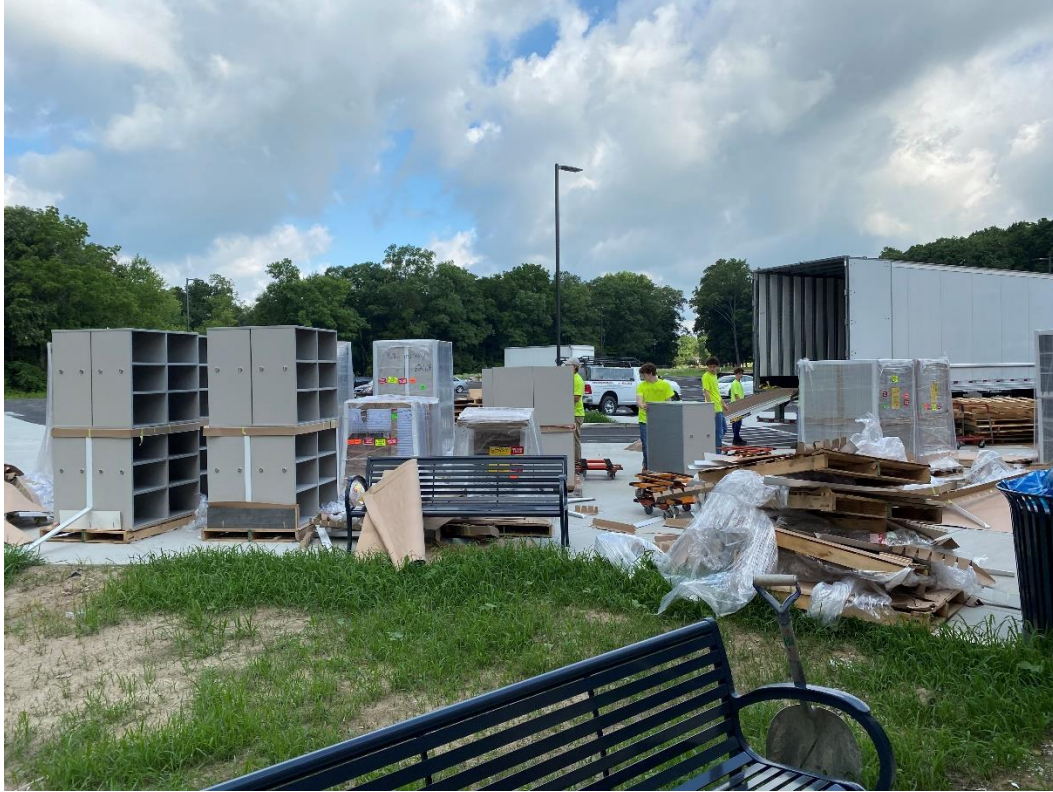
Deliveries of furniture continue to arrive.