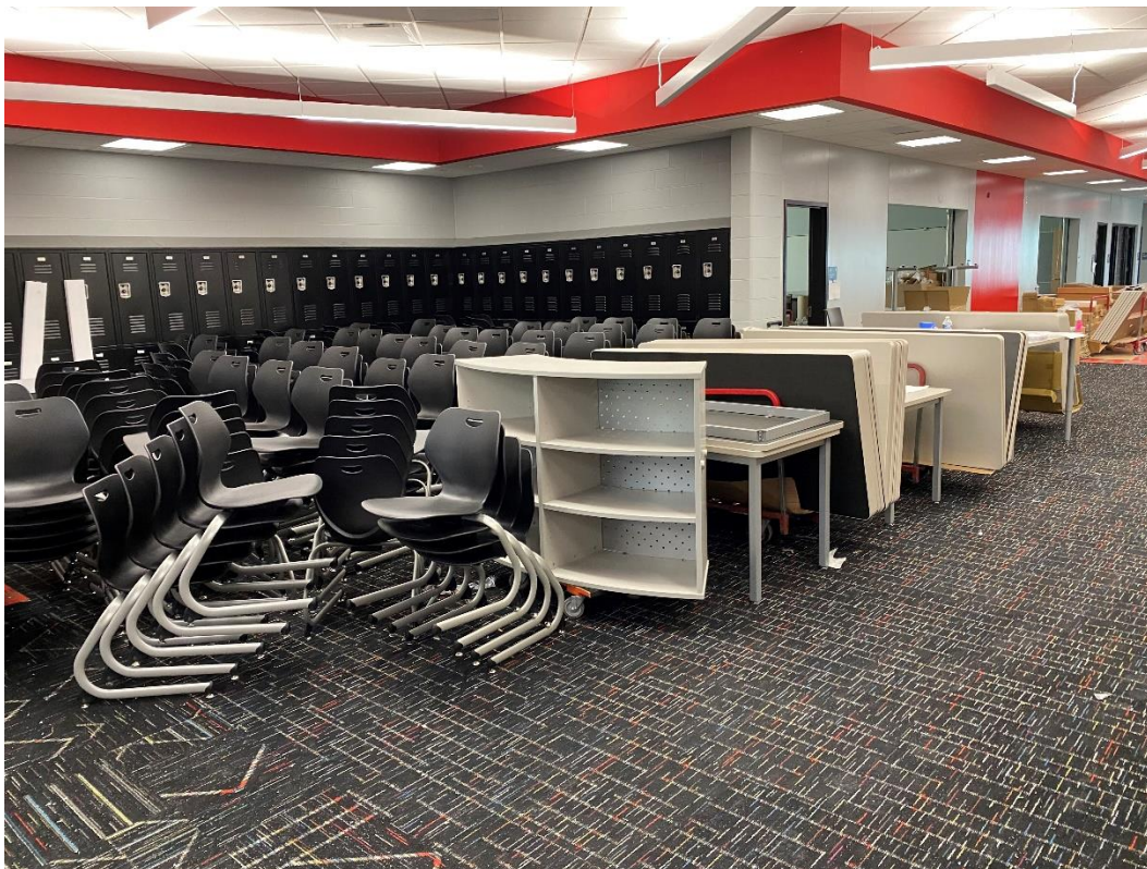
Furniture is assembled and staged for installation in individual areas.