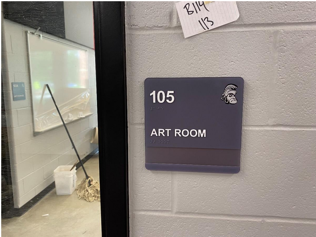
Signage is being installed throughout.