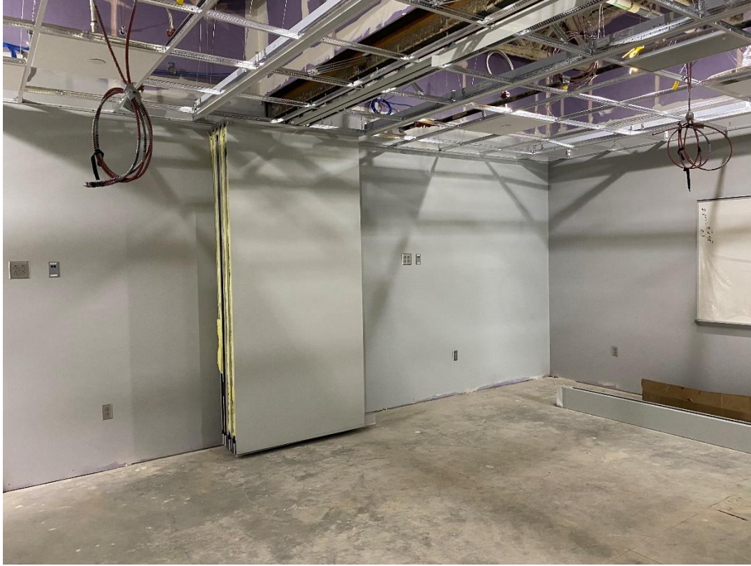
The operable wall is installed in the Area A Conference Room.