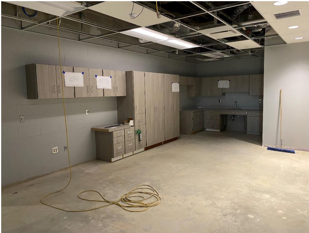
Cabinetry installation is nearly complete in the Area A Health Clinic.