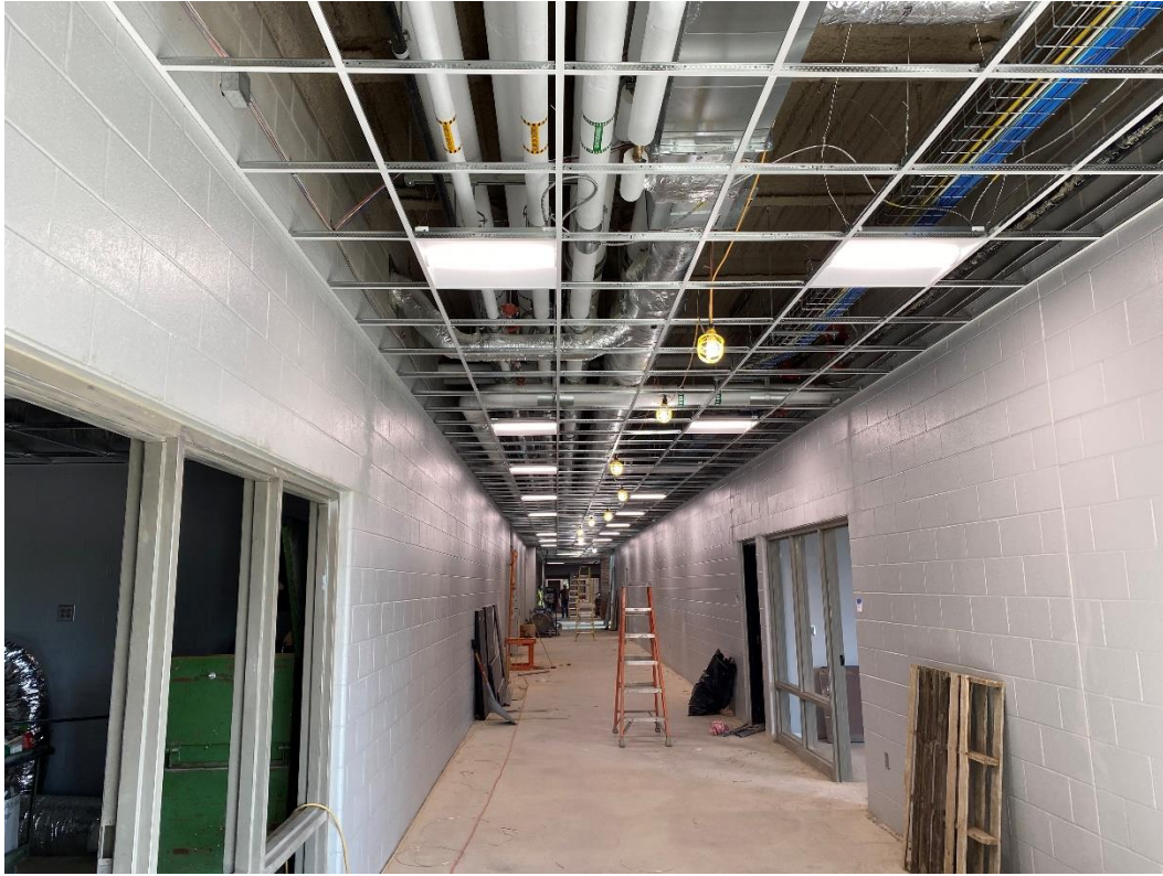
Light fixtures are installed in the main corridor east of the Gym.