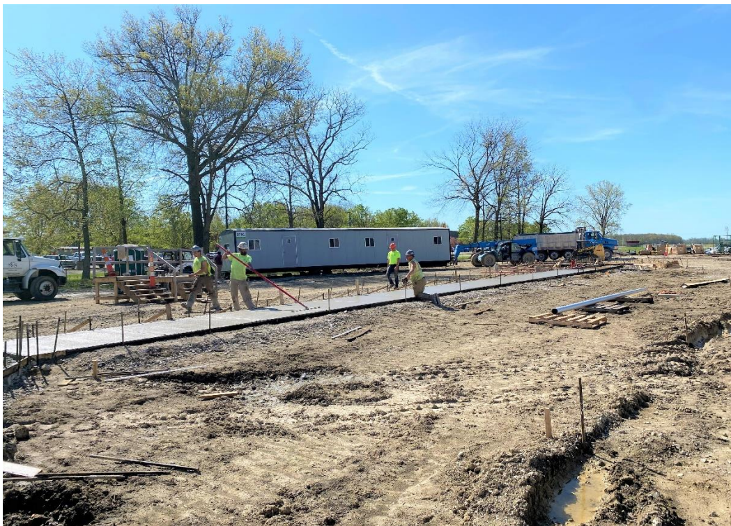
Concrete is finished on the east front walks.