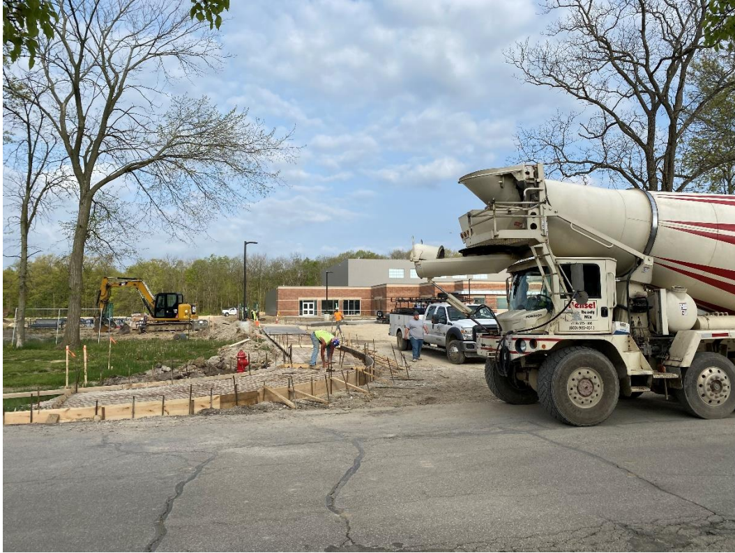
Concrete is ready to be placed at the south entrance drive.