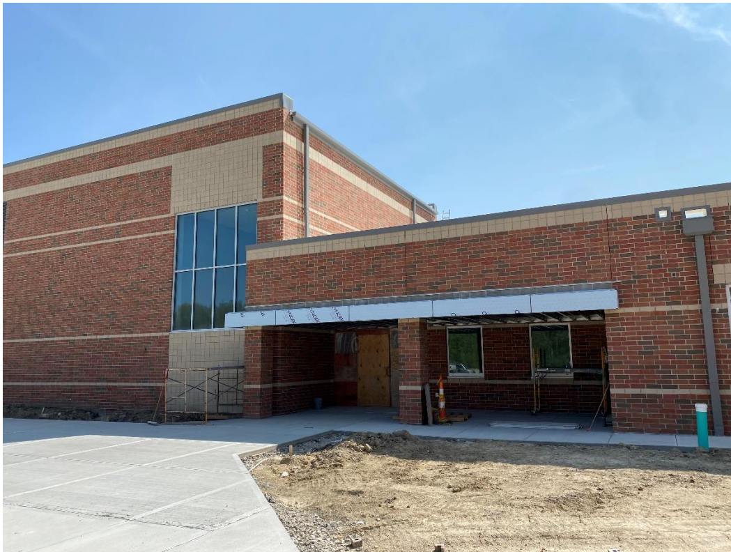
Exterior metal trim at the west entry is complete, metal flashing at the wall line is yet to be completed.