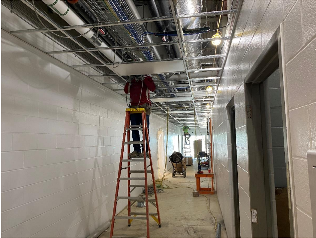
Ceiling grid and lighting is being installed in the Locker Room corridor.