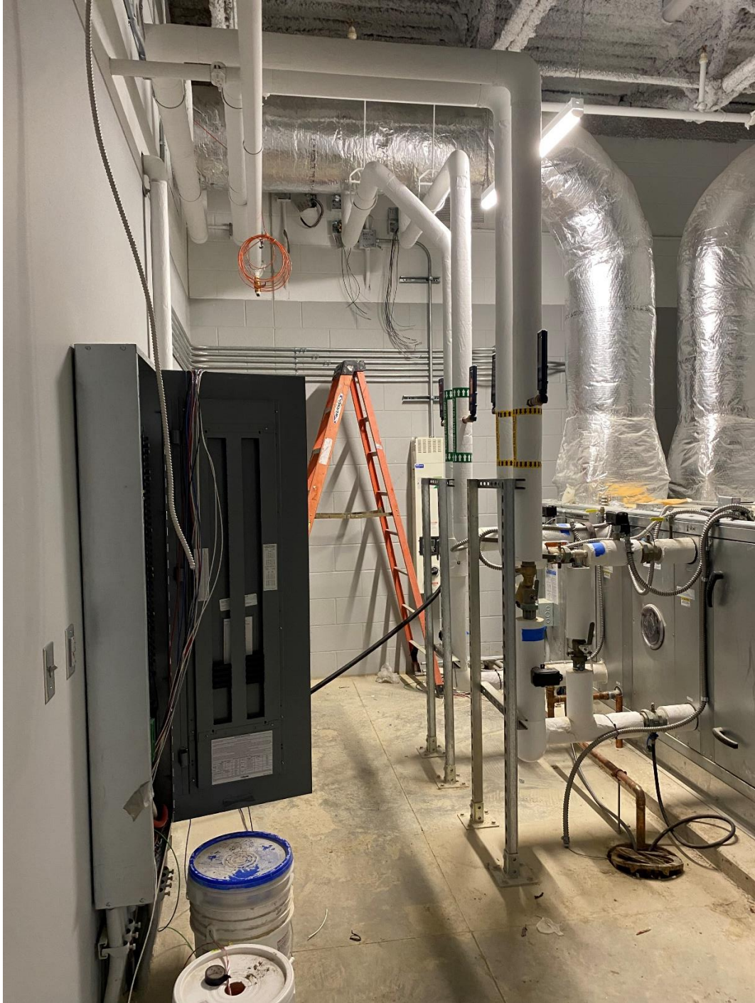
Area A mechanical room ducts and piping are insulated.