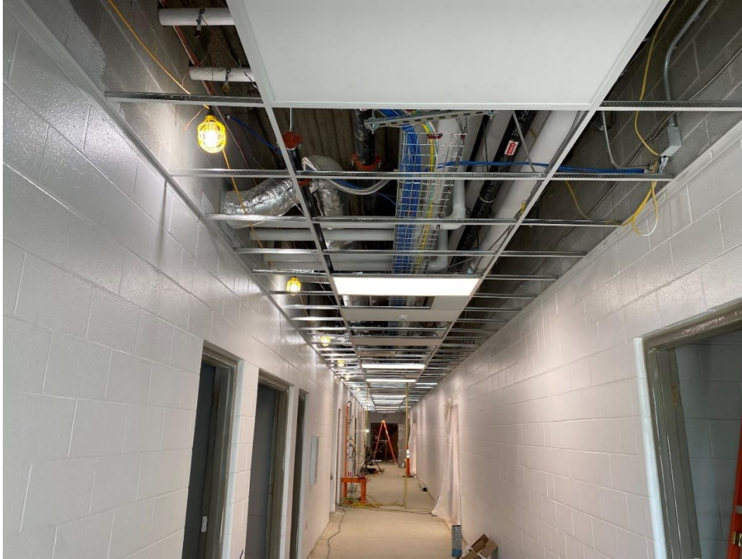
Light fixtures are installed in the Locker Room corridor.