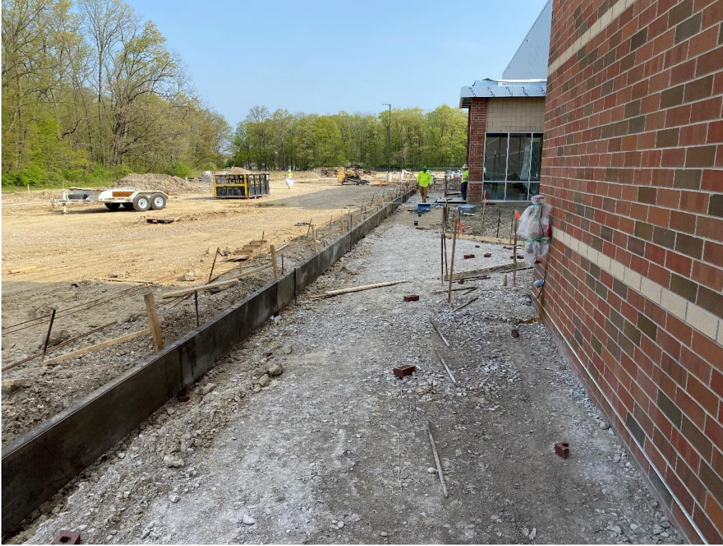
Forming for concrete walks and curbs continues on the west side.