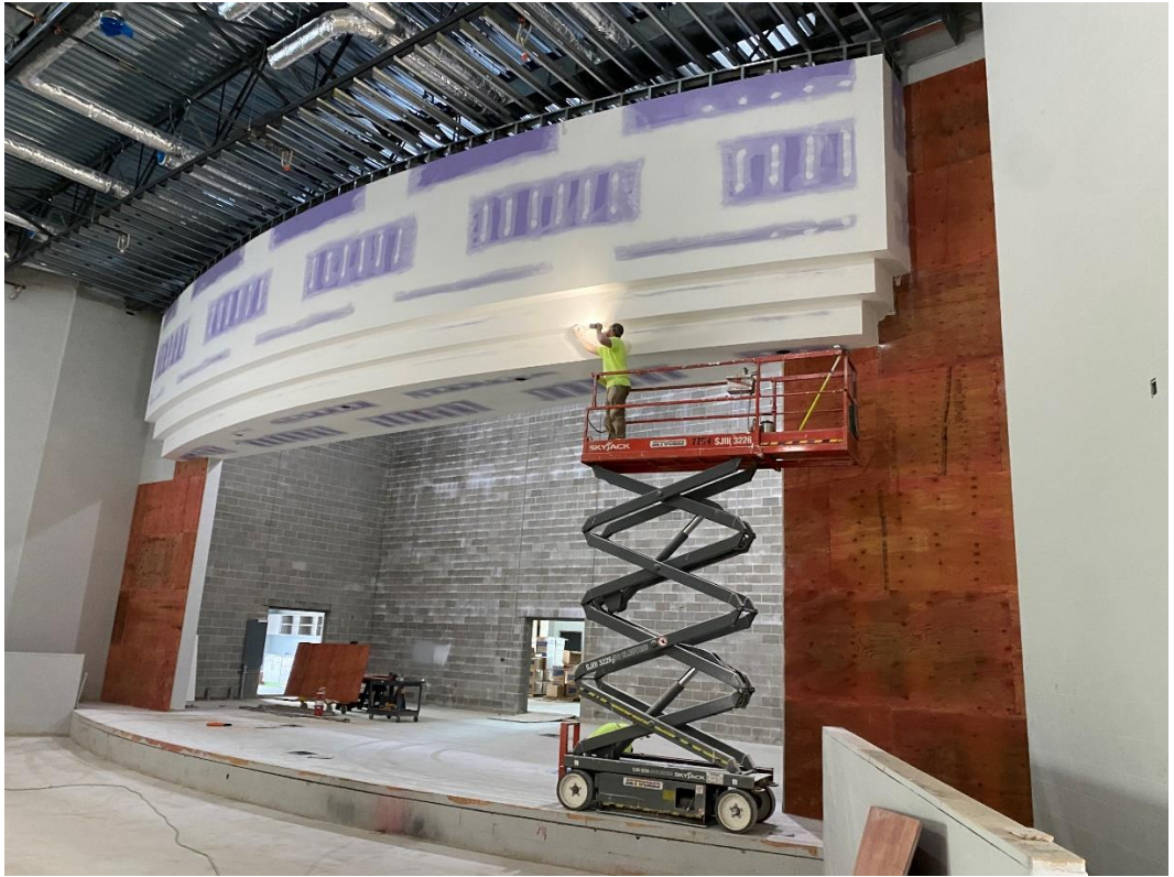
Area F painting is scheduled for completion next week.