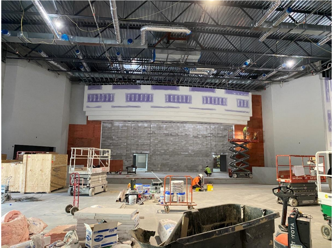
Drywall finishing is being completed at the stage proscenium.