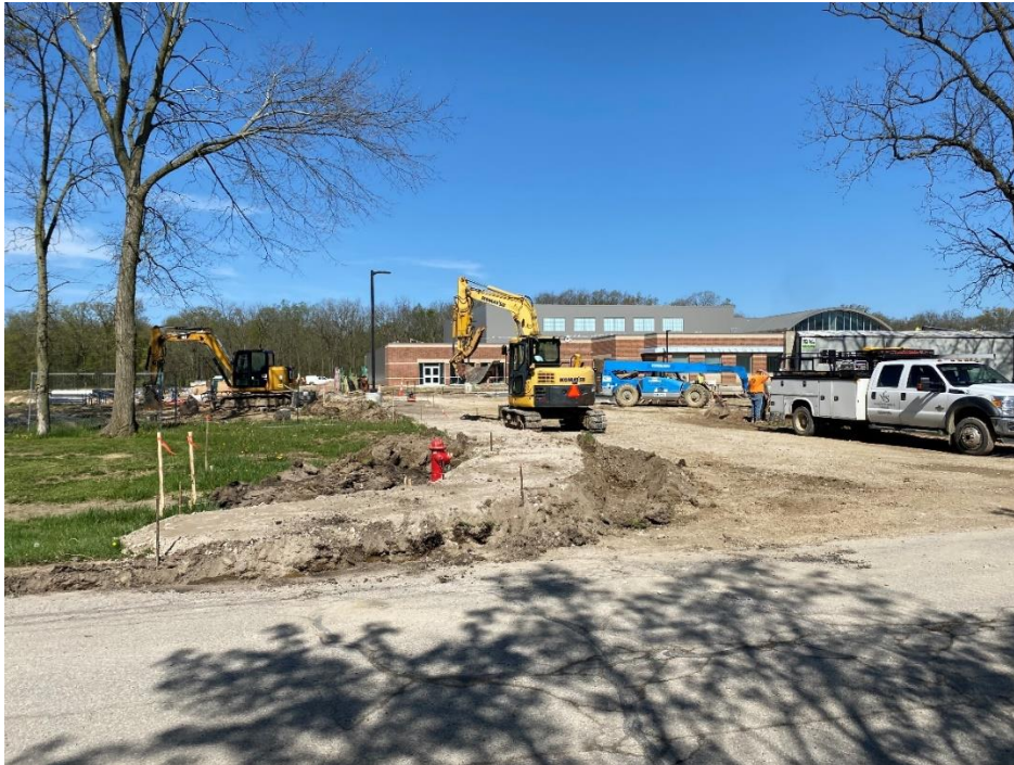
Excavation for curbs and walks at the south entry.