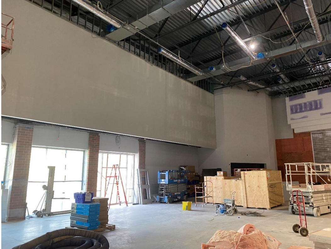
Drywall soffits enclosing HVAC ductwork is being painted, Area F, Performing Arts.