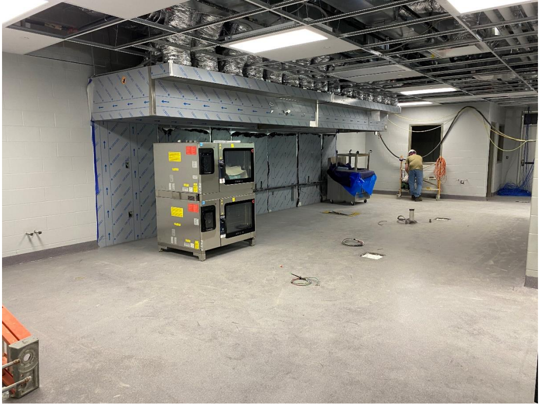
Kitchen equipment is being placed for final connections.