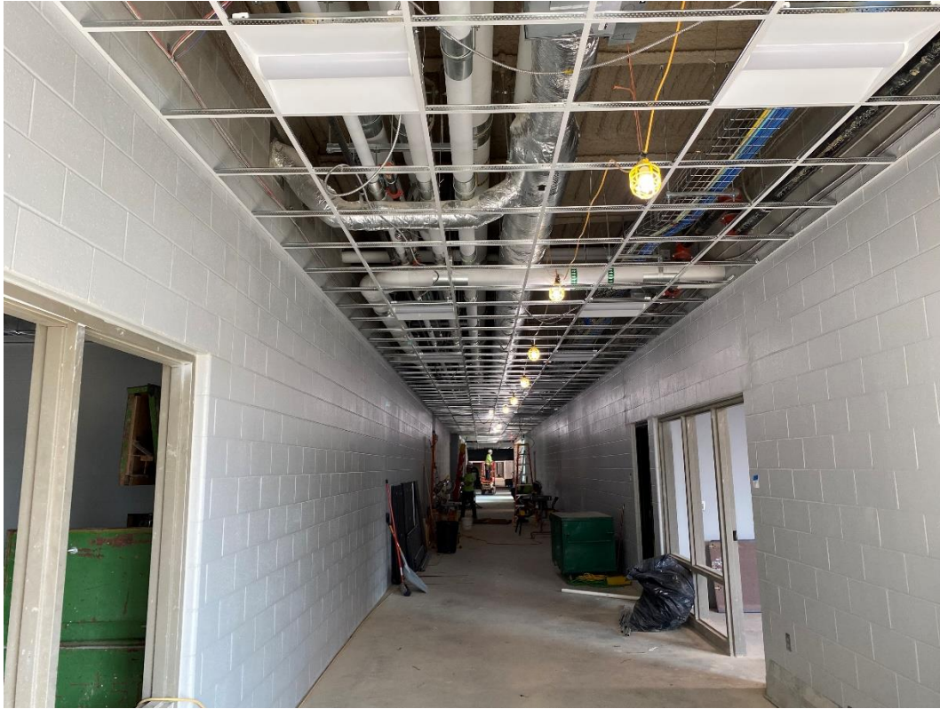
Ceiling grid installed in the main corridor east of the Gym.