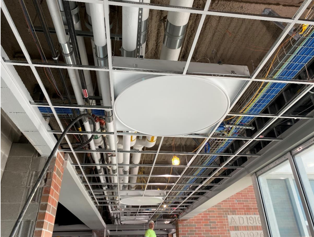
Ceiling grid and lighting at the main entry.