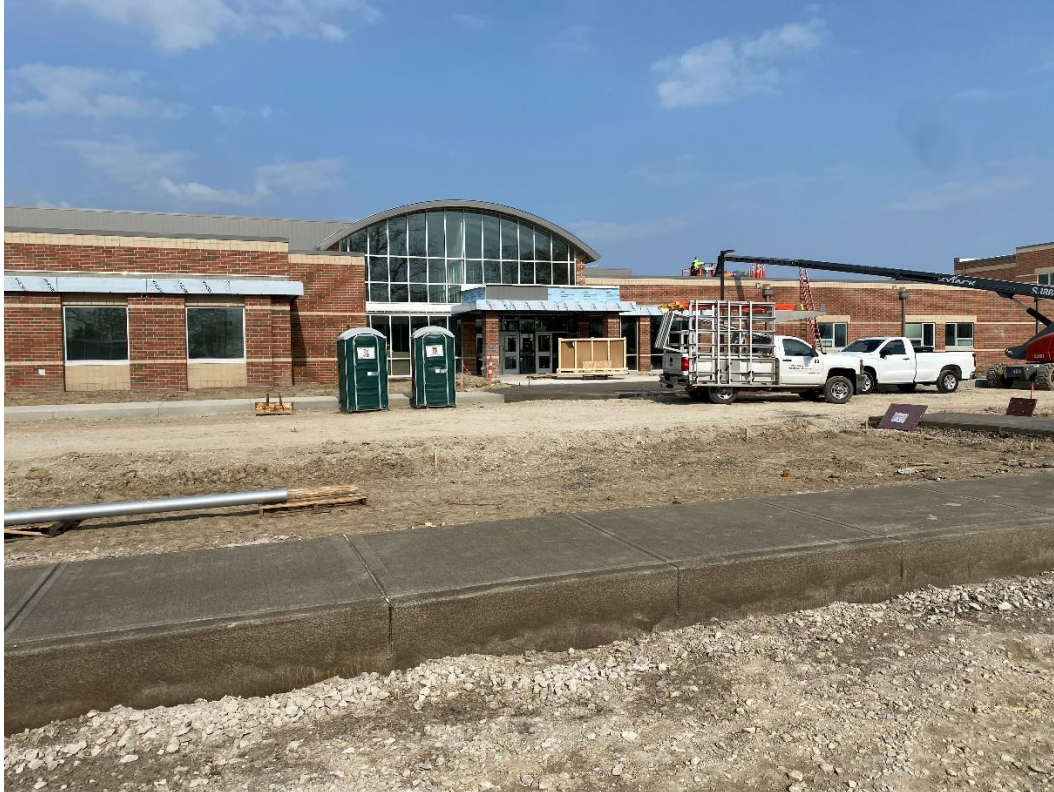
Flagpole (foreground) to be installed this week.