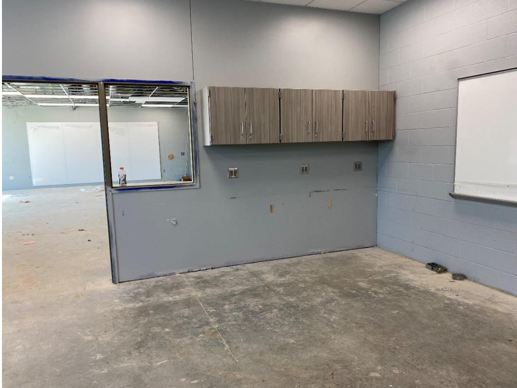
Base cabinets are removed for the printer in the Maker Space and will be relocated.