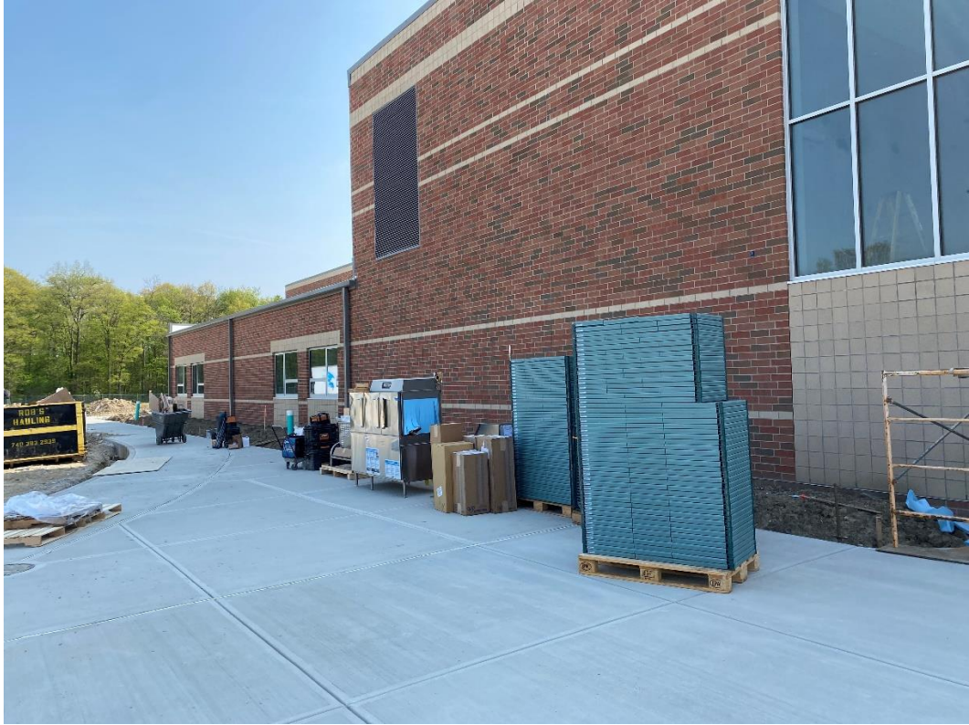
Kitchen equipment is arriving.