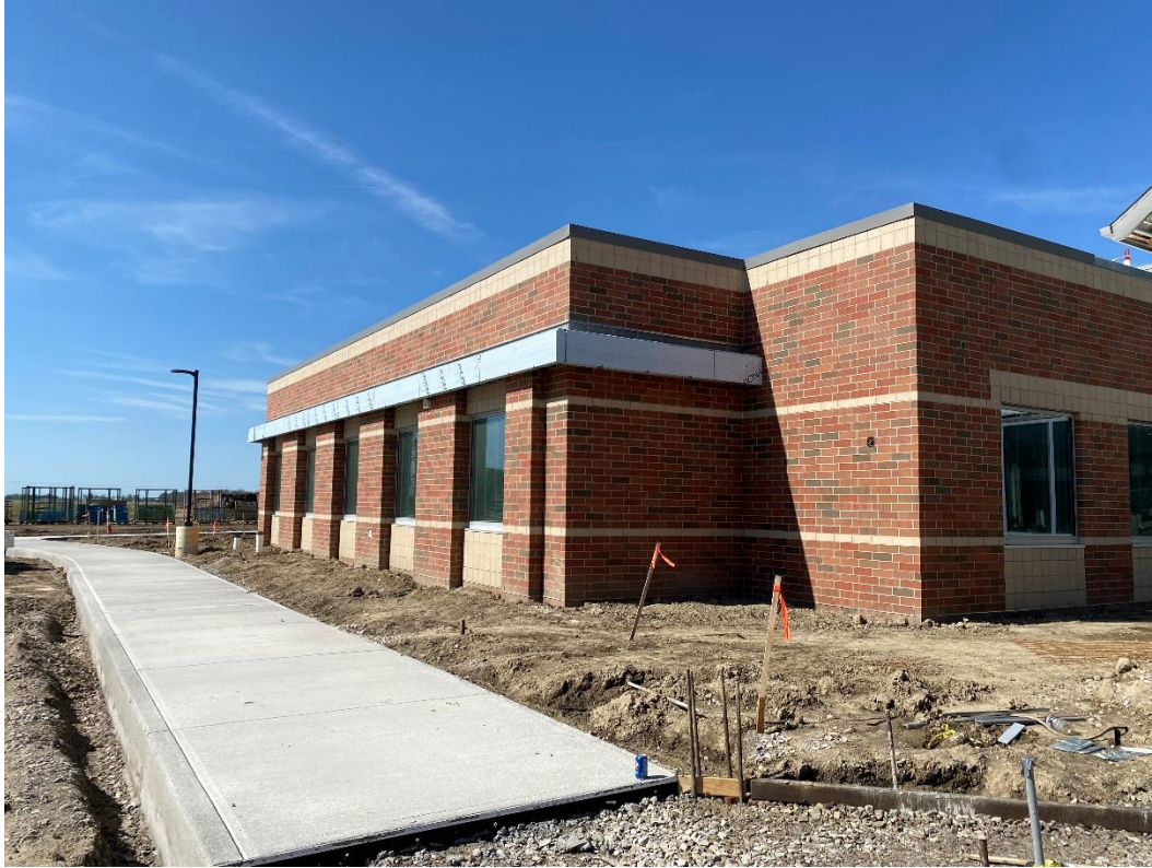
Completed walk/curb east of the Administrative Offices.