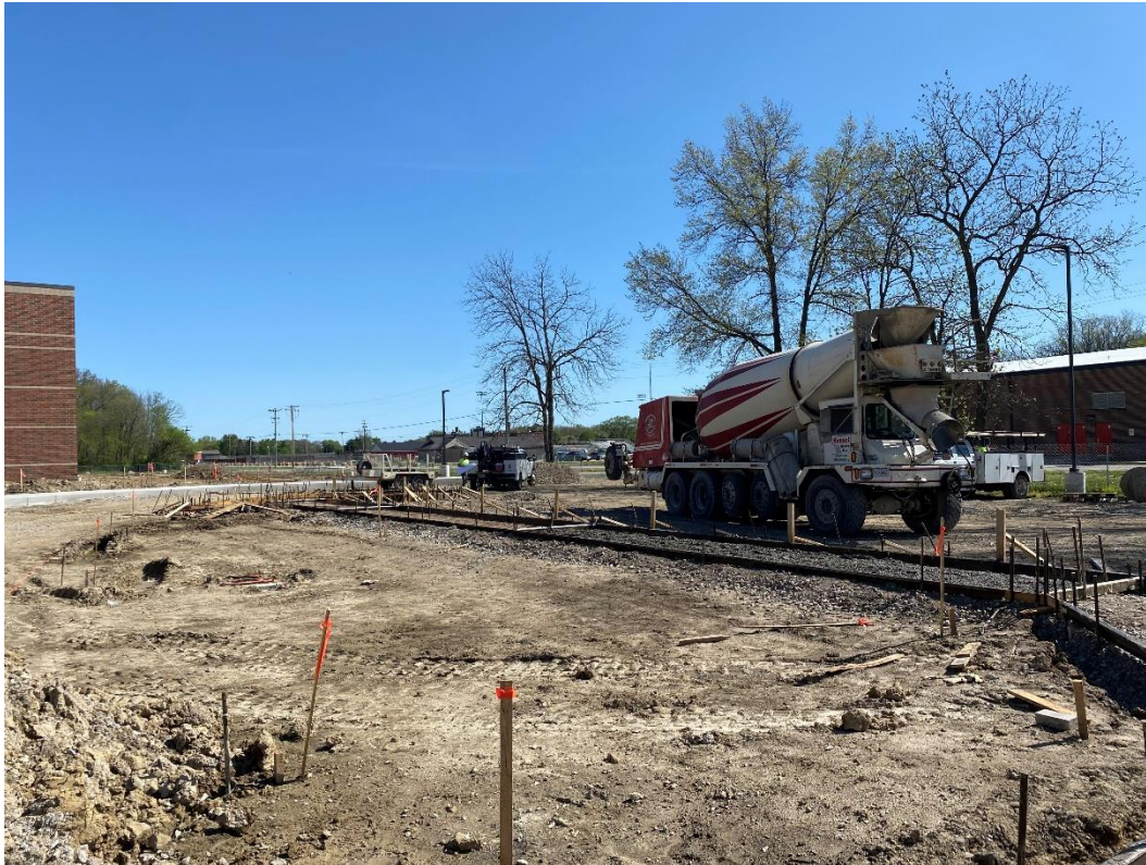
Concrete being placed for walks at the east front.