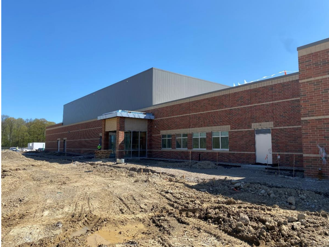
Metal trim at all exterior canopies is being installed. Protective film will be removed later.