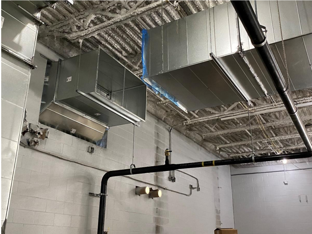
Final duct connections are being made in the main mechanical room at Area E.