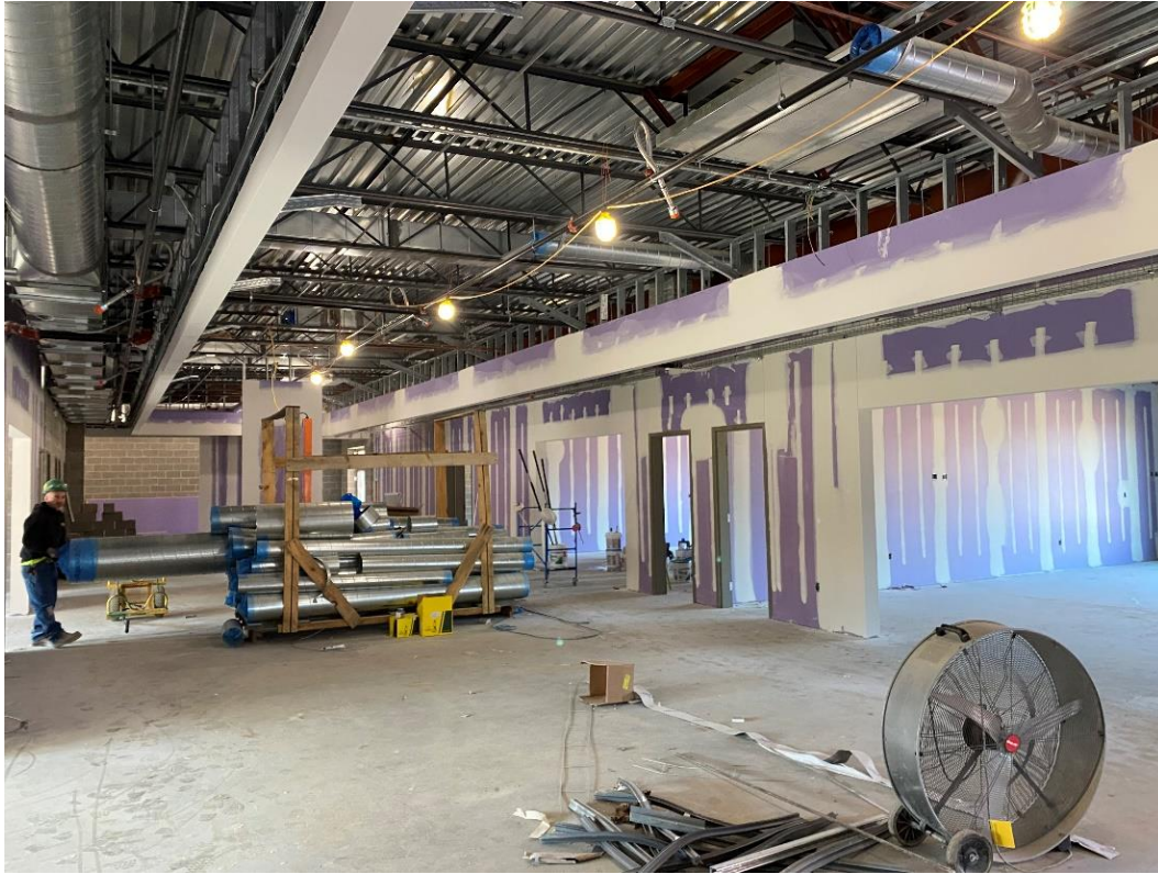
Final sanding of drywall to be completed this week at the second-floor level of Area D.