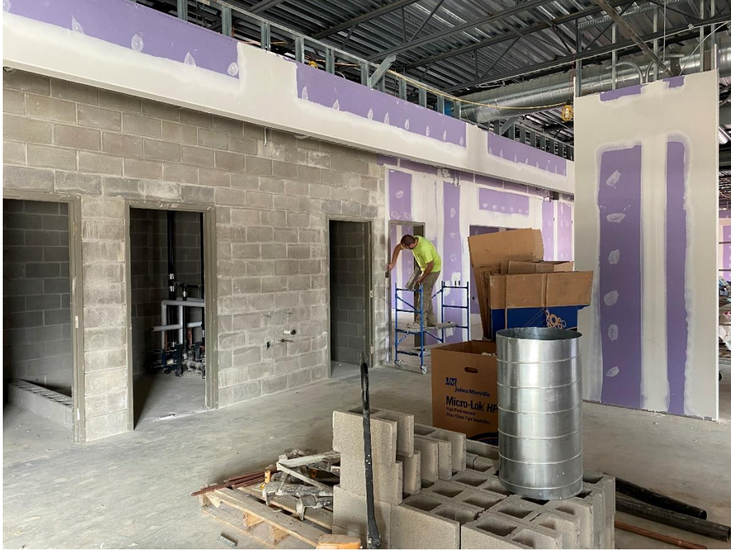
Taping and finish of drywall, second-floor, Area C continues.