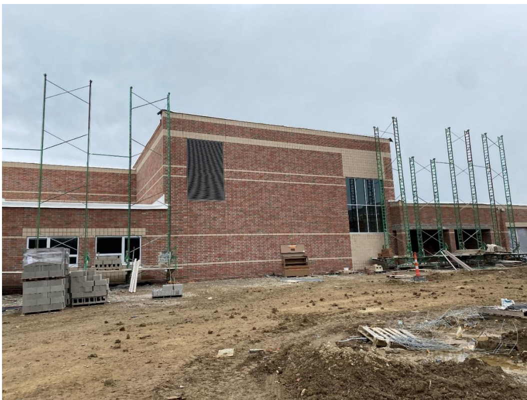
Installation of mechanical system louvers is progressing.