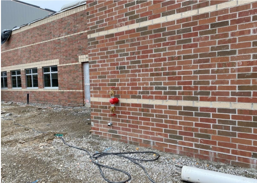
Fire pump rest header for fire protection sprinkler system.