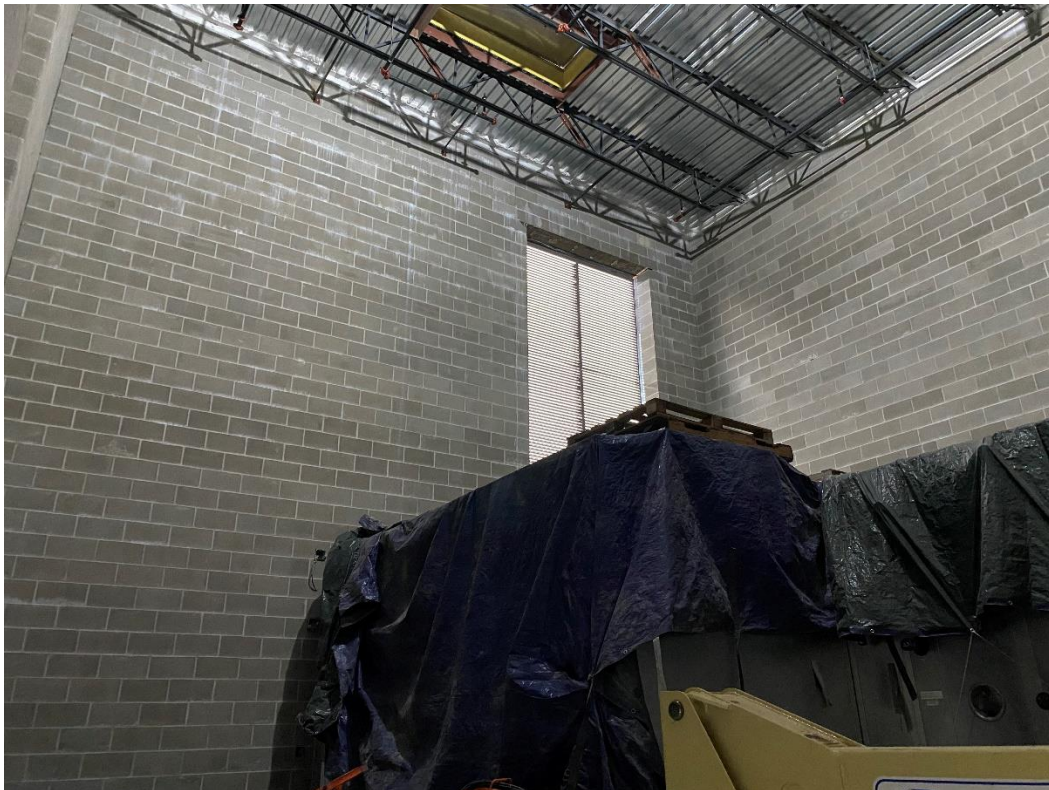
The large fresh air intake at the mechanical room that serves Areas C & D is installed.