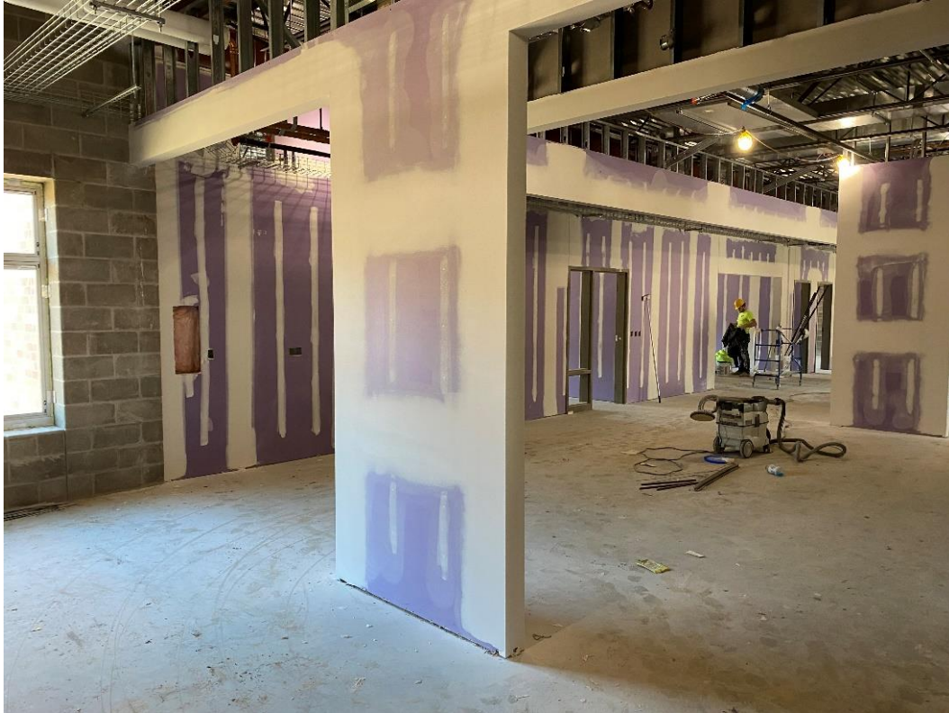
Painting of walls to start in Area D, next week.