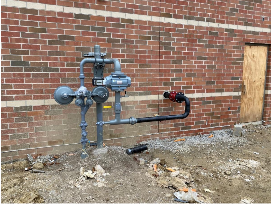
Gas service meter and regulators are installed. They correct regulators will be installed next week.