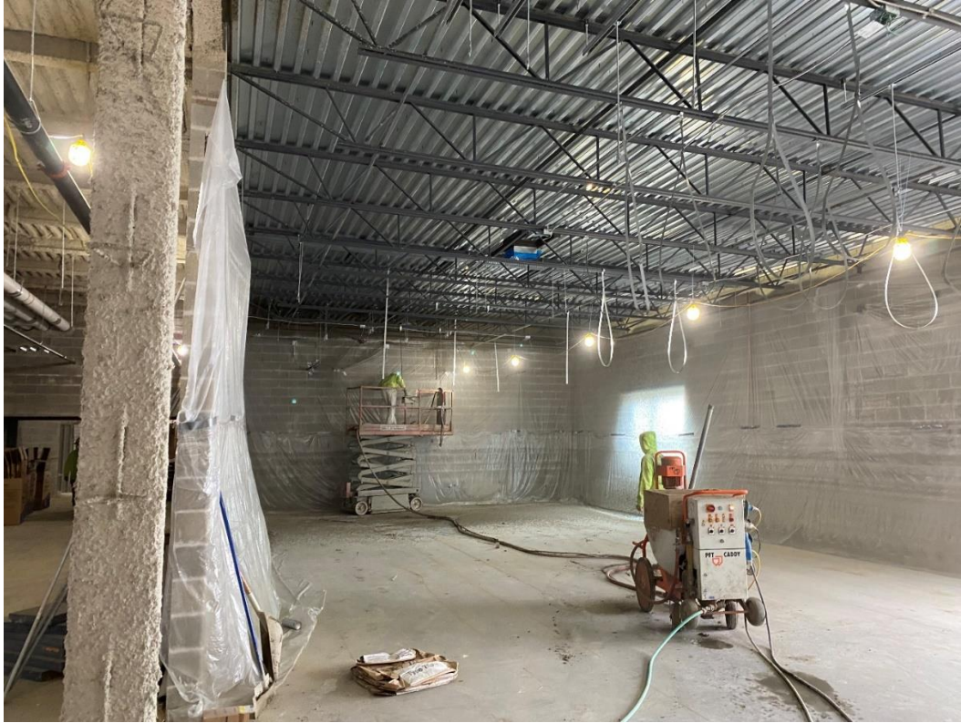
Spray-on fireproofing of structural steel continues in Area B.