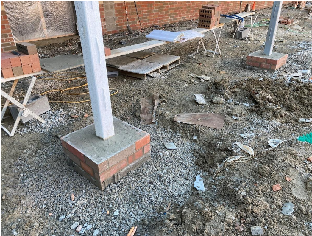
Brick masonry is grouted solid at the base as specified.