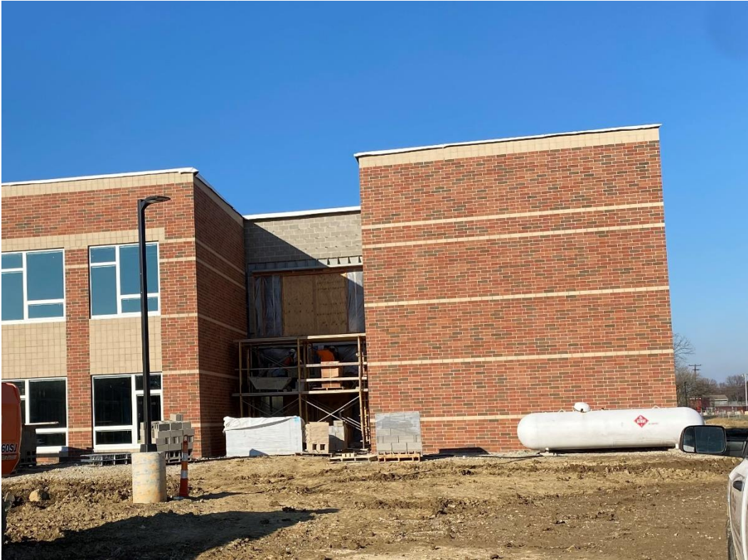
Brick masonry is being completed at the south entry to Area C.