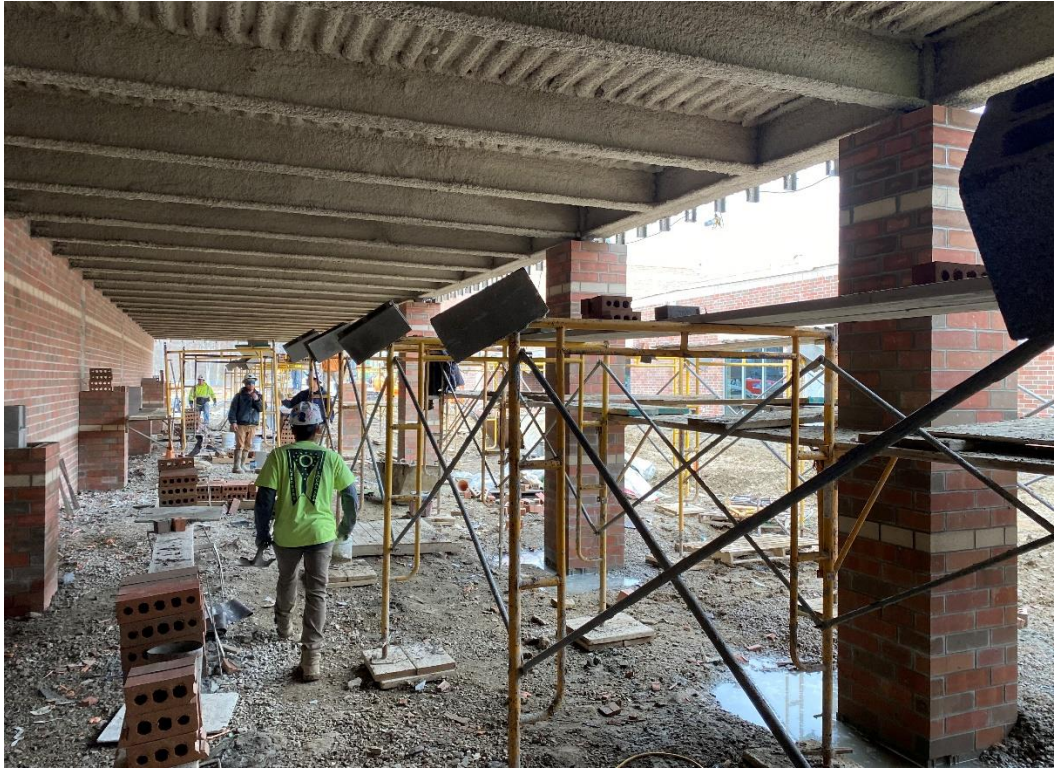
Brick enclosure of steel columns is nearing completion at the north entry to the performing arts area.