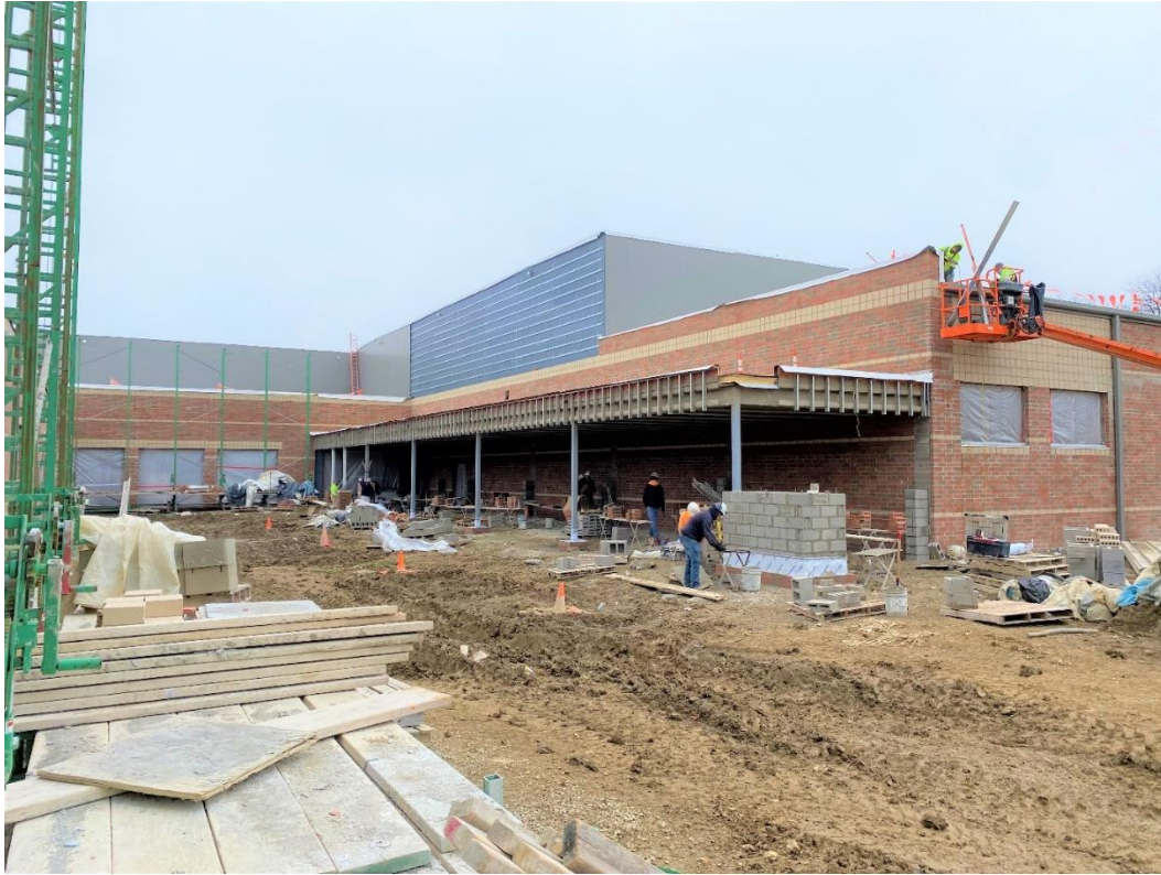
Masons are working on the brick enclosure of steel columns at the north entry canopy.