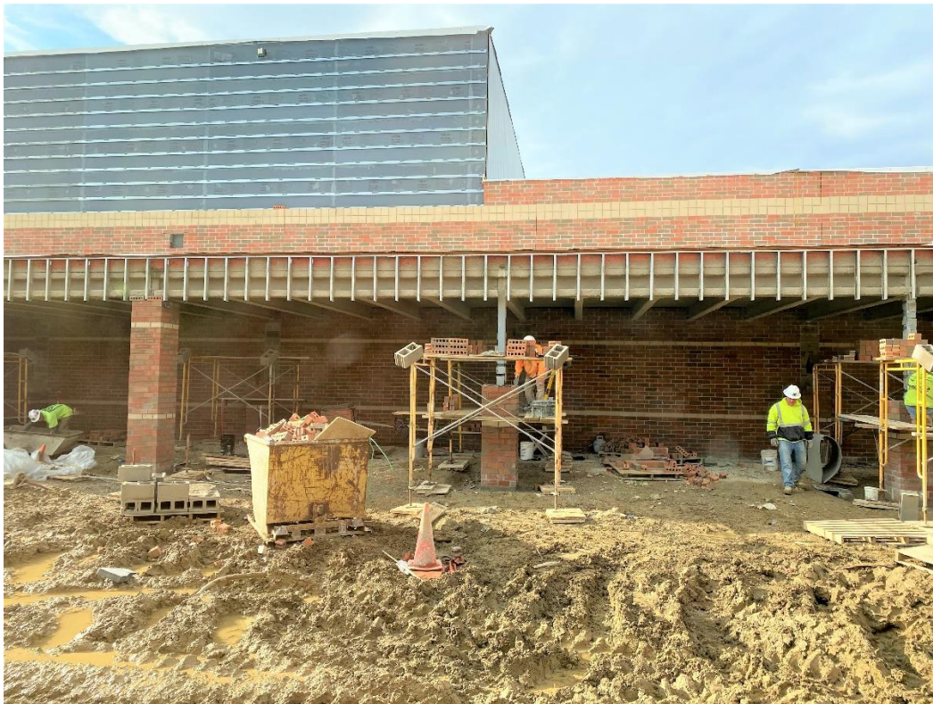
The upper east wall of the performing arts center is ready for metal siding.