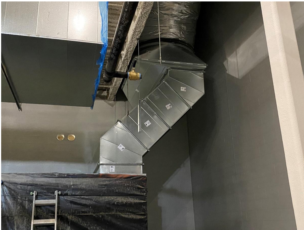
Final duct connections are made to the air handler that serves the Gym.