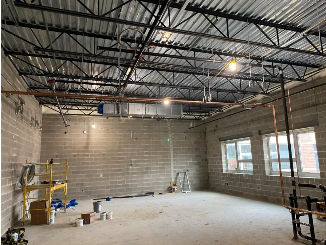
Installation of VAV boxes in Area C classrooms.