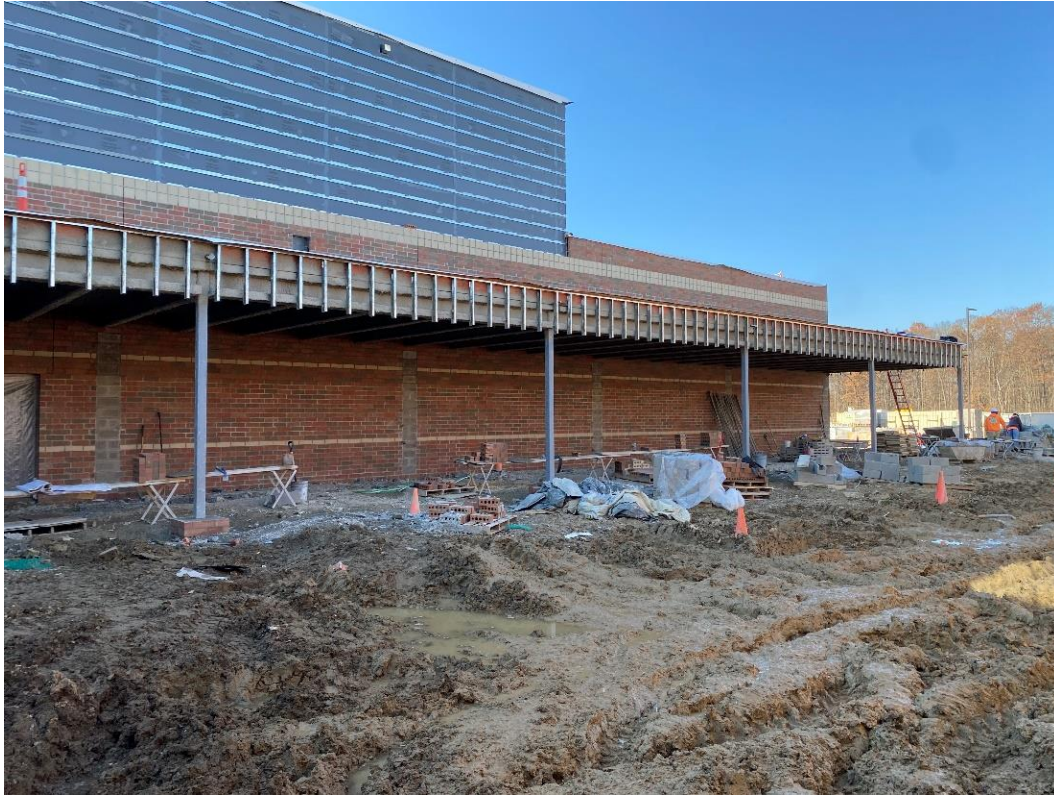
Brick masonry is nearing completion at the east wall of Area F. Brick masonry piers are in progress.