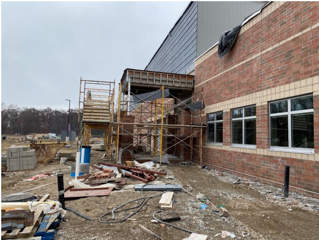
Brick enclosure of steel columns at the west entry is 50% complete.