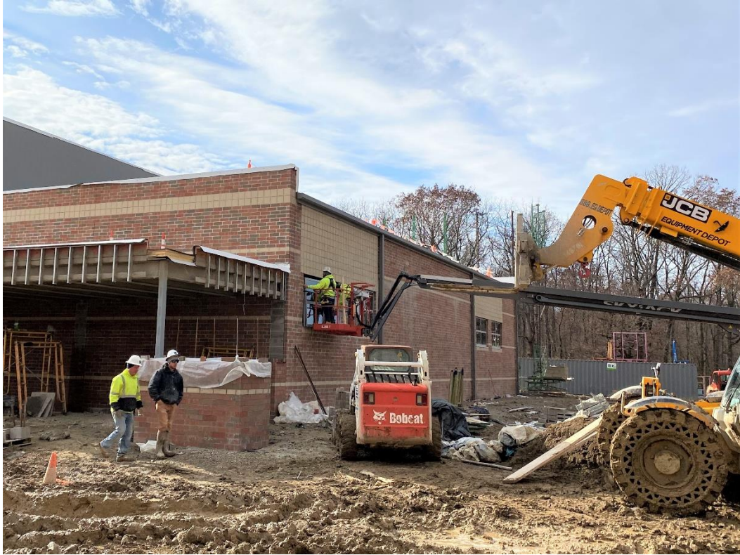
Installation of windows in the music classrooms is nearing completion.