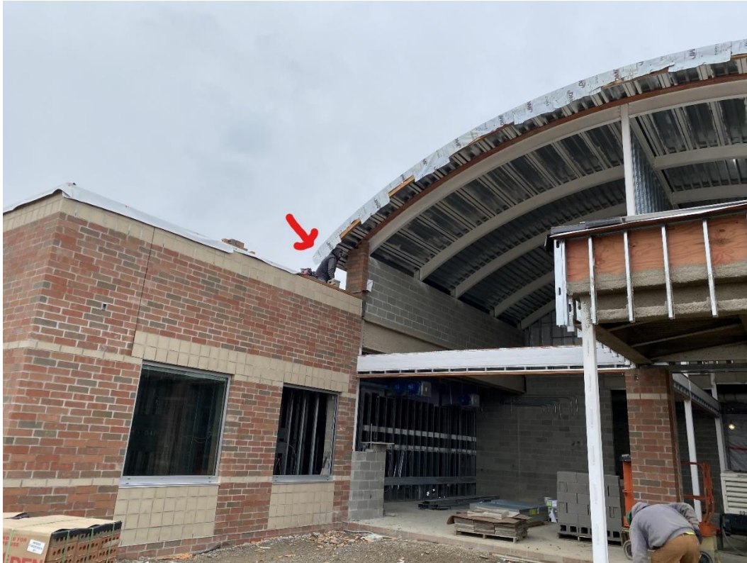
Masons are completed brickwork each side of the main entry arched roof.