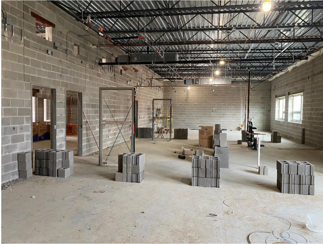
Steel door frames are set and masons are preparing to start interior non-load bearing masonry walls in the self-contained classrooms, Area B.