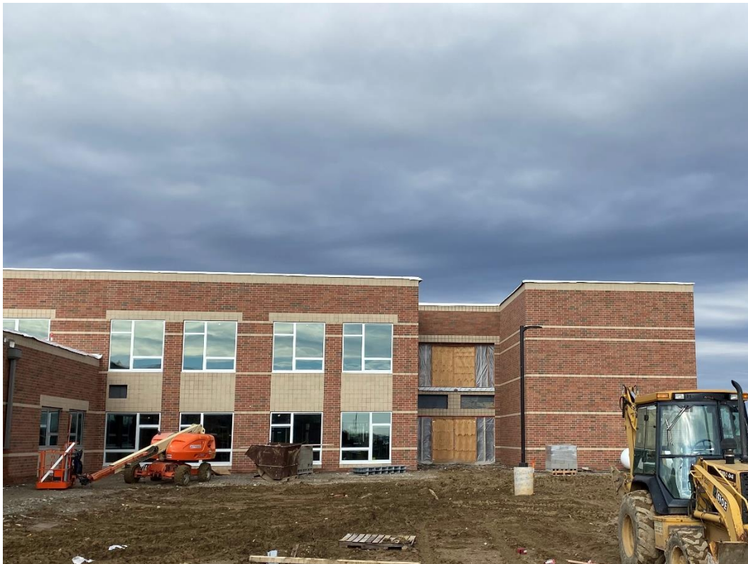
Brick masonry is complete at the south exit, Classroom Area C.