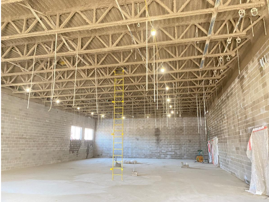
Fireproofing of structural steel is complete in the music classrooms, Area F.