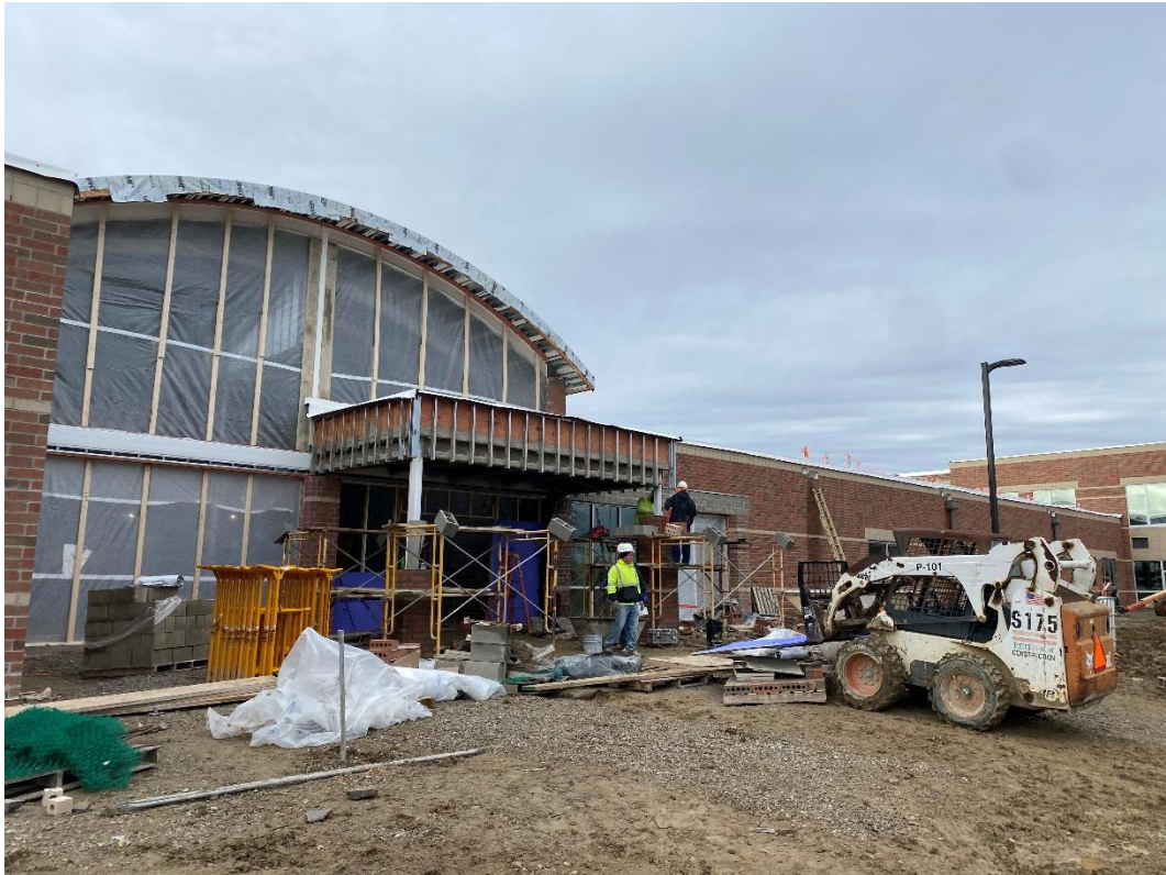
Brick enclosure of steel columns at the main east entry has started.