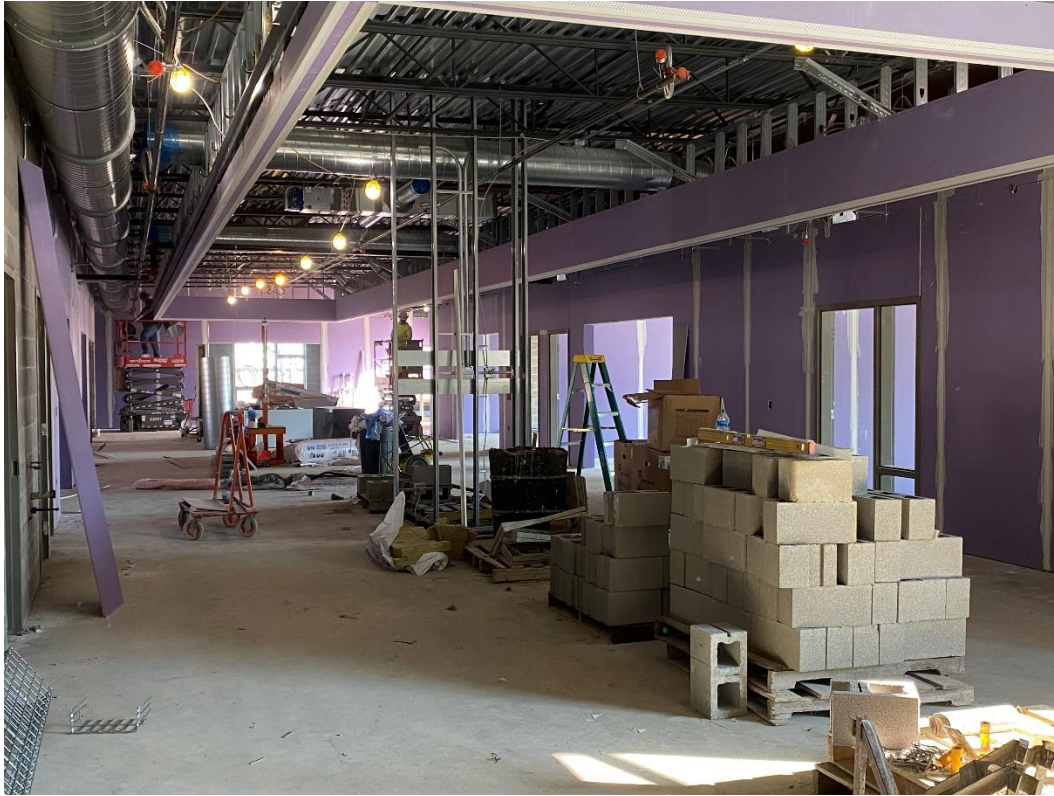
Drywall taping and finishing has started at the second-floor level of Area C.