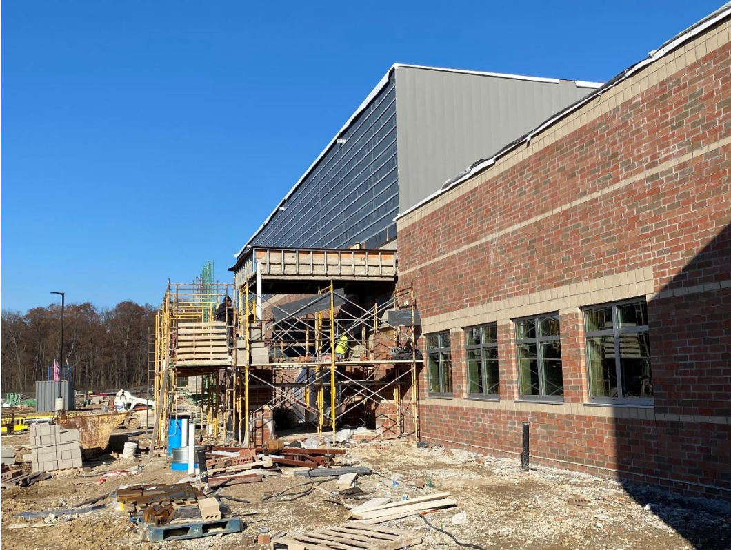
Brick masonry is progressing at the column enclosures at the west entrance.