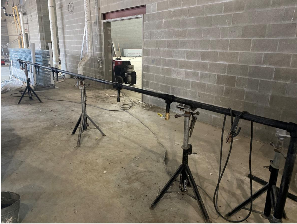
Fire protection piping with sprinkler head drops being fabricated for installation.