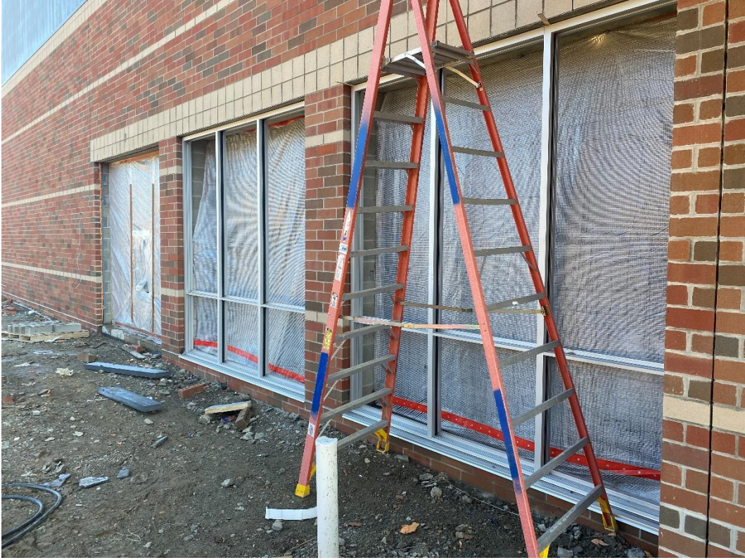
Aluminum storefront framing is being installed at the west wall of the Performing Arts Center.