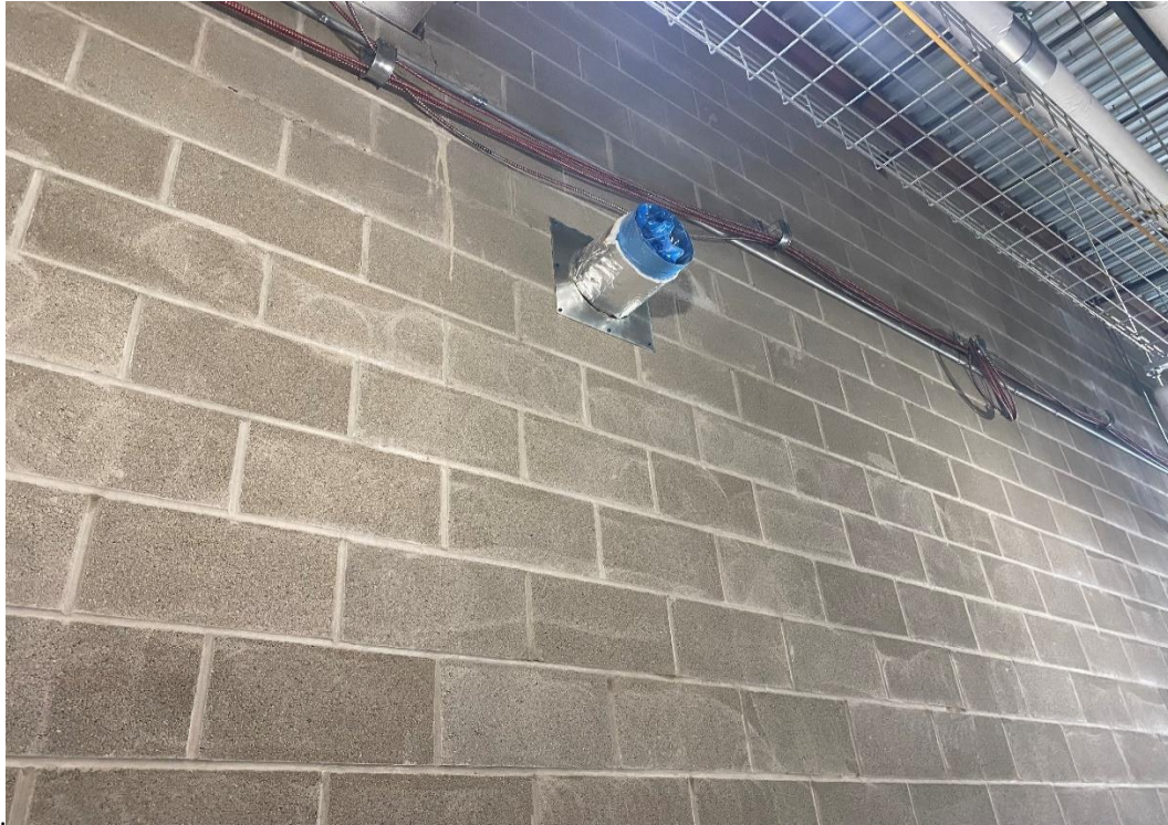
Masonry walls are pointed, ground, and prepared for painting at Area C, Second-Floor. Duct penetrations are fitted with sheet metal flanges and will be sealed.