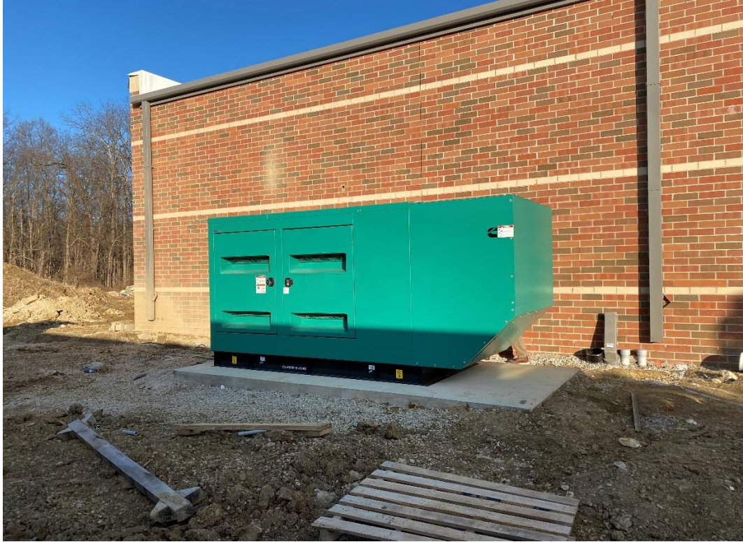
The emergency generator is now installed on the concrete pad.