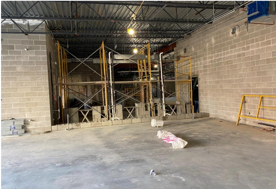
Construction of interior non-bearing masonry walls are progressing in Area B.