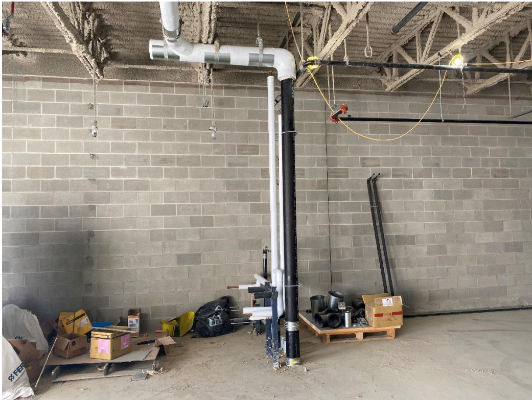
Domestic water, sanitary, and storm drainage plumbing lines are roughed-in ahead of masonry work in the Locker Rooms