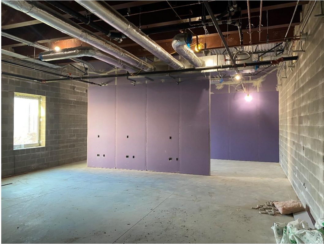
Drywall installation is complete in Area C.