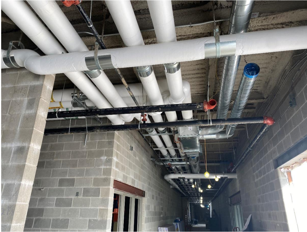
Plumbing, HVAC hydronic, gas service, fire protection lines, and HVAC VAV boxes and ductwork in a coordinated "bowl of spaghetti" in the above ceiling area east of the Locker Rooms.