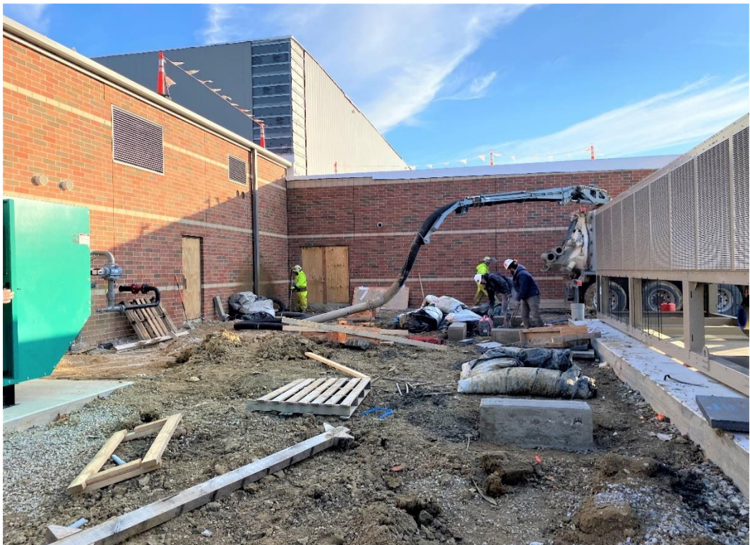
Crews from R D Jones are excavating for below grade downspout lines that tie to the catch basins and manholes of the site storm drainage system with a water jet and vacuum process. Because there is so much other below grade electrical and plumbing lines in this area, this is the safest way to complete the trenching without risk of damaging adjacent below grade utilities.