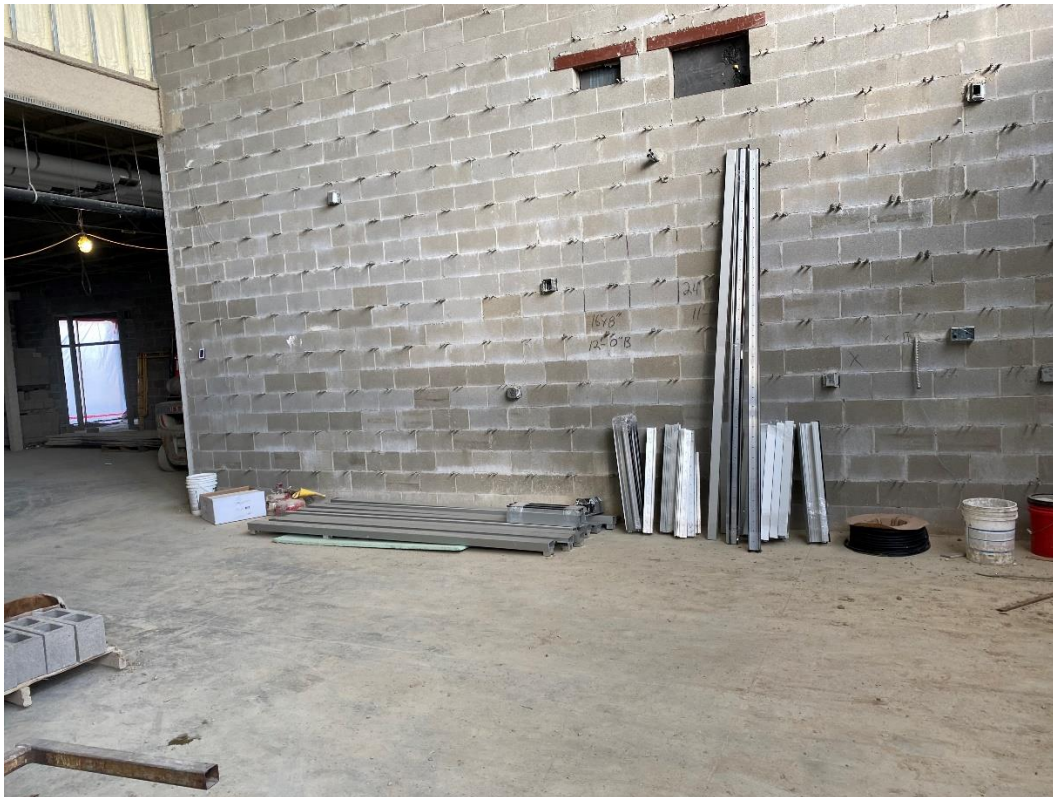
Aluminum storefront material is staged for installation at the main east entrance. The 1916 and 1926 date stones will be installed on this wall.