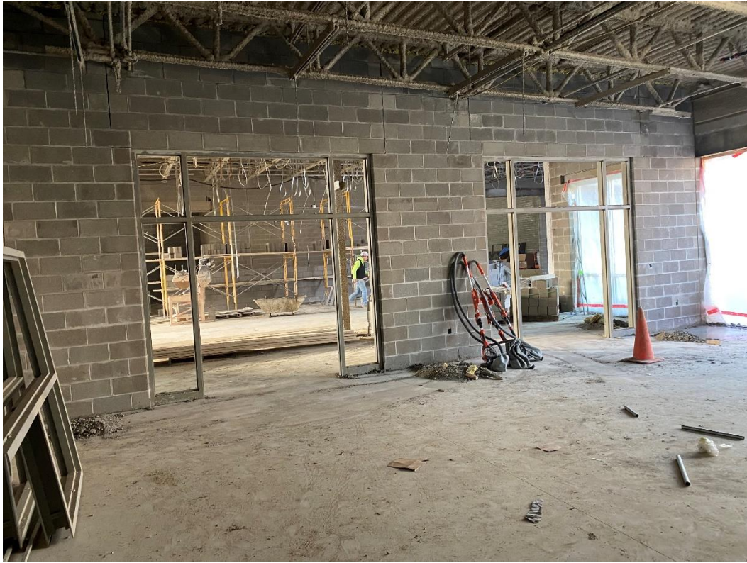
The south wall of the Engineering Lab is complete. View looking south toward the Gym.