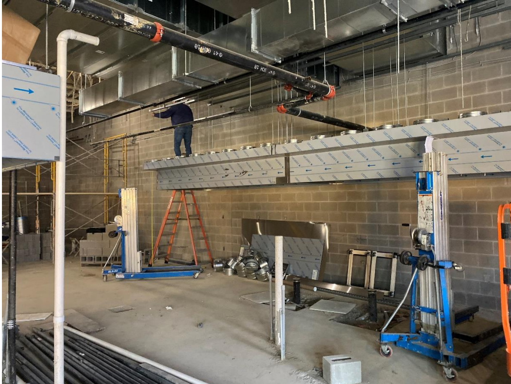
Work on the Kitchen exhaust hood continues.