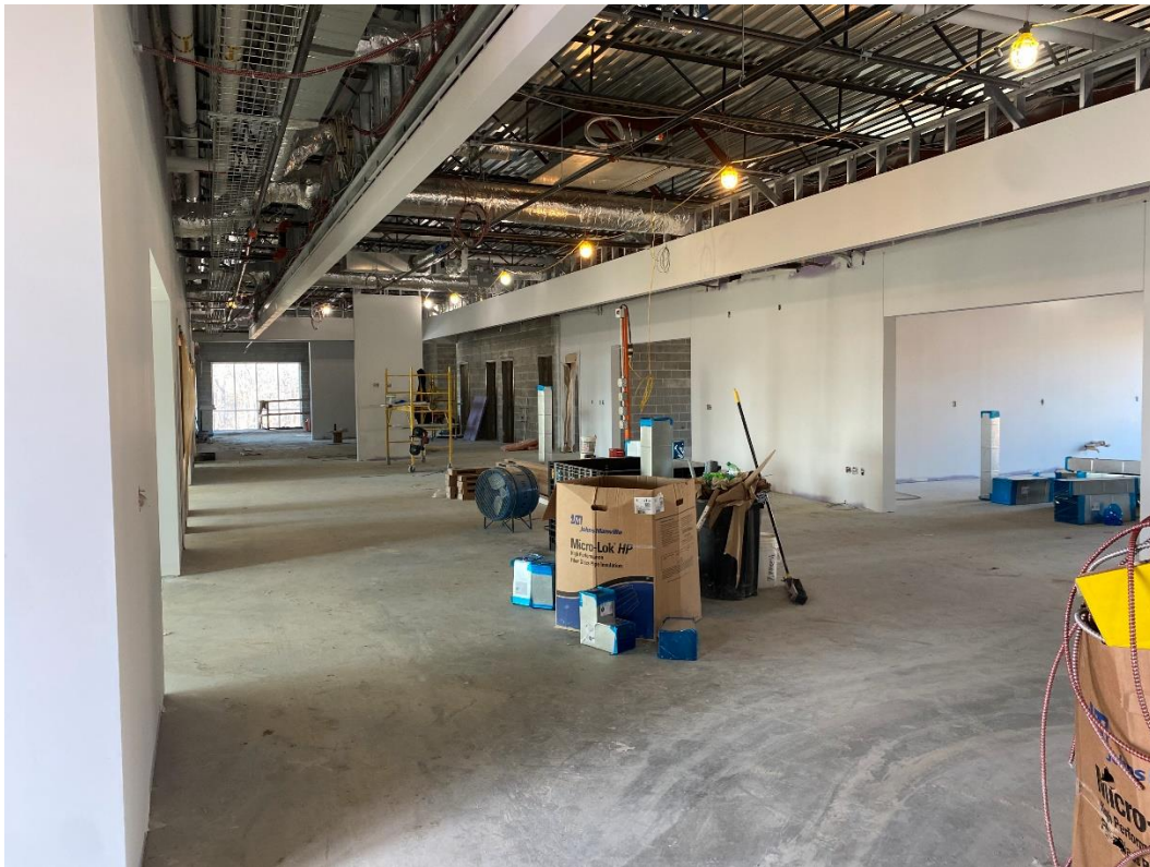
Drywall is prime painted at the second floor of Classroom Area C.