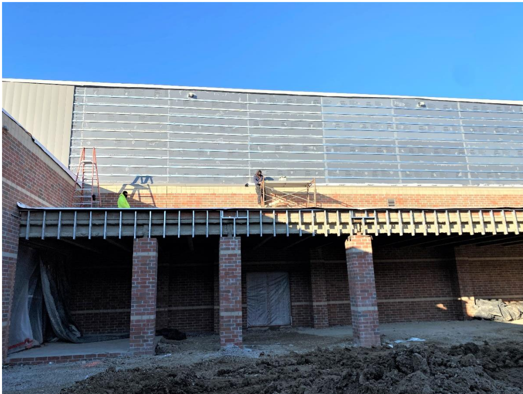
Crews are finishing the base flashing for the metal siding panels above the north entry canopy. View looking west at the Performing Arts Center.