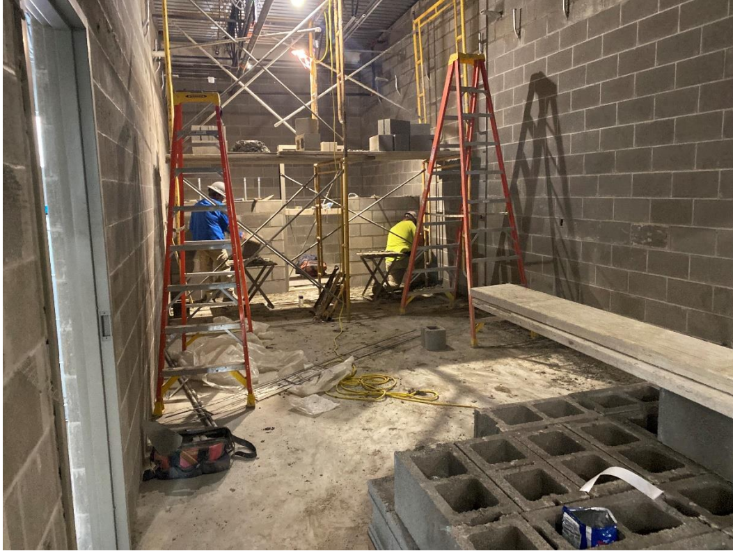
Construction of interior masonry walls in Area B, Art Material Storage is progressing.