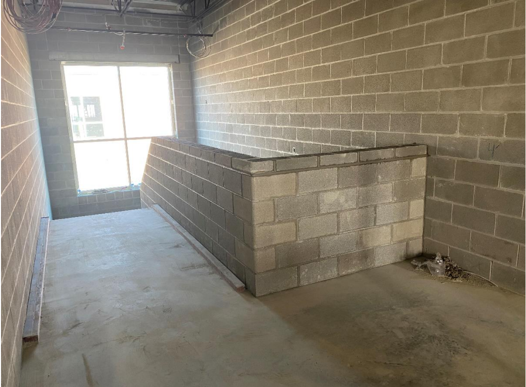
The masonry handrail wall is complete at the north Stair in Area C.