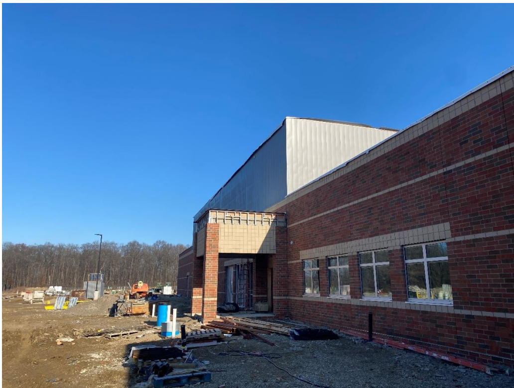
Metal siding on the west and south sides of the Performing Arts Center is complete.