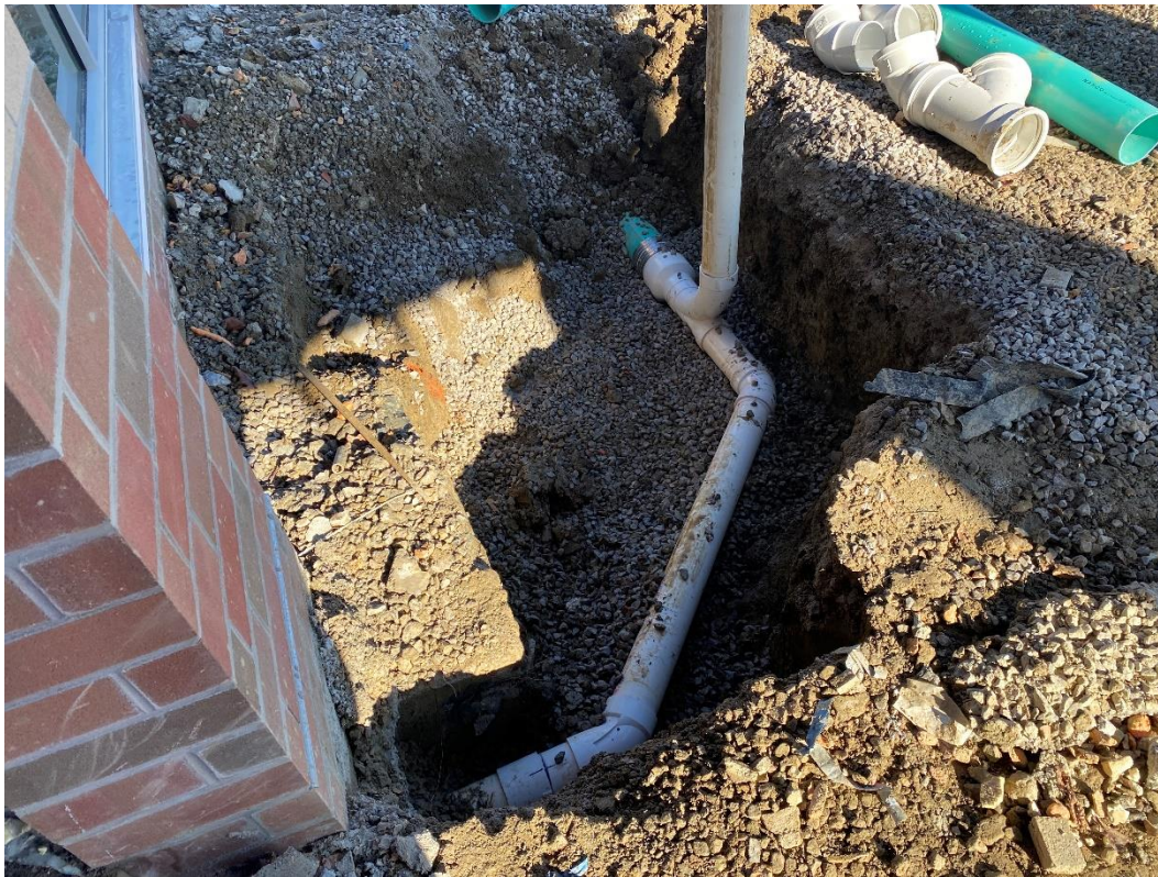
Below grade storm piping at the east front entry.