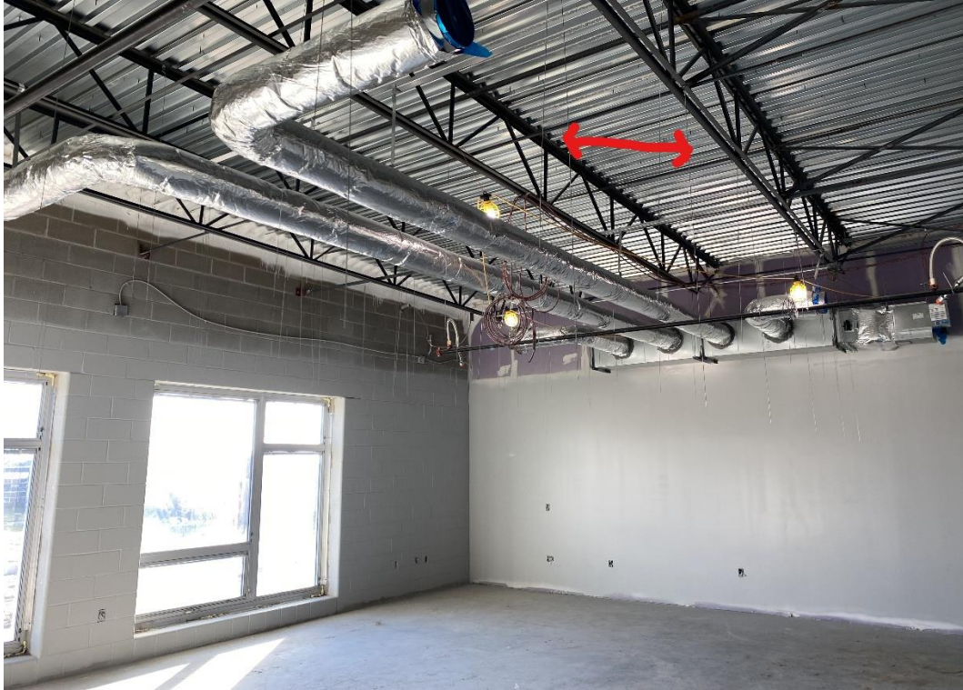
Suspension wires for the suspended acoustic ceiling are being installed at the second floor of Area D. Installation of ceiling grid will start in January. This is a little difficult to see.