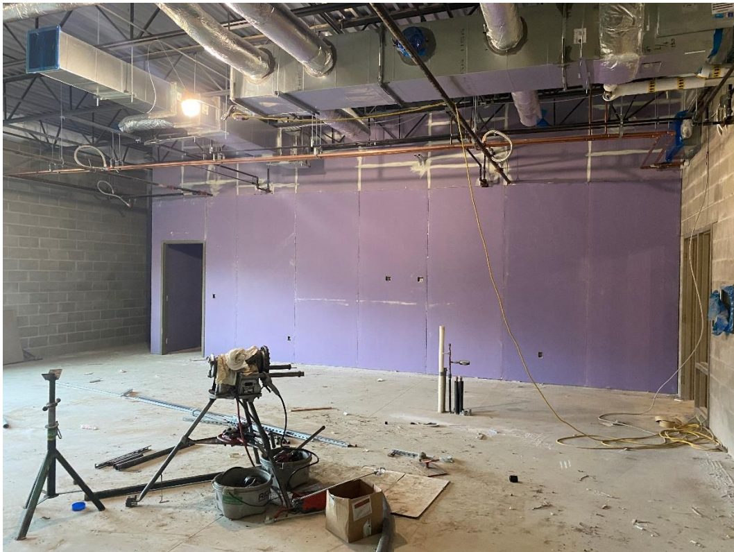
Drywall installation, Area C.