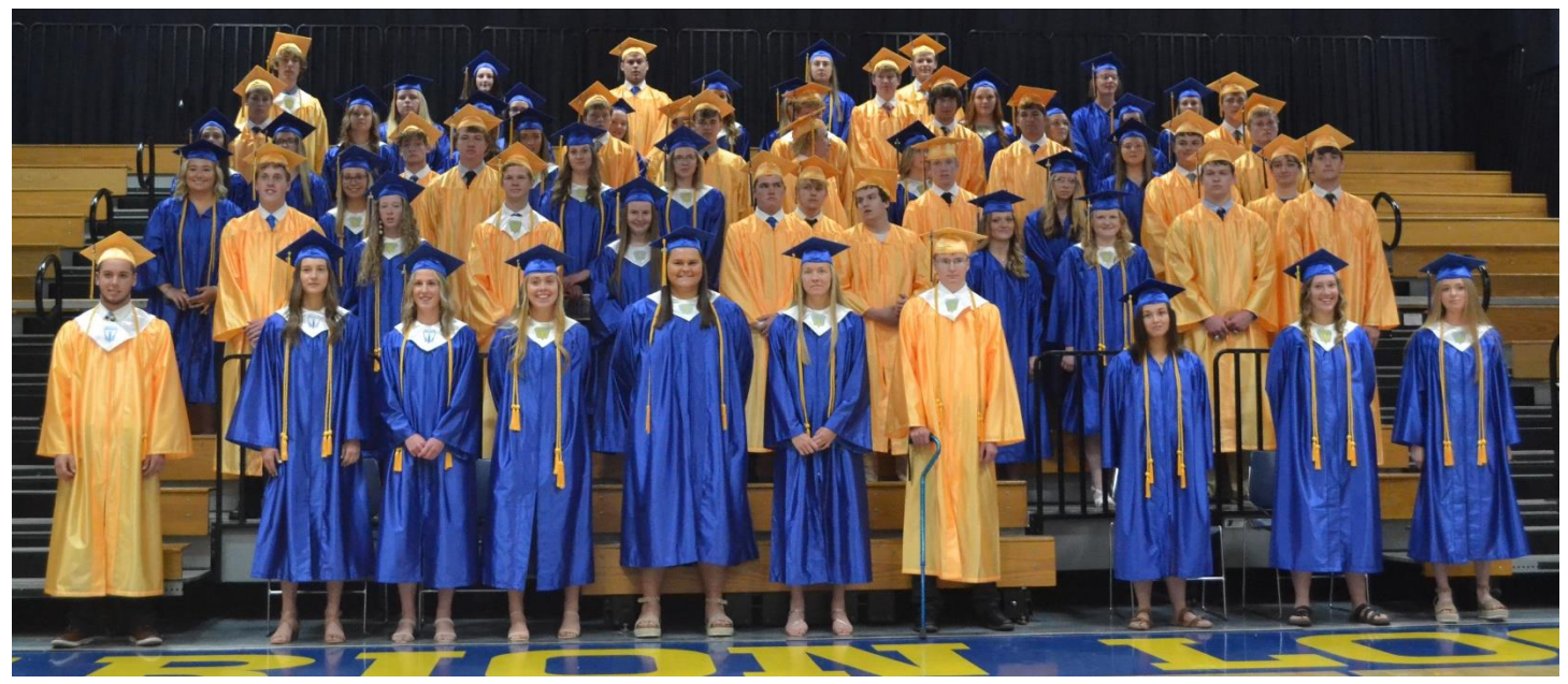
CONGRATULATIONS CLASS OF 2022!!