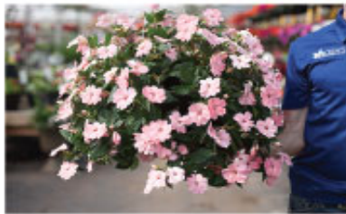
HANGING BASKETS single & combination varieties from $19.99-$42.99