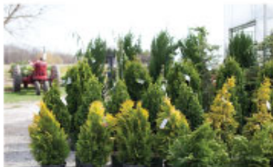
TREES & SHRUBS evergreen and deciduous

SHOP HOEN'S FOR THE LATEST TRENDS TO BEAUTIFY YOUR INDOOR AND OUTDOOR LIVING SPACE!