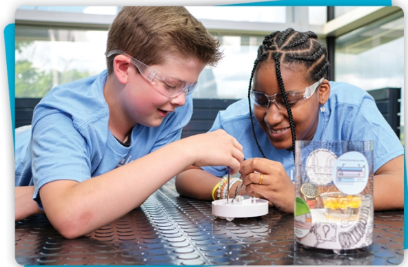
Fourth graders gain confidence while reverse engineering their robotic lab-on-wheels.