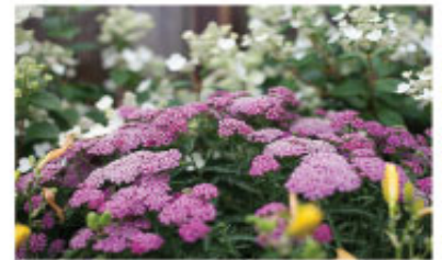
PERENNIALS flats & potted varieties from $4.99 and up

*Hoen's is not liable for lost or stolen cards.