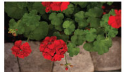
ZONAL GERANIUMS 5.5" to 12" pots from $5.99 - $25.99