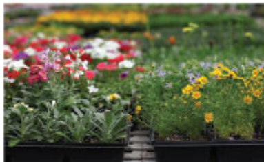
ANNUAL FLATS 32 plants per flat (8 paks) from $12.99 - $19.99