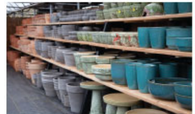
POTTERY ceramic, clay, stone and more