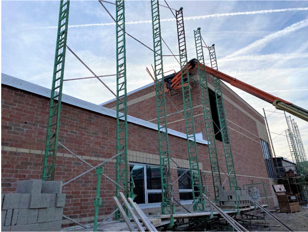
Crews are securing the roof membrane at Area C in preparation for gutter and downspout installation.