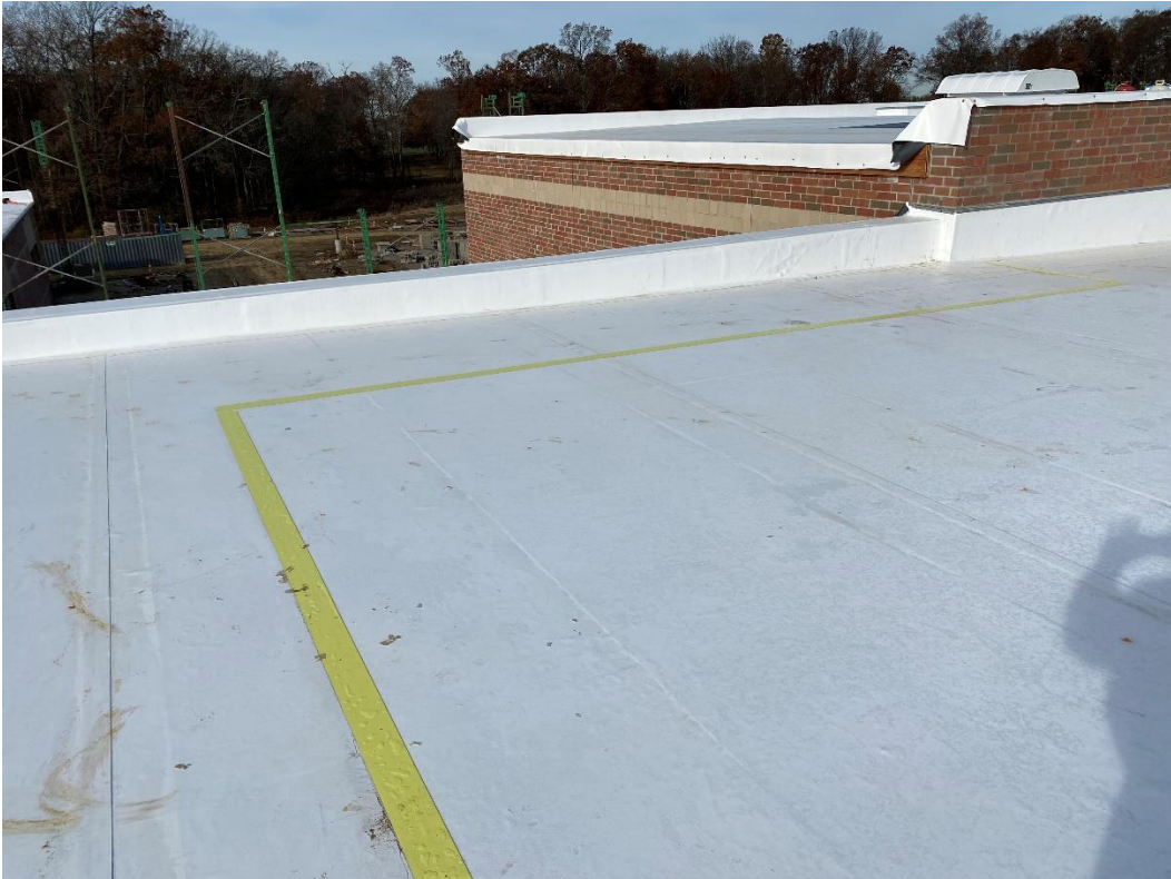
Caution tape is installed at the roof perimeter of Area C.