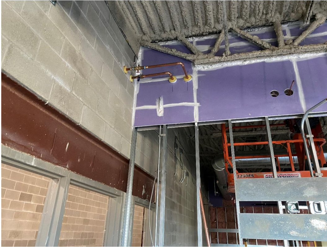
Water lines are being installed to the VAV boxes in the Administrative Offices.