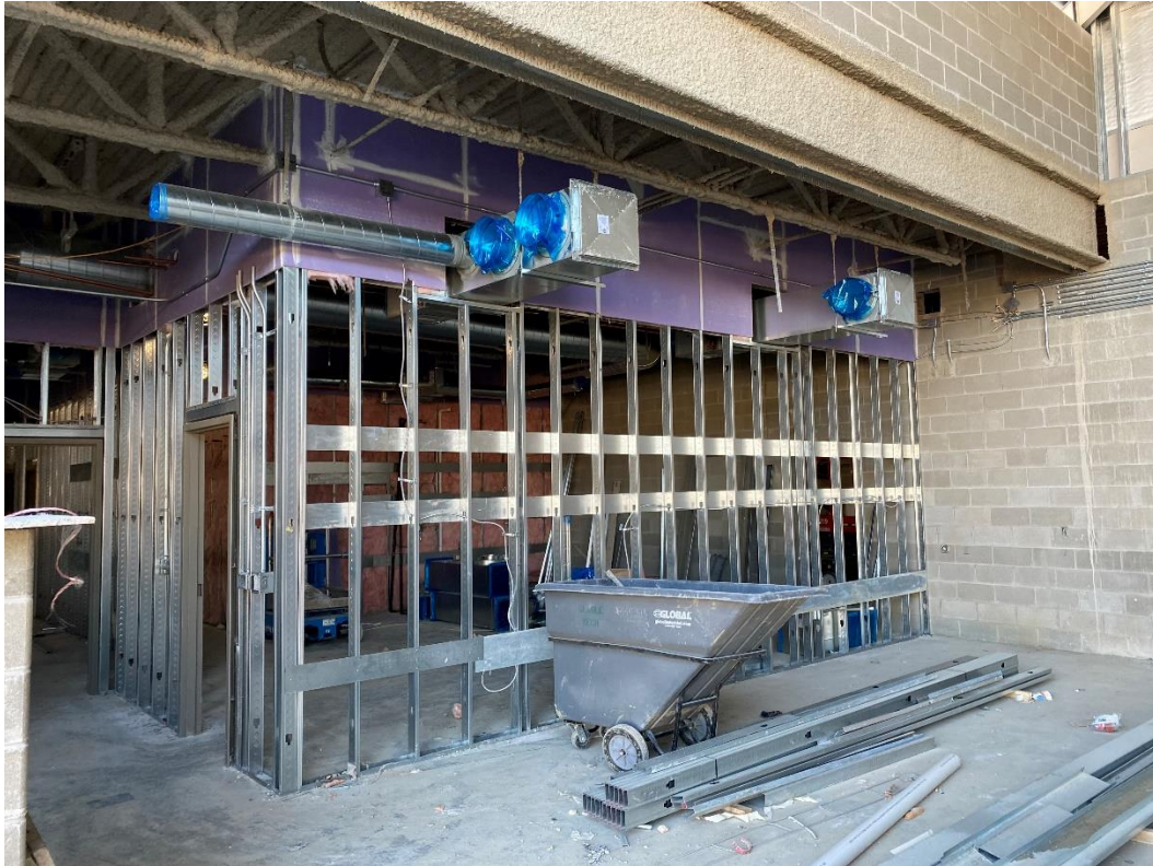
VAV boxes are installed at the front reception office area.