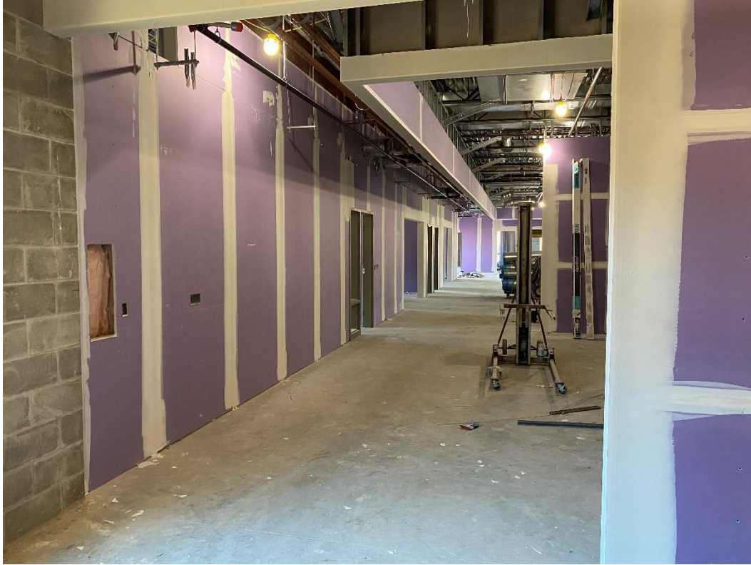
Taping and finishing of Area D drywall.