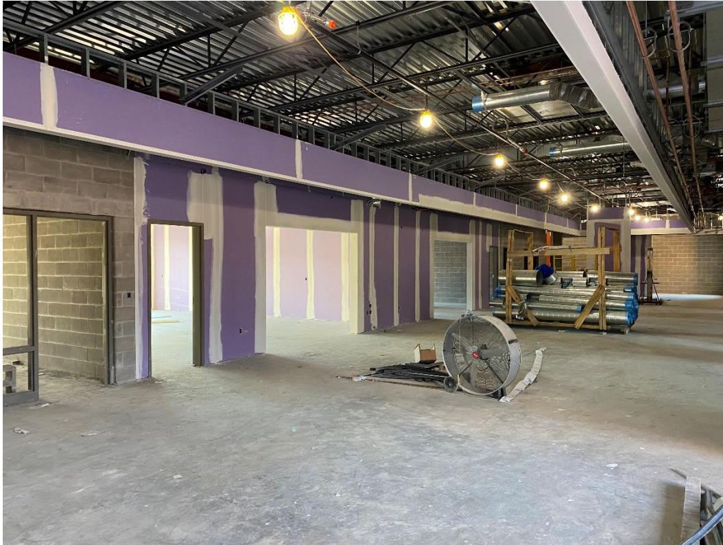
Taping and finishing of drywall is progressing at the second floor of Area D.