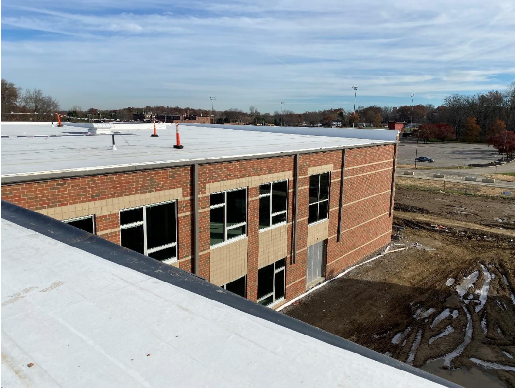
Metal gutter and downspouts are installed on the south wall of Area D.