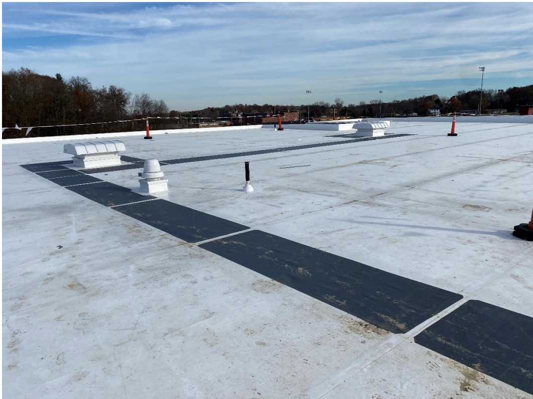
Roof walkway is installed to service rooftop ventilators and exhaust fans. Area D, looking NE.