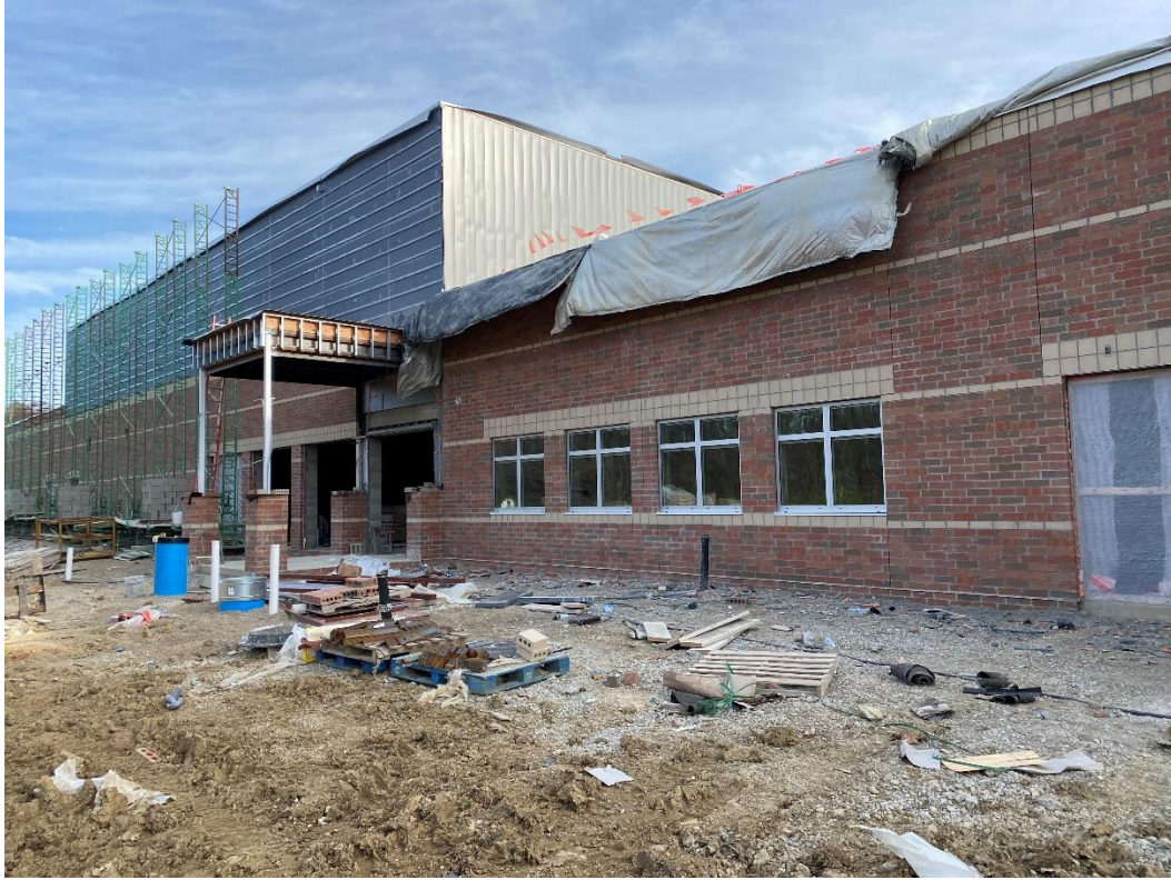
Brick masonry is complete on the west wall of the kitchen and windows are installed. Brick masonry needs to be cleaned.