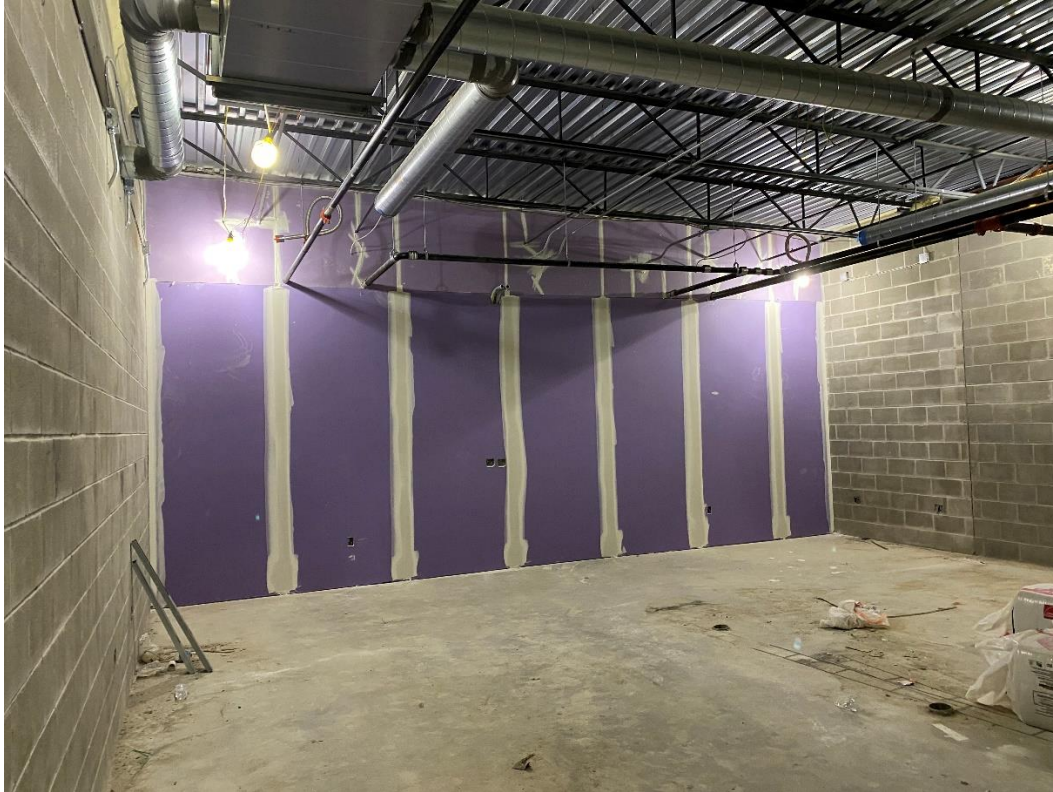
Drywall work is progressing into Area C.