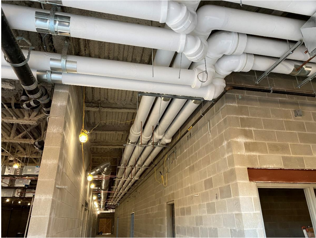
Pipe insulation work is complete at the main hall north of the Locker Rooms.