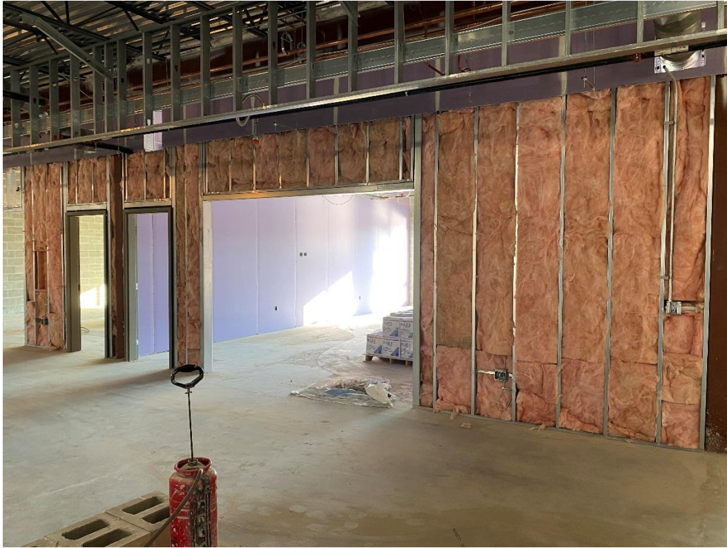
Acoustical insulation and drywall installation is progressing in the classrooms of Area C.