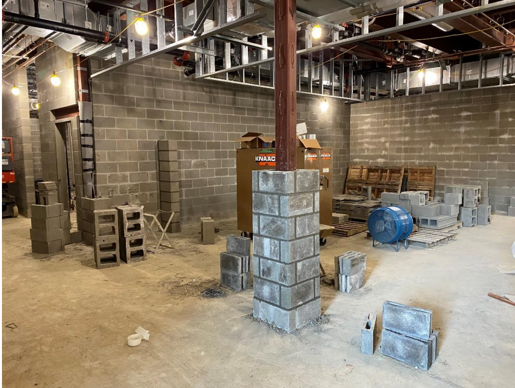
Interior masonry work continues in Area C.