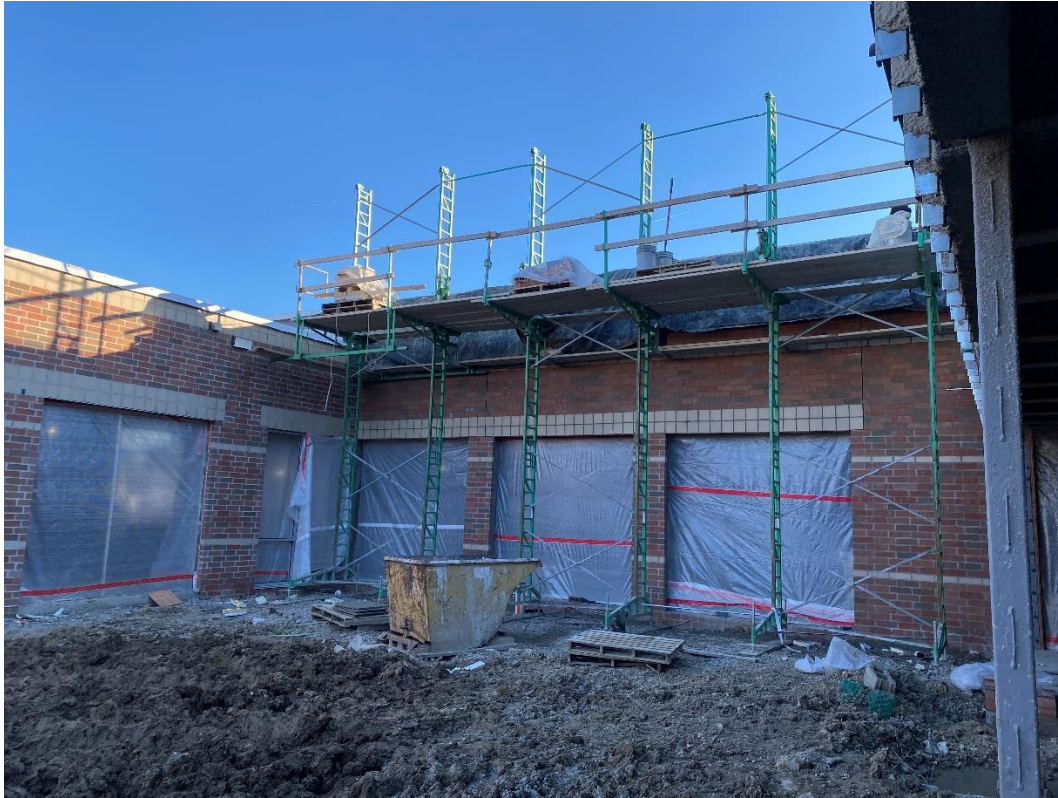
Brick masonry is complete at the north wall of Area B, Student Dining.