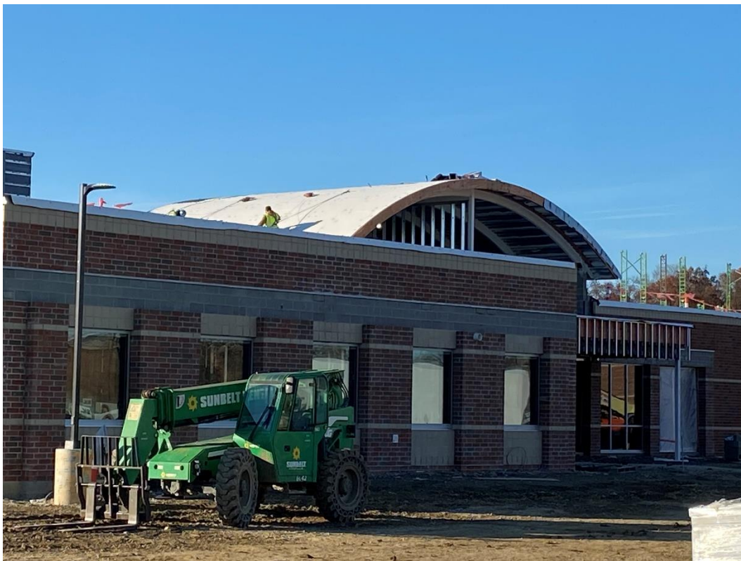
A waterproof membrane is being installed at the arched roof. This will be covered with standing seam metal.