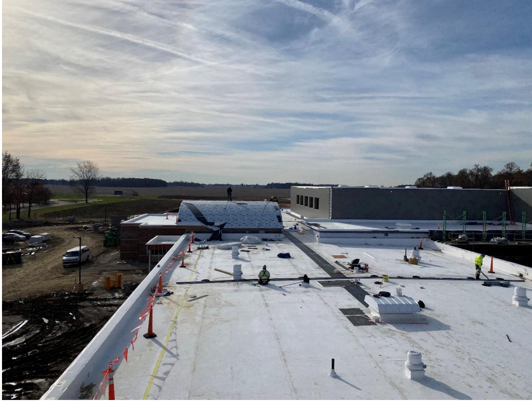
Roofing work is progressing on the arched roof of the main entry.