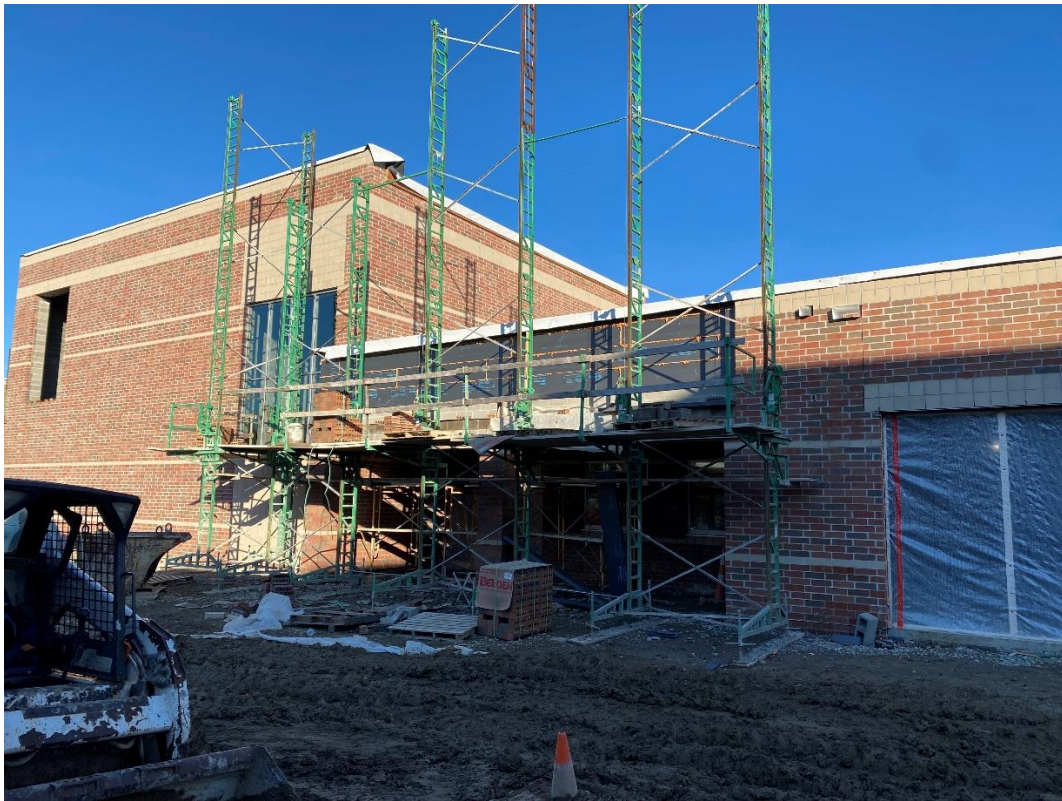
Brick masonry at the west entry to Area C will finish next week.