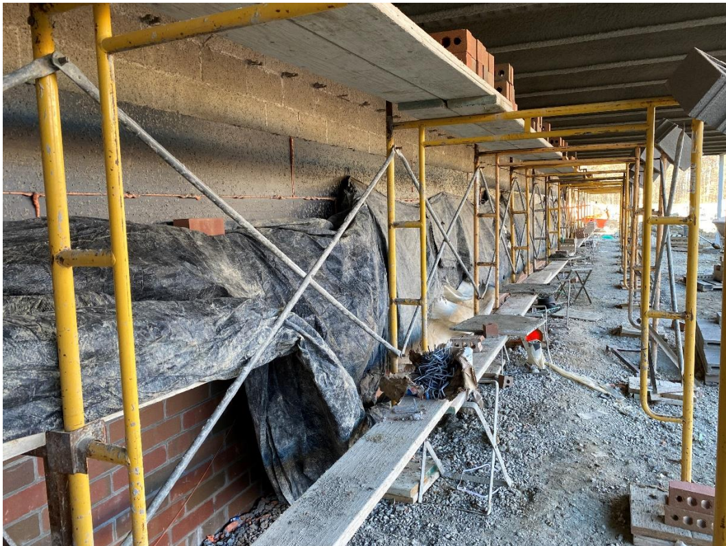
Masonry walls are covered for frost protection at the north entry canopy.