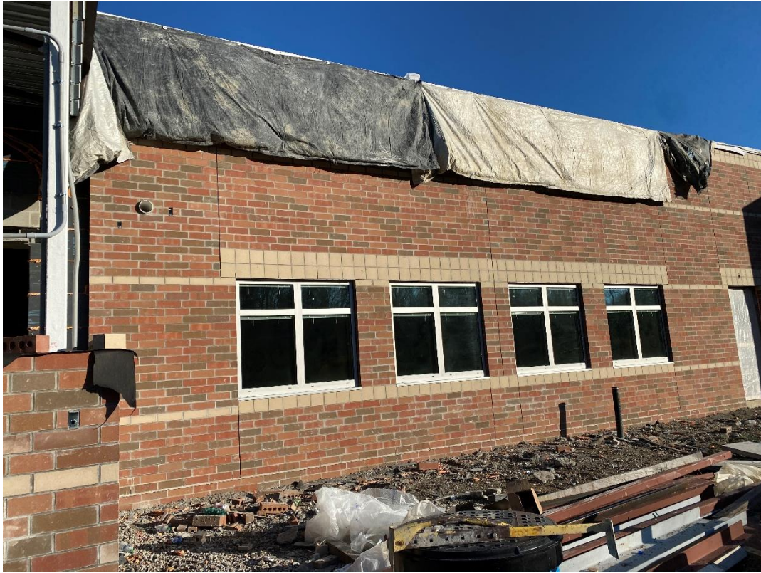
Brick masonry is complete at the west kitchen wall. Wall is covered for frost protection.