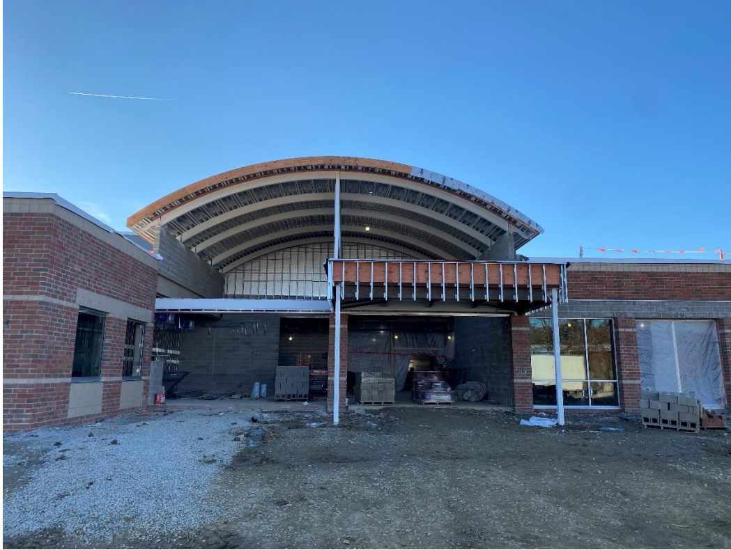
Roofing work is started at the main entry arched roof.