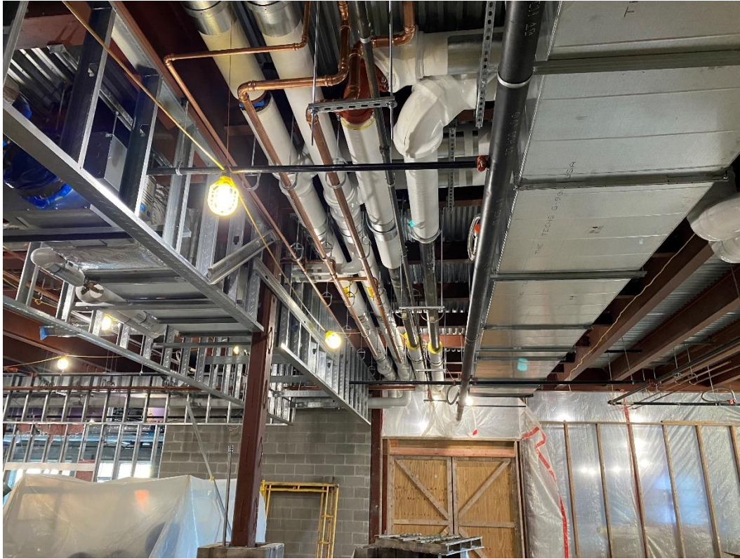
Pipe insulation work is progressing in Area C as well as water line installation.