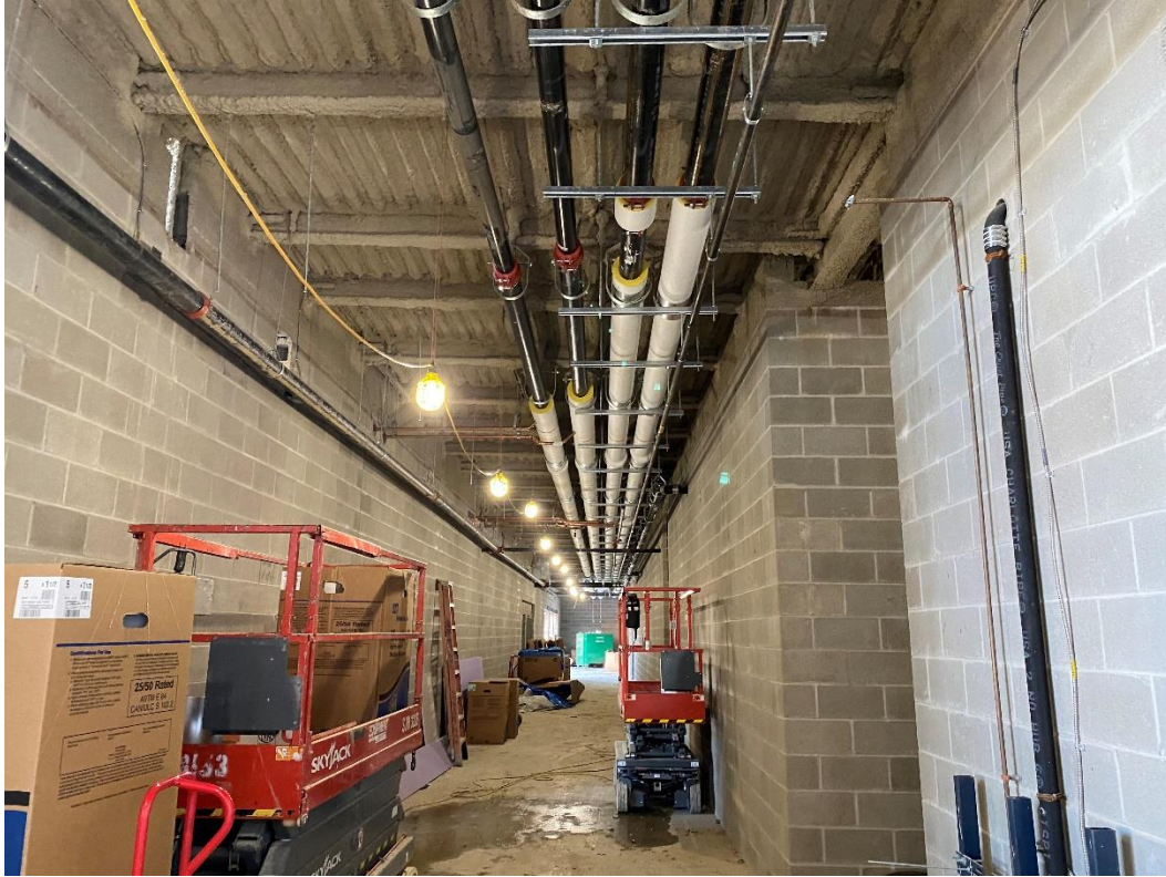
Pipe insulation work is progressing in the main hall west of the Administrative Offices.