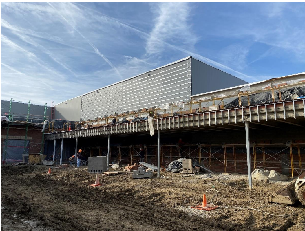
Masonry work is progressing above the roof line of the north entry canopy.