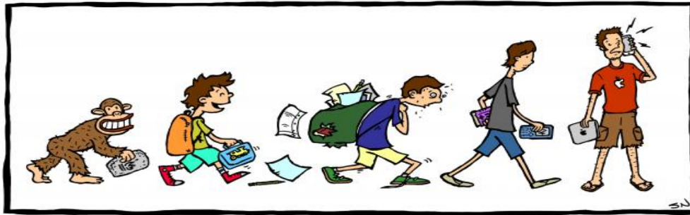
EVOLUTION OF STUDENT KIND

Five credits are required to be in grade 10.