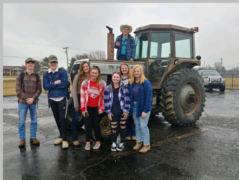
LEHS FFA students celebrated National FFA Week by participating in Tractor Tuesday and by adding to their "Greenhand Wall."