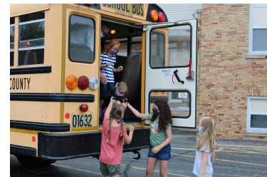
Students help others safely exit.