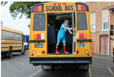
Students learn to open the emergency exit door.

Pickaway Elementary recently conducted evacuation drills. The drivers gave instructions on how to exit the bus and the students were focused on the goal...getting everyone off the bus safely and quickly!