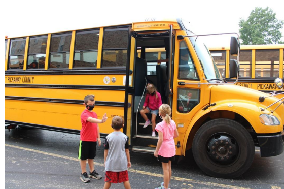
Students practice exiting the front door in the event of an emergency evacuation One student makes sure others know not to go back on the bus!