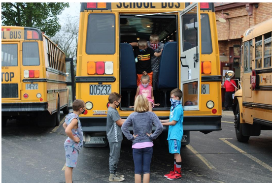
Students use teamwork to make sure everyone exits safely.