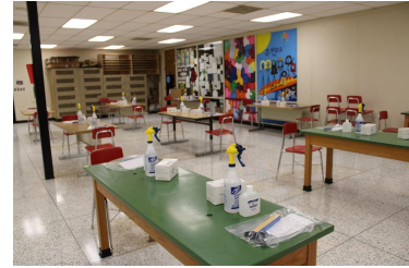
Cleaning and sanitizing supplies have been distributed to bus drivers.