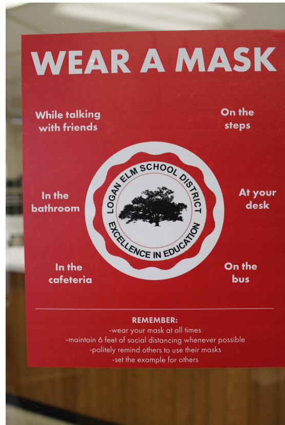
Masks are required for K-12 students, staff and visitors!