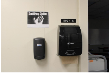
Hand Sanitizing Stations have been added to classroom areas.

Our staff has been busy this summer making changes to provide a safer environment for our students! We have followed recommendations from state and local health departments, the Ohio Department of Education and the Center for Disease Control (CDC). A few of the many changes are pictured below.