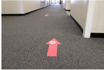
Arrows have been placed on floors to remind students of "one way" travel in rooms and hallways.