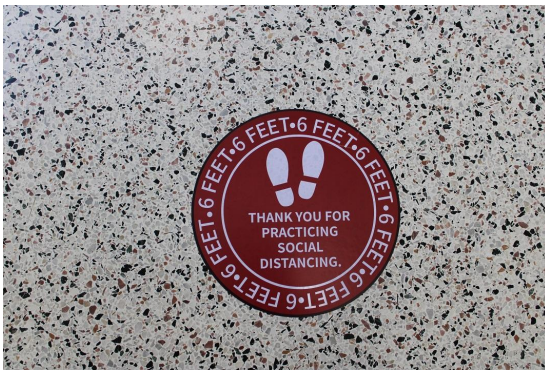
Floor markers indicate 6 foot distances...the recommended social distancing measurement!