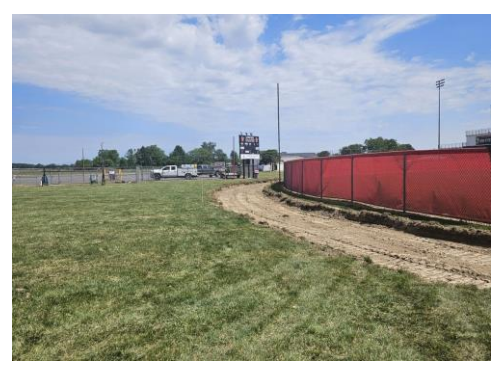
Walking path will join perimeter to track