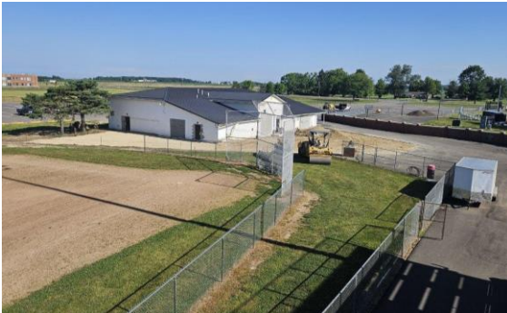
Renovated weight room and locker room