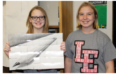
5th grade students were invited to present at the Logan Elm School board meeting.