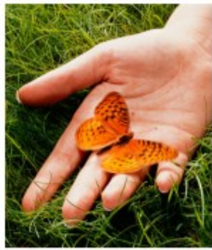
Kindergarten Registration Night is April 25th, 4:00 pm-7:00 pm @ Nordonia Schools Board of Education Office

**New for 2019: Full Day Kindergarten Registration deadline is May 31, 2019**