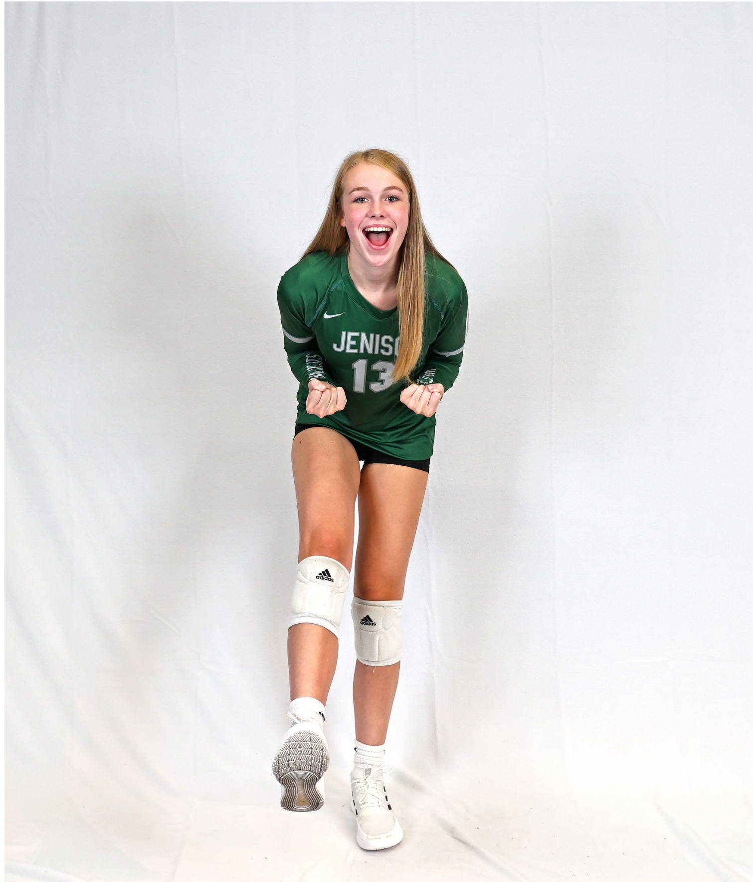
442 likes on Instagram