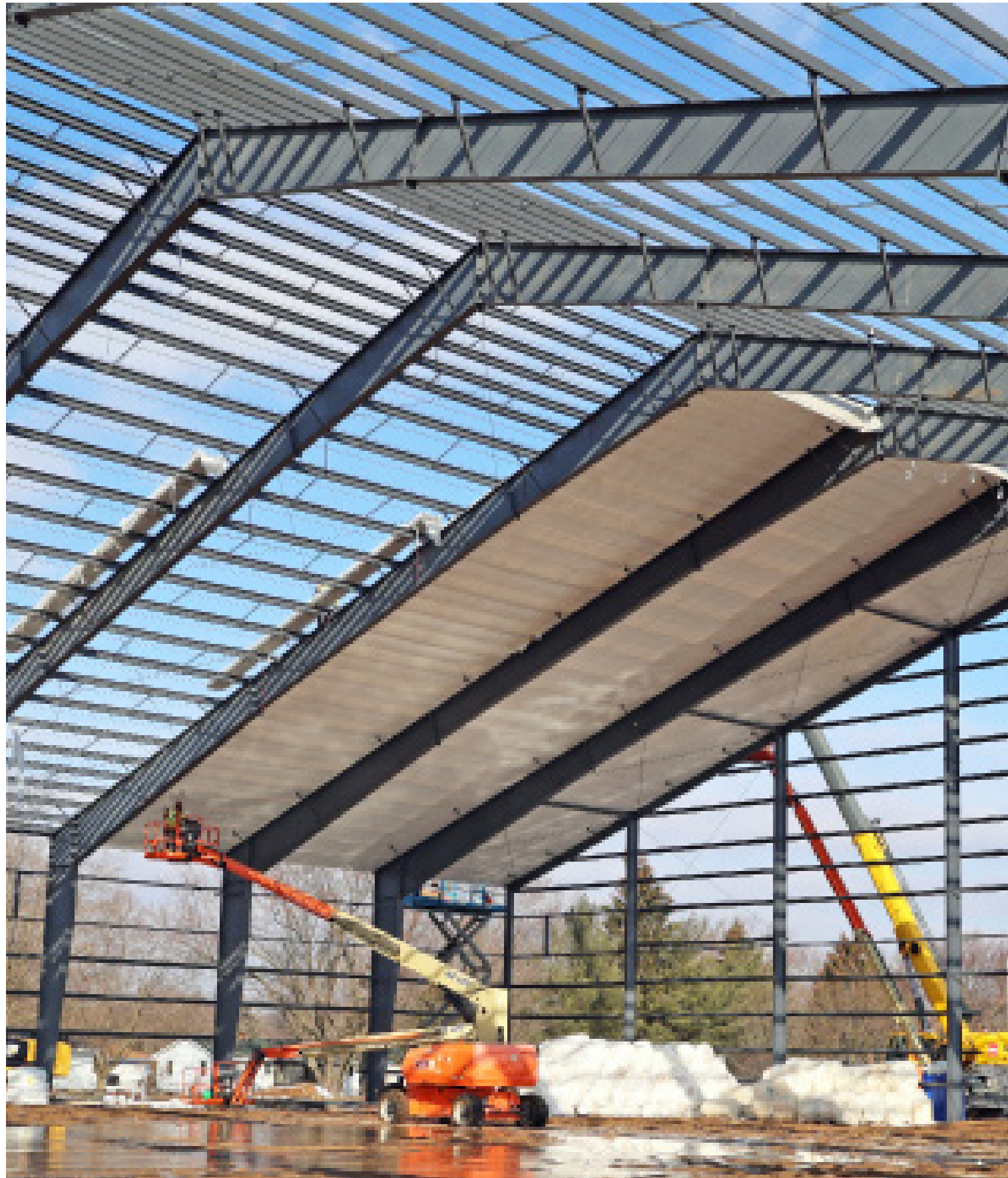
5,768 views on Twitter