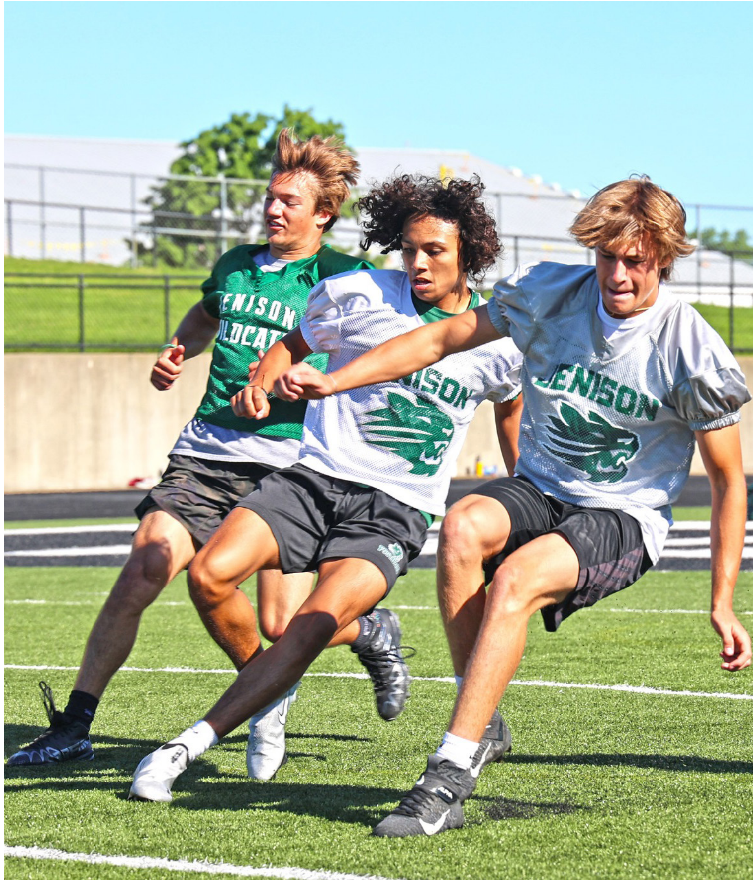
235 likes on Instagram