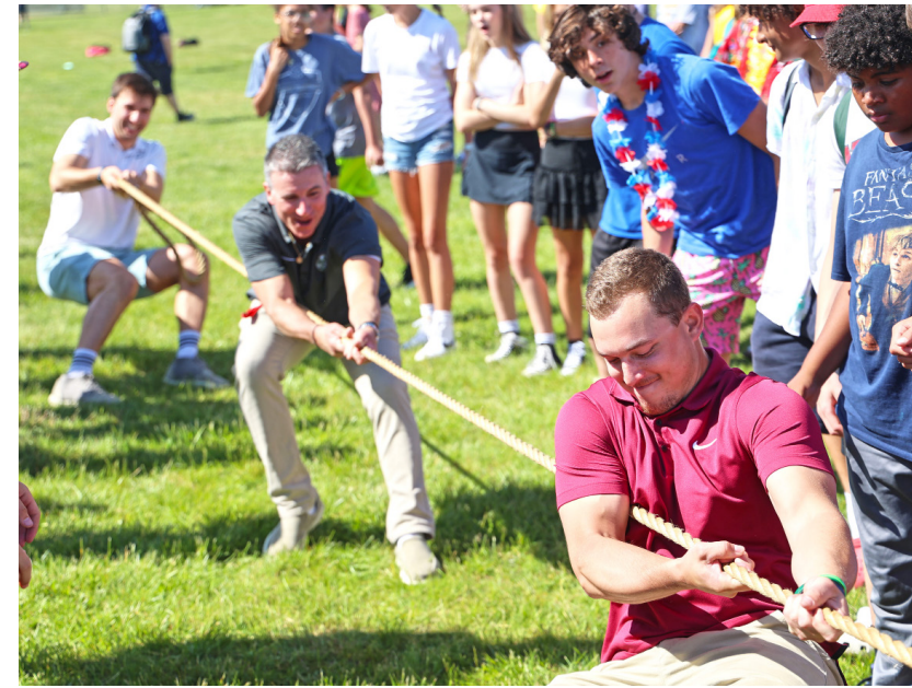
JPS celebrated the last day of school on June 2! Jenison Junior High hosted a giant tug-of-war competition in the fields behind the school to finish out the year. Staff took on students, boys faced off against girls, and sometimes it was a mix of everyone. There were so many laughs shared among students and staff throughout the activity. Fun idea Jenison Junior High!