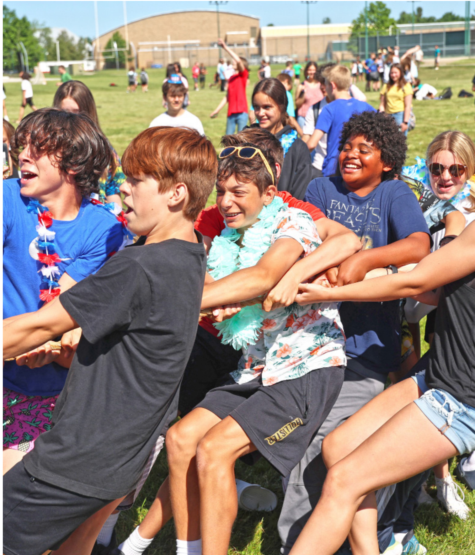
278 likes on Instagram