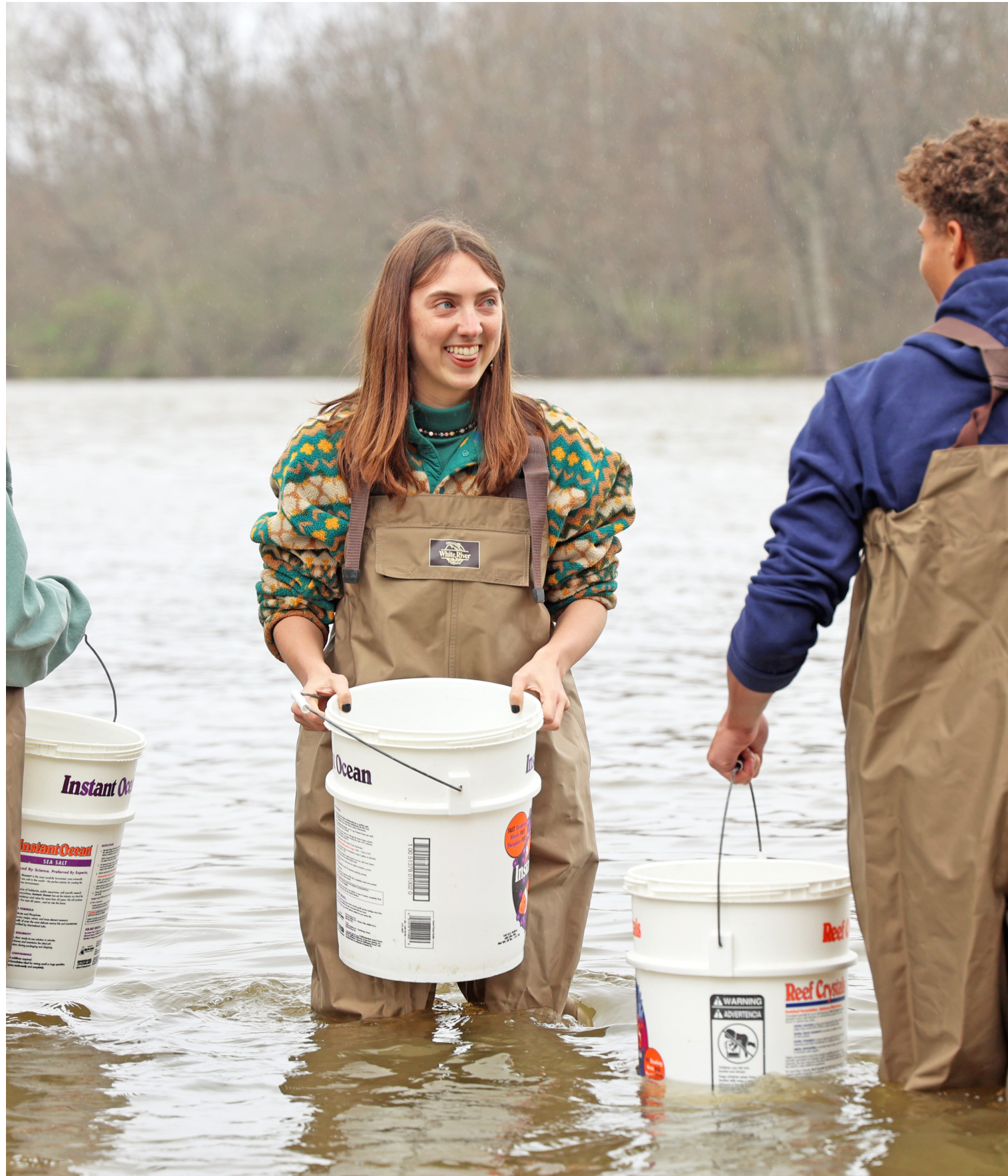
311 likes on Instagram