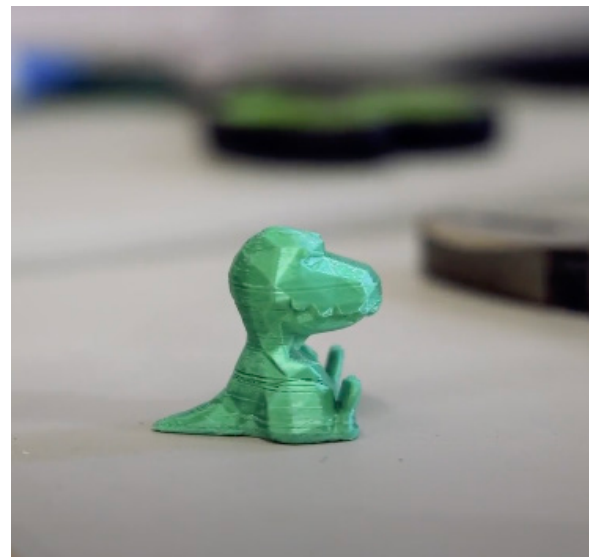
120 likes on Instagram

The students also won this year's Junior Achievement Pitch Day Challenge Award of $500 for their business creation. Enjoy this video that shows the entire process!