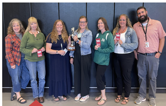
Summer Wrap Up-- WCS Climate Event Winners

More information and forms can be found at worcestercs.org .