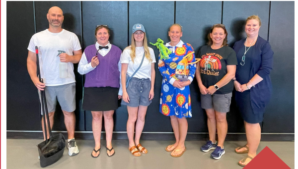
Climate Team Members preparing for staff team building activities.

During one of the Superintendent’s Conference days, our WCS Climate Team designed an event for all staff consisting of lunch, sponsored in part by New York State Insurance Reciprocal, and collaborative team building challenges. This was an exciting time for all members of the WCS staff to reignite their passion for the upcoming school year!