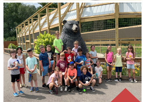
Summer Wrap Up— WCS CROP Students out and about!