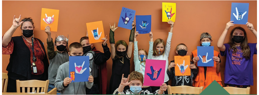
Students in the American Sign Language Workshop send their love!

This fall, students enjoyed a variety of school enrichment activities. This is a great opportunity for students to learn new skills and explore their interests.