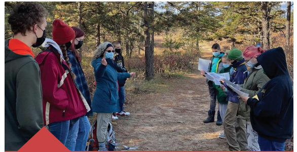
Envirothon Club – Field trips are back! The Envirothon Club visited the Albany Pine Bush to learn about the endangered Karner Blue Butterfly.

Art Club – It was a busy month of December for the WCS Art Club. Students made 22 ceramic trees as gifts for faculty and staff, who had to find them throughout the building. Club members also visited The Studio for Art and Craft in Cobleskill where they learned how to make fused glass dishes.