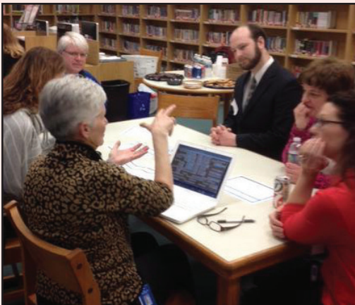
The Teaching, Learning and Technology Committee meets to discuss the role of technology in the classrooms now and in the future.

The Teaching, Learning and Technology committee has much to accomplish over the next few years but is moving forward to prepare our students for a digital future. •