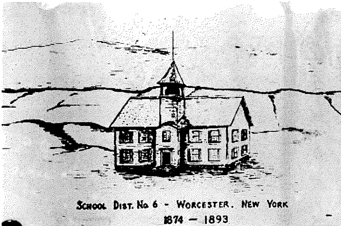
Picture of school dist no. 6 1874-1893