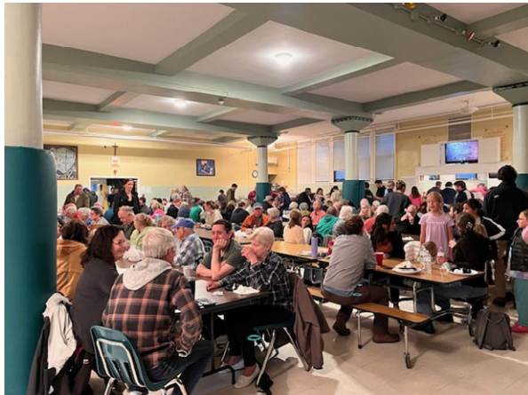
FUN AT THE FISH FRY