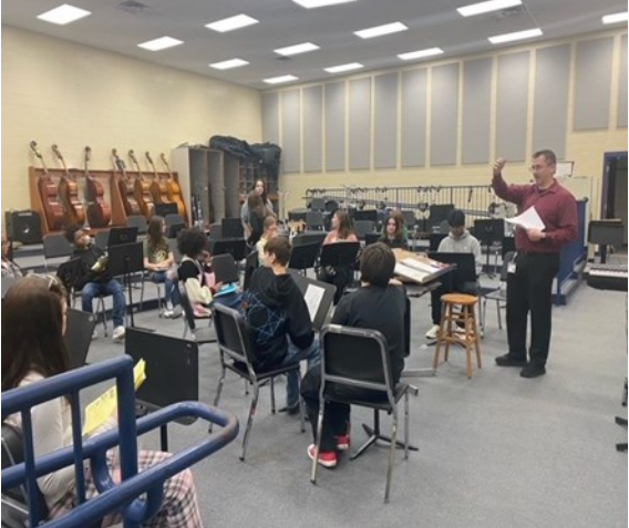
Feel free to contact us with any questions or concerns.